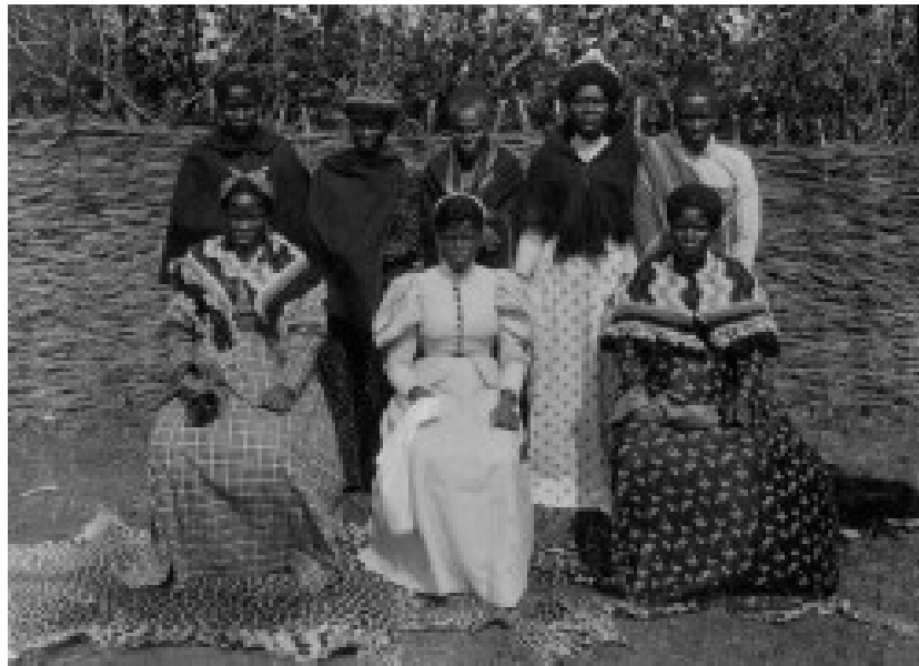
Fig. 4 Dinuzulu's wives in Western dress at St. Helena in the early twentieth century. 439