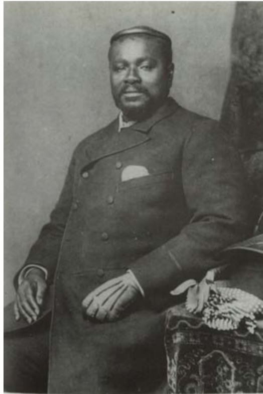
Fig. 3 Cetshwayo in London August 1882 438