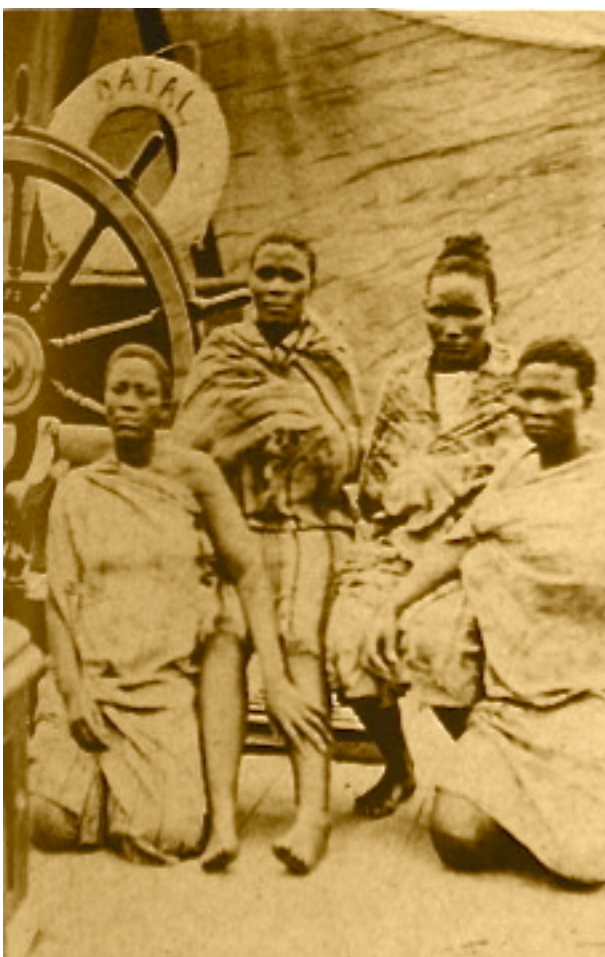
Fig. 2 Cetshwayo was accompanied by these four women on his exile from kwaZulu in 1879. 437