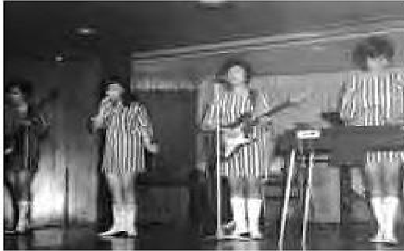
Fig. 2. Sgt. Howard James Holub, "Girl Band," Nothing More Beautiful, Nothing More Fine , http://www.subicbaypi.com/town_photo_girls60.htm .

These strategies may be viewed in various ways. One may see Filipinas controlled by US power, put on display for the pleasure of servicemen. A different interpretation is that Pilipina agency led these women to embrace their jobs and sexuality to deceive servicemen for their money. In other words, the US servicemen with obvious power were actually the victims of subtle manipulation by the seemingly powerless Pilipinas. Among the photographs on subicbaypi.com are numerous images of Pilipinas proudly posing while as they work. Discussions of embraced sexuality tend to be silenced and covered by the stories of exploitation of Pilipinas. The latter is a critical factor in the history of many women who worked in R&R industries after the Military Bases Agreement because it exposes the injustices that many Filipinas faced while working within these districts. However, the stories of triumph and success of the women who worked the system for their own benefit should also be acknowledged because they provide a more complete history of the experiences of these women.