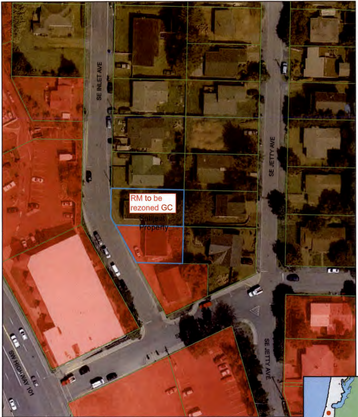
VICINITY MAP Leighton SE 9th and Inlet 07-11-15-DA, TL 3600