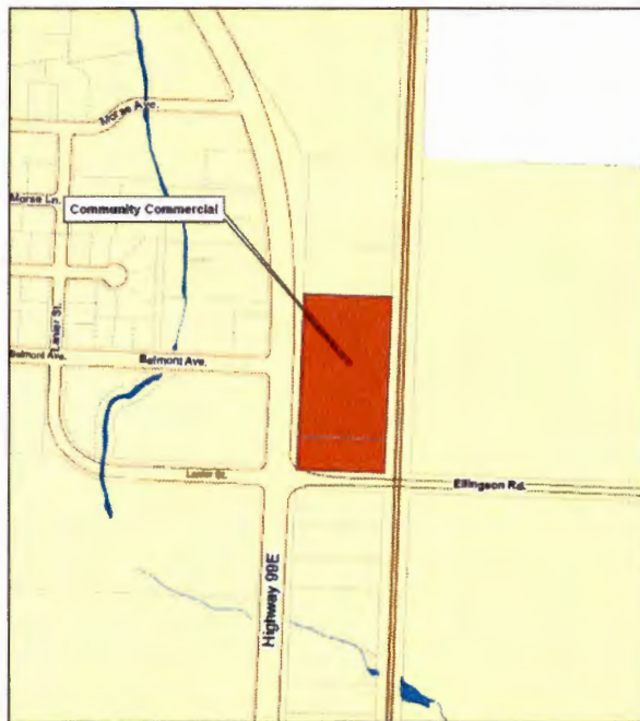
Proposed Zoning Designation