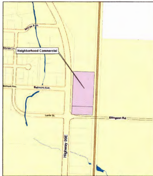
Current Zoning Designation

A Zoning Map Amendment that would change the designation of 3.5 acres of land from NC (Neighborhood Commercial) District to CC (Community Commercial) District as shown on the following maps: