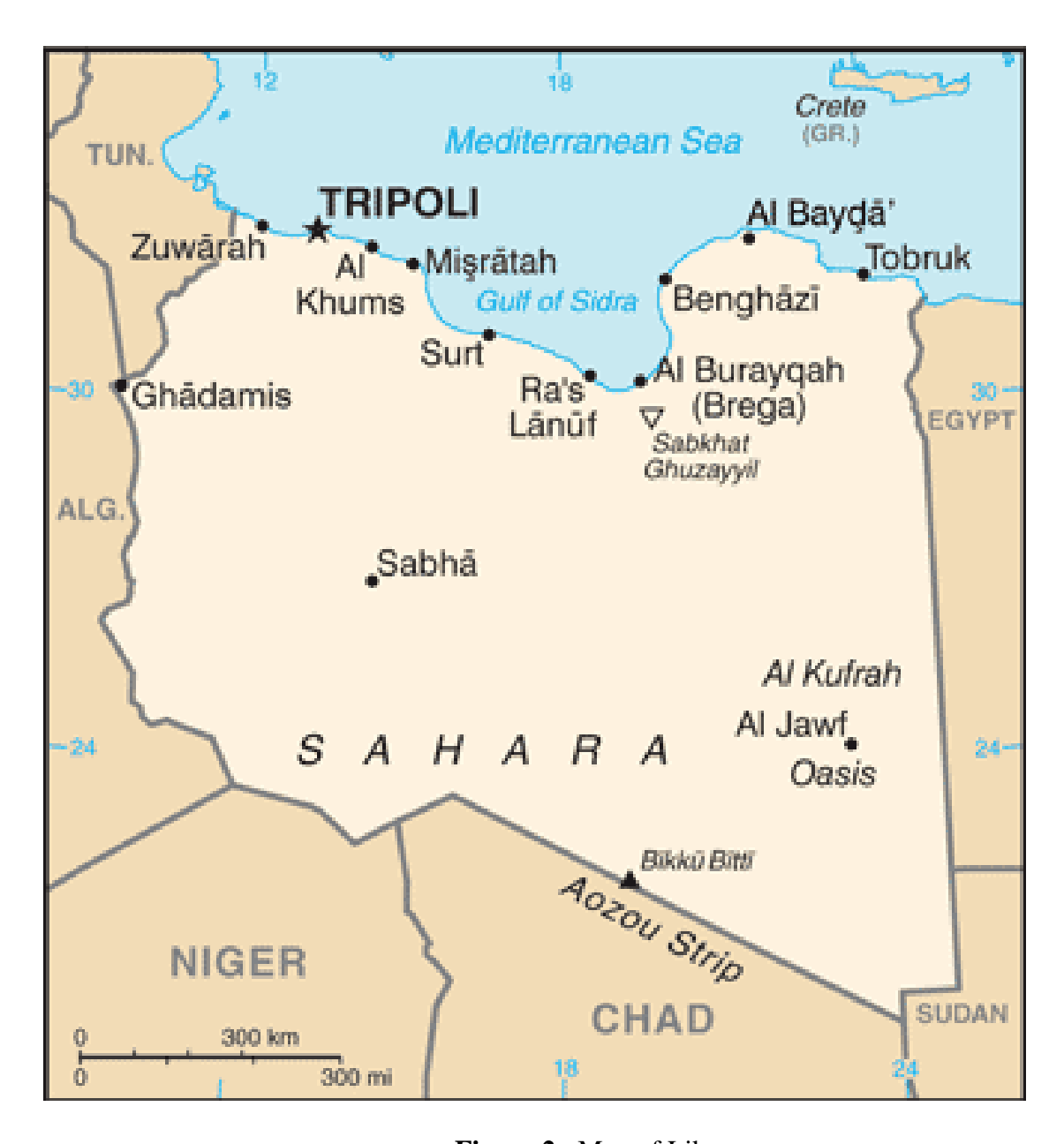
Figure 2 : Map of Libya

Rwandan Genocide to compel people to commit violence upon their neighbors. This similarity in language, when seen from the lens of the failure to prevent the Rwandan Genocide played a significant role in building international support for the Libyan intervention under R2P in 2011.