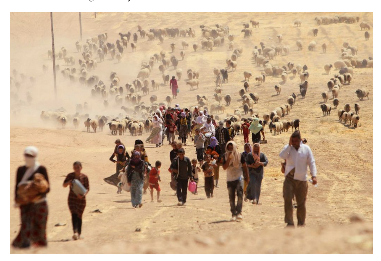
Figure 4: Yazidi Fleeing

women and children are still alive.<sup>115</sup> However, for those who survived, allegations of rape and sexual abuse are rampant. Reports include instances of rape and sexual abuse of Yazidi women and girls, forced marriages, sexual slavery, and torture.<sup>116</sup> Among the few who have escaped there are often feelings of that "their 'honor' has been tarnished and fear that their standing in society will be diminished as a result."<sup>117</sup>