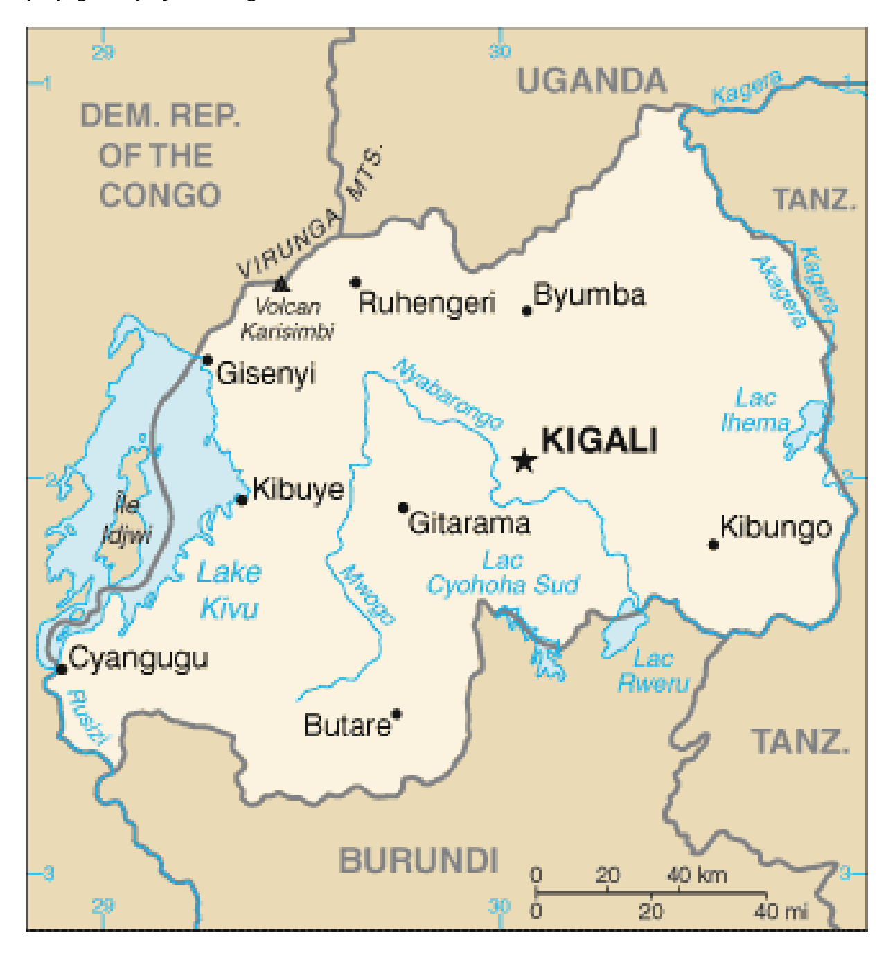
Figure 1: Map of Rwanda

moderate Hutu politician. An extremist Hutu political group from the Rwandan military would step in and fill the power vacuum. The mass killings quickly spread from the capital of Kigali through the rest of the country, enhanced greatly with the extremist Hutu propaganda played through the radio stations.