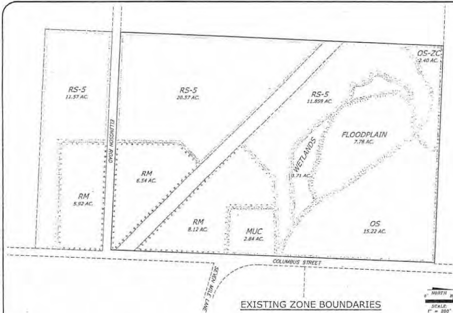
EXISTING ZONE BOUNDARIES

17933 NW EVERGREEN PARKWAY SUITE 300 BEAVERTON, OREGON 97006