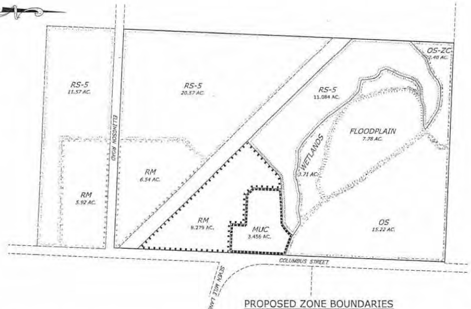
PROPOSED ZONE BOUNDARIES