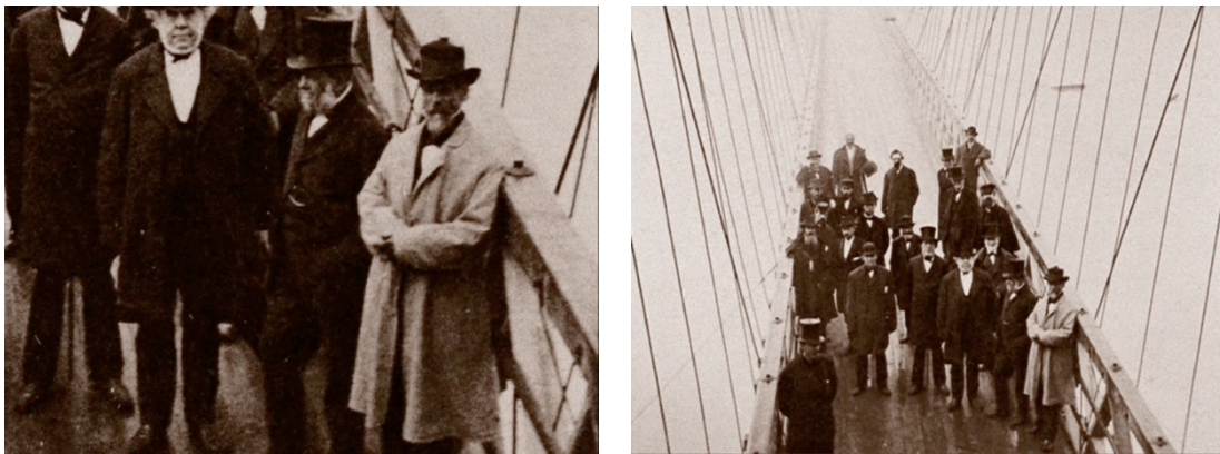
Figures 17 and 18: Key figures in the formation of the Brooklyn Bridge are shown in close-up first, followed by the “reveal,” which foregrounds the expanse of the bridge.

In addition, "time" is a significant property of photography and film and therefore, the historical documentary. Time is always a component or element of a still photograph's historicity that simultaneously informs and contextualizes; the black-and-whites or sepia tones that make up a photograph, for instance, locate the image in a particular moment in time; on the other hand, the dress and pose of individuals present in the frame or the appearance of physical and geographical spaces locate the photographed