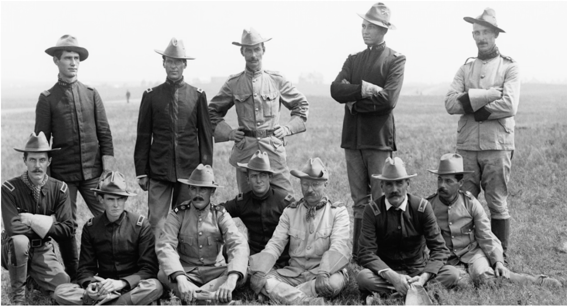
Figure 51: A formal portrait of Theodore Roosevelt and the Rough Riders, circa 1898. Burns relies upon posed pictures such as this throughout the first few episodes of The Roosevelts , an era prior to the widespread circulation and exhibition of motion picture photography.

analysis of this part of the miniseries also suggests that the shift from still images to newsreel footage is due to the relationship between the film's content and the history of photography, as well as the editorial and aesthetic decisions on behalf of Burns and his team.