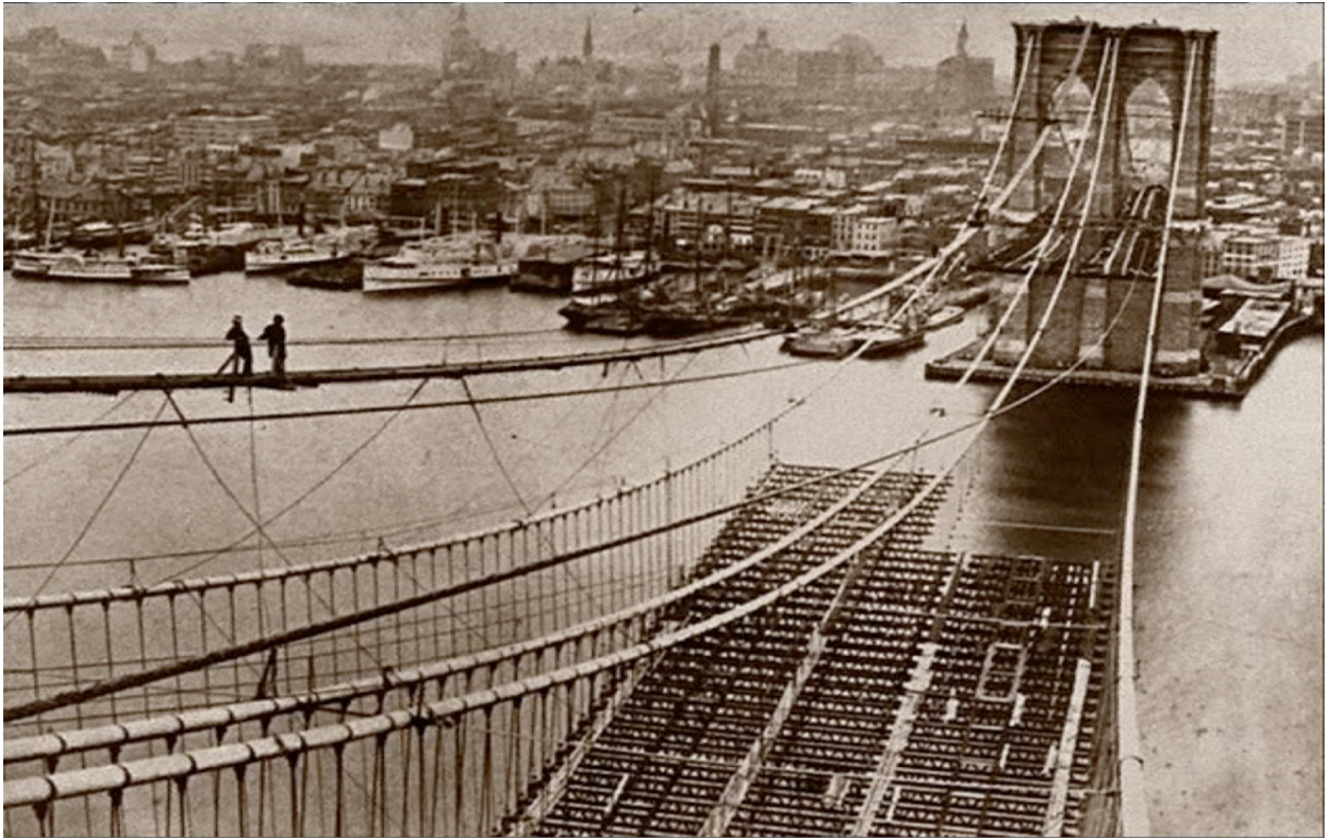
Figures 14, 15, and 16: (From top) A single photograph from Brooklyn Bridge separated into frames. Slowly, the camera zooms out and simultaneously pans right to “reveal” the scope of the bridge and the skyline of New York City.