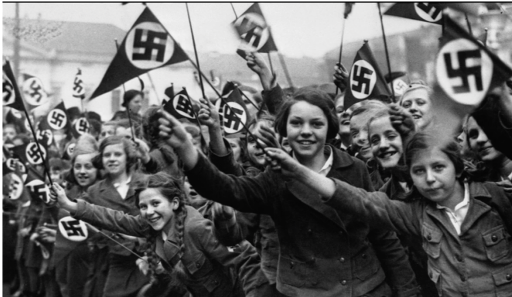
Figures 30 and 31: (From top) A second example of the “reveal” when the pan-and-zoom effect applied to a still photograph in The Roosevelts . Here, a close-up image of mostly smiling adolescent girls becomes a symbol of Nazi propaganda as the camera zooms away from the faces of the girls and pans slightly toward the left of the screen, thereby revealing a larger number of young females with flags bearing Nazi insignia.