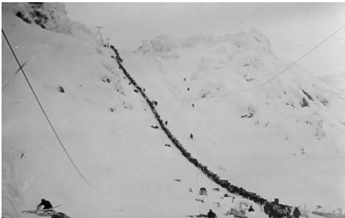
Figures 7, 8 and 9 (from top):

An example of the pan-and-zoom technique in City of Gold . The camera spends several seconds on a portion of the frame (previous page) before panning to the upper-left of the photo and zooming into the image, revealing a larger spectrum of prospectors moving up a snowy mountain.