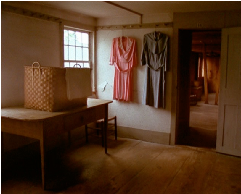
Figures 19 and 20: (From top) Motion picture images from The Shakers . Here, the stillness of the motion picture photography mirrors that of still photography.