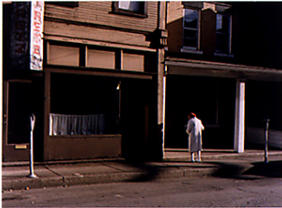
Figures 1, 2, and 3: