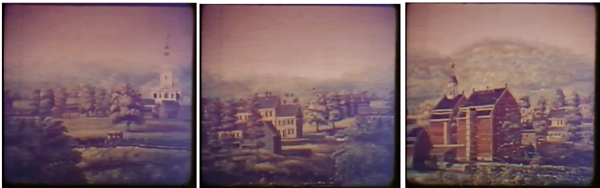
Figures 4, 5, and 6: Sections of a painting from Working in Rural New England (1976b). The scene highlights Burns's first uses of rephotographing and panning across still imagery. In the film, the camera pans left and across this painting to reveal the expanse and details of the village.

His [Burns's] camera slowly pans across a large sprawling mural of a New England village from the 1830s, visually spotlighting a number of important details, including an assortment of people milling about period houses, craft shops, farm buildings, and rolling fields and rivers (p. 33).