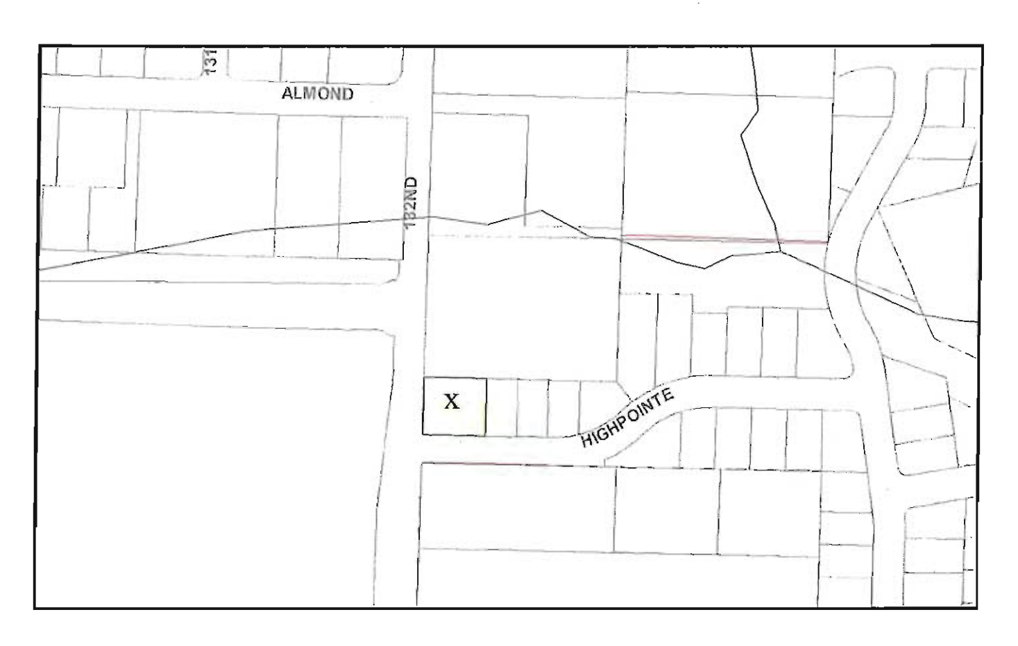
PROPOSED ZONE R-7