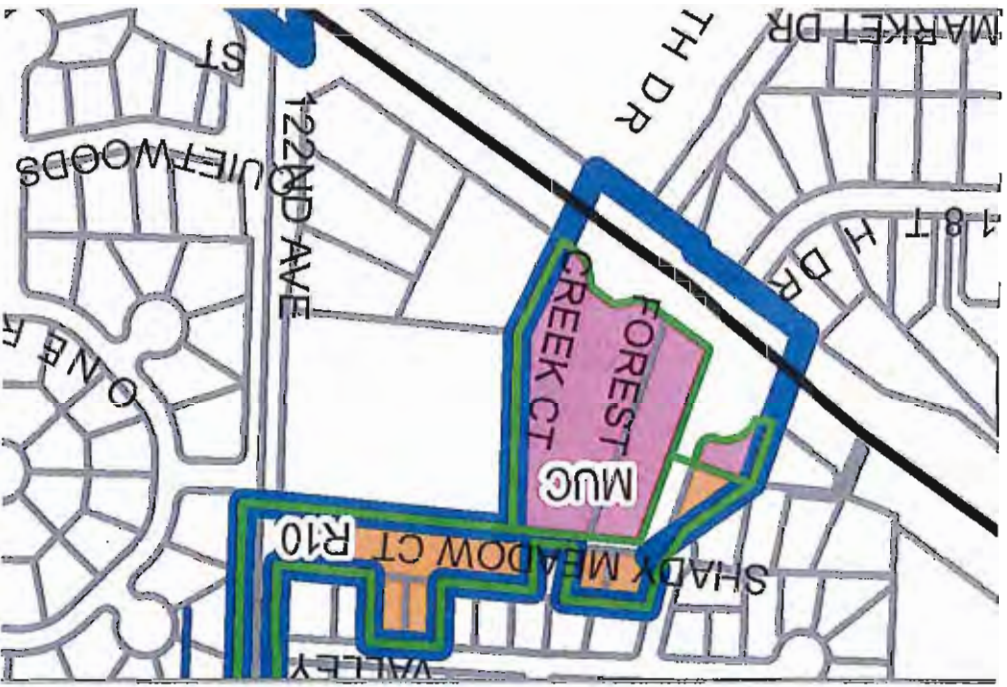
Figure 3: Existing Zoning