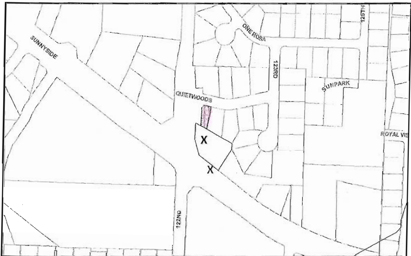
PROPOSED ZONE IPU