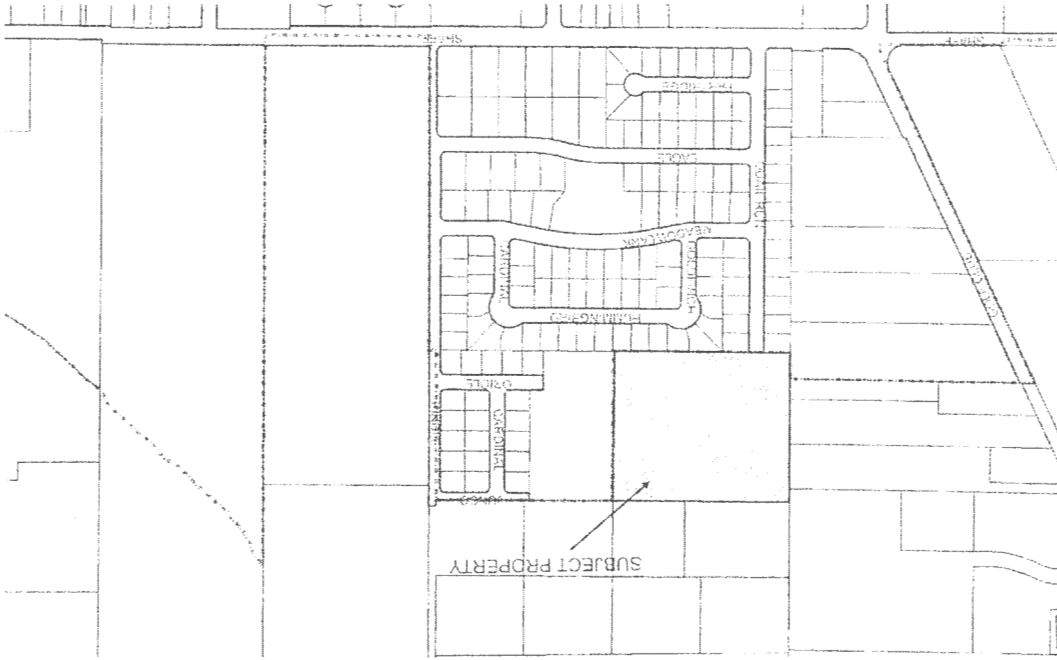
EXHIBIT 2, Map of Annexed Territory