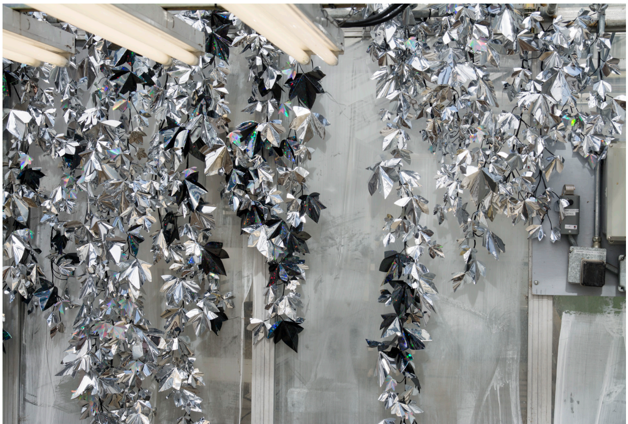
14. Onyx Bridge Greenhouse Project with Jessie Rose Vala, 2014. Vinyl, steel wire, brass, ceramic. Dimensions Variable.