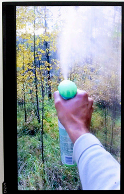
17. Spray , 2015. Digital video. Dimensions variable.