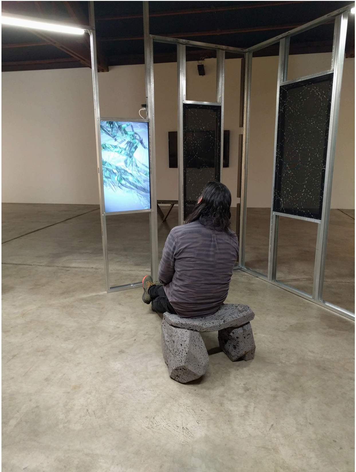
6. Edge Condition , 2016. Steel, mesh textile, stone, grass, LCD screens. 12' x 12' x 12'.