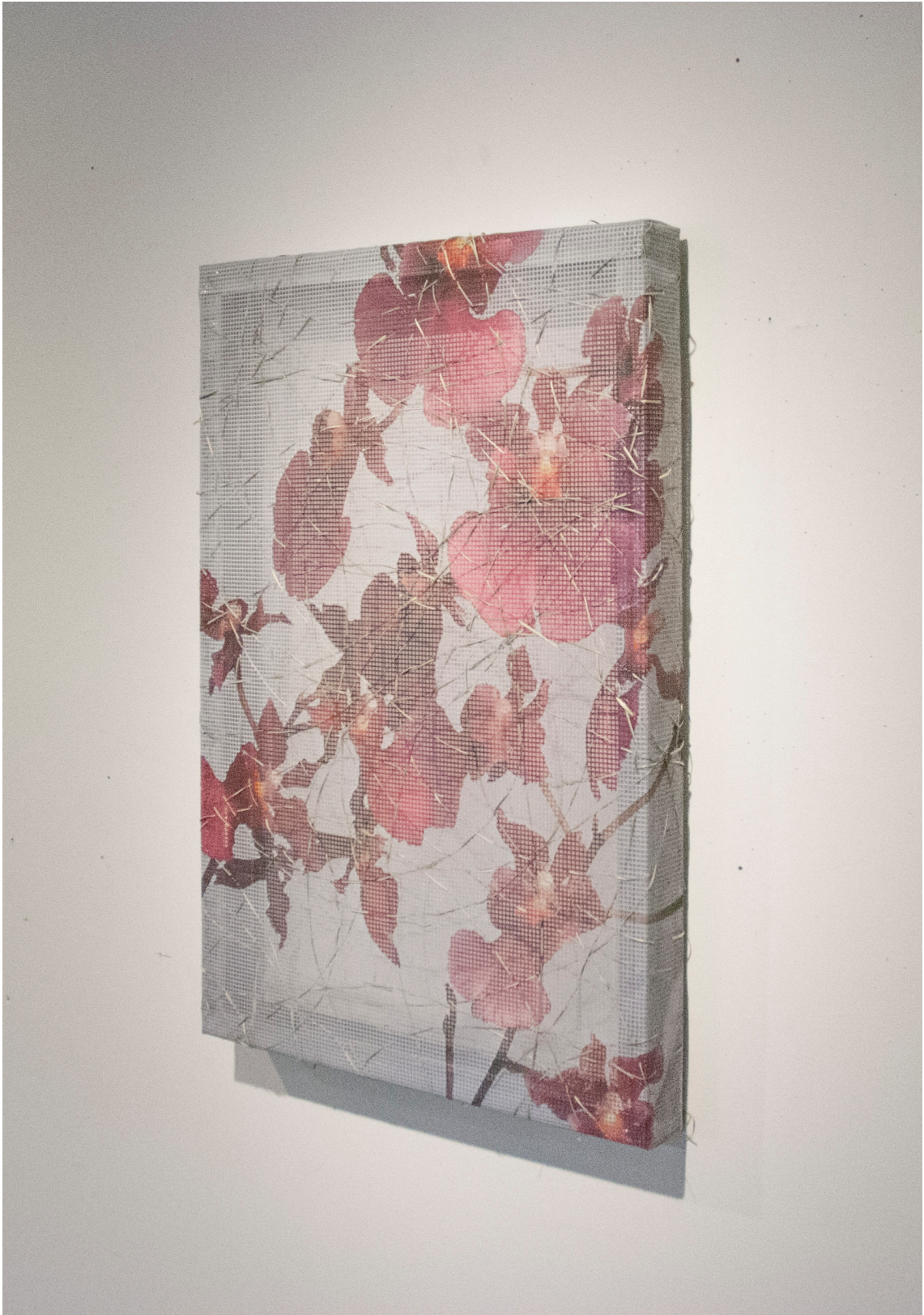
20. Lattice(Orchid) , 2016. UV printed mesh textile, grass. 22" x 33" x 3".