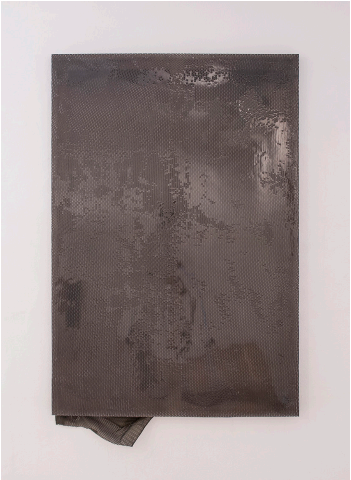
19. Lattice (Olive drab) , 2014. Epoxy on mesh textile. 30" x 48" x 2".