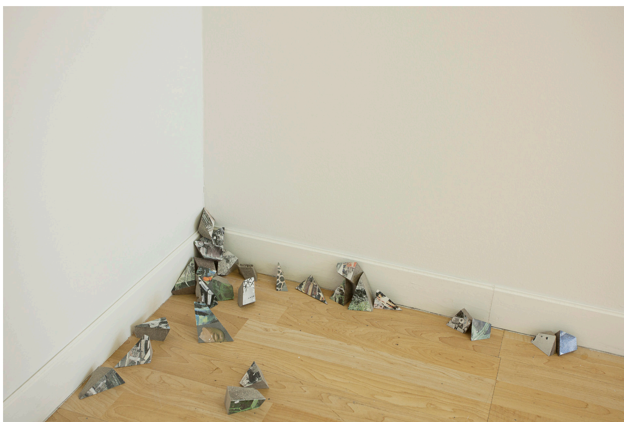
7. Slide , 2015. Immersion prints on composite wood. Dimensions variable.