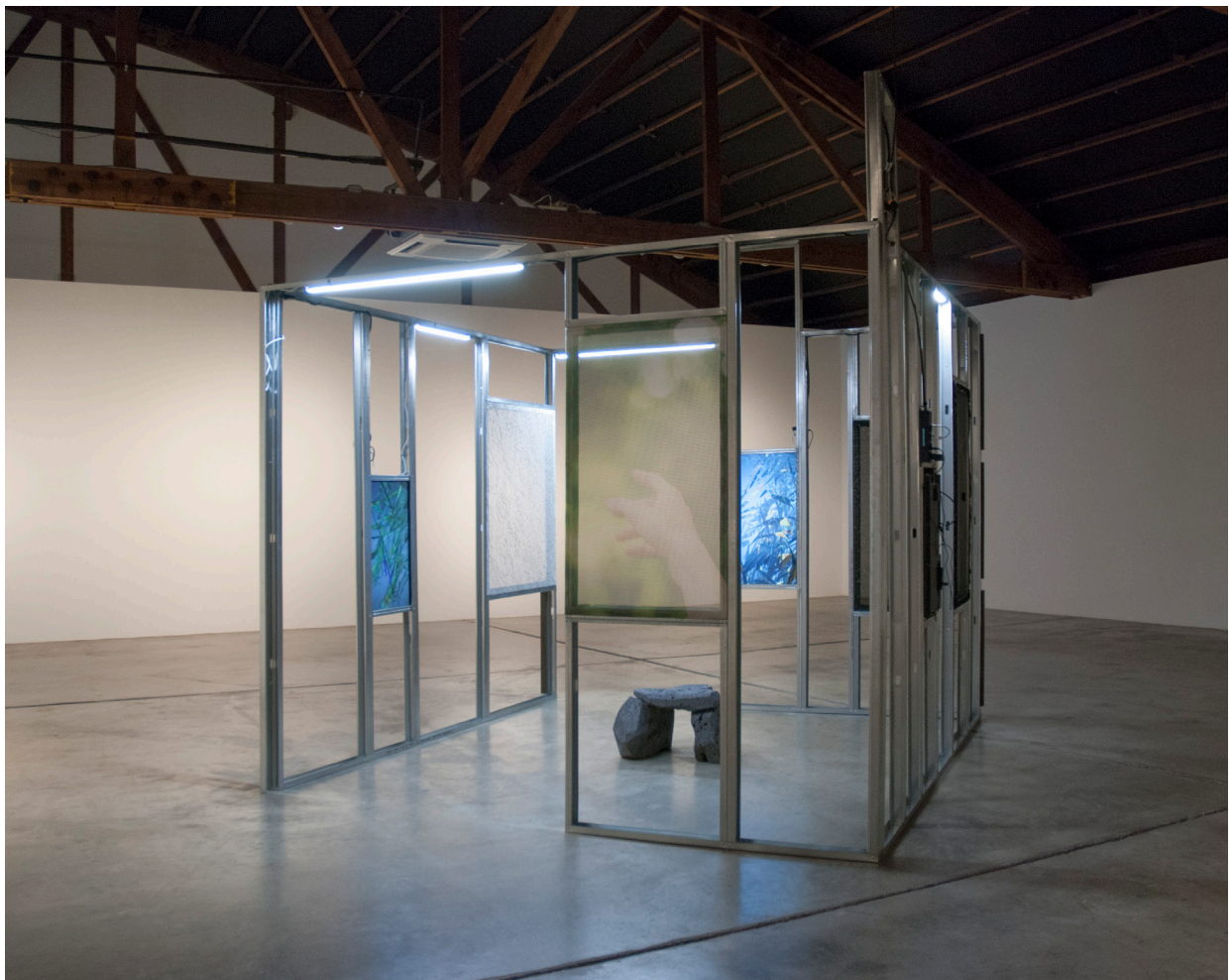
1. Edge Condition , 2016. Steel, mesh textile, stone, grass, LCD screens. 12' x 12' x 12'.