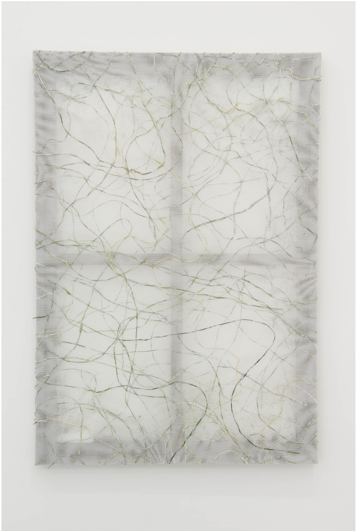
12. Lattice (beargrass) , 2015. Mesh textile, grass, composite wood. 24" x 36" x 2".