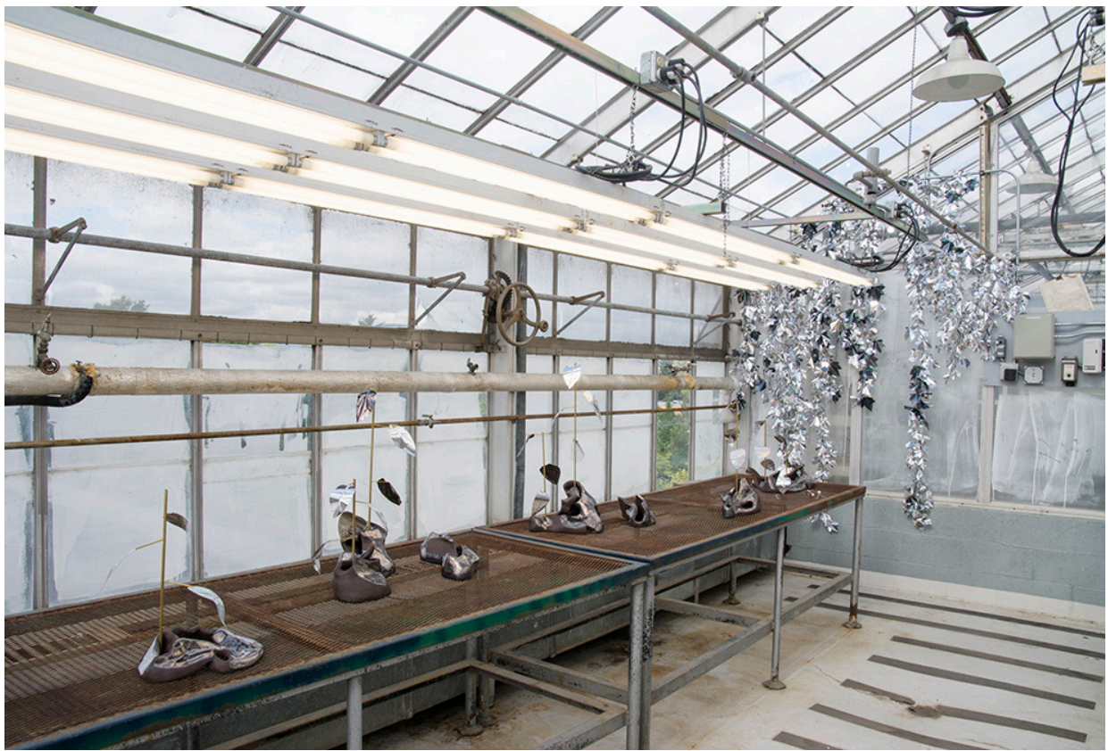
13. Onyx Bridge Greenhouse Project with Jessie Rose Vala, 2014. Vinyl, steel wire, brass, ceramic. Dimensions Variable.