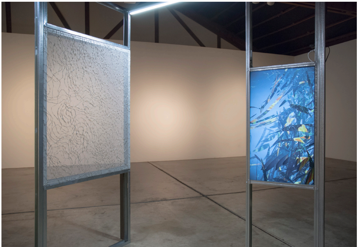
5. Edge Condition , 2016. Steel, mesh textile, stone, grass, LCD screens. 12' x 12' x 12'.