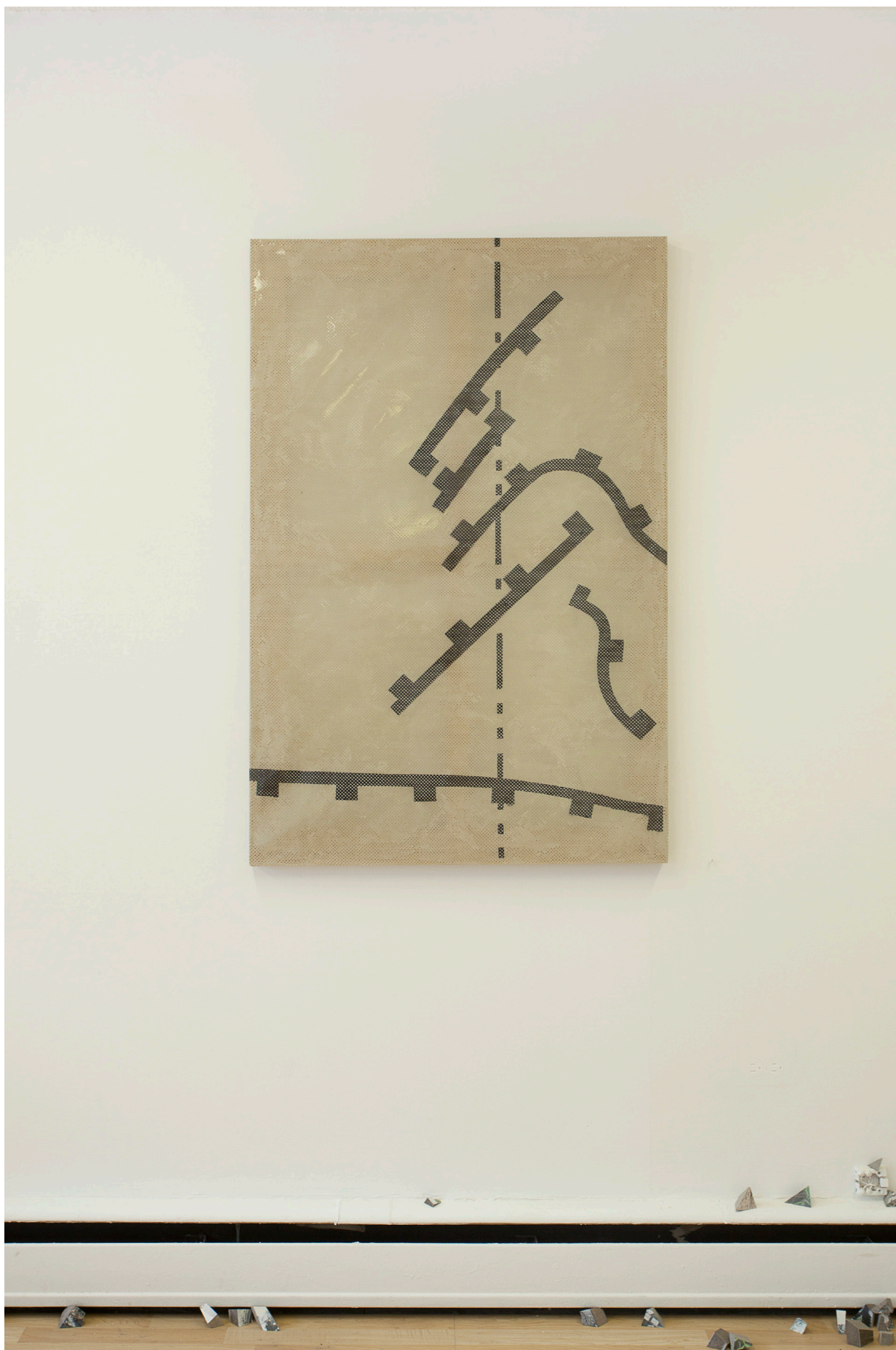
10. Fault (Whitemud) , 2015. Acrylic and epoxy on mesh textile. 40" x 54" x 2".