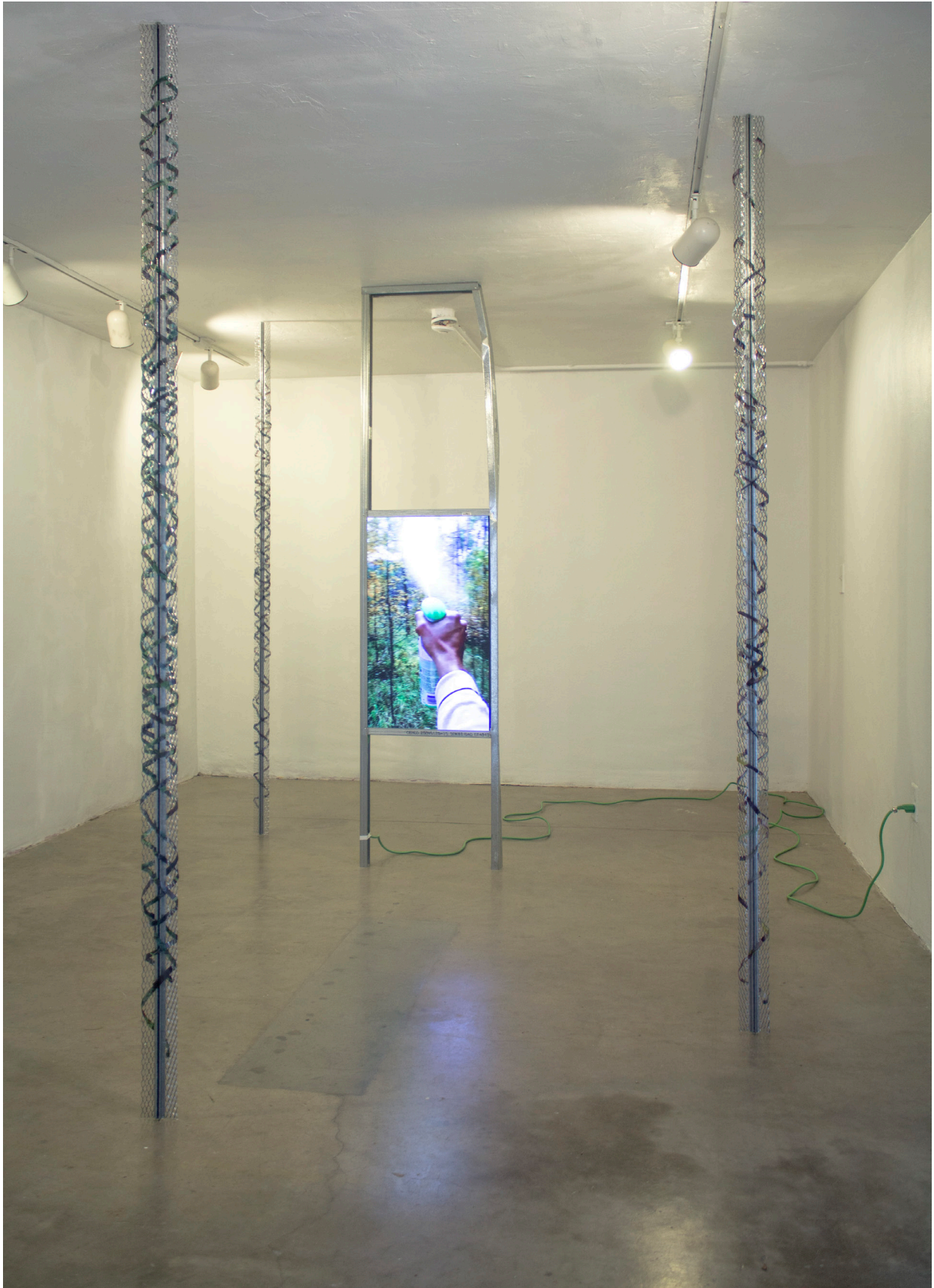
16. New Vert , 2015. Steel, inkjet print on transparency, epoxy, LCD screen. Dimensions variable.