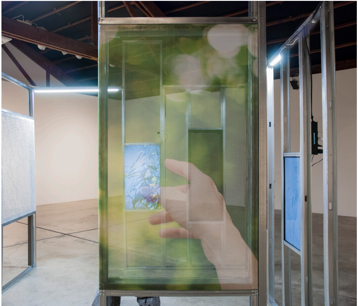
2. Edge Condition , 2016. Steel, mesh textile, stone, grass, LCD screens. 12' x 12' x 12'.