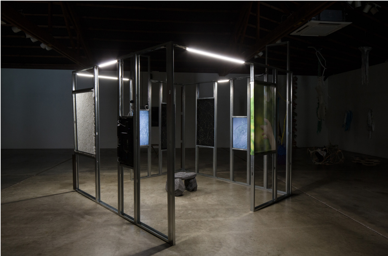
3. Edge Condition , 2016. Steel, mesh textile, stone, grass, LCD screens. 12' x 12' x 12'.