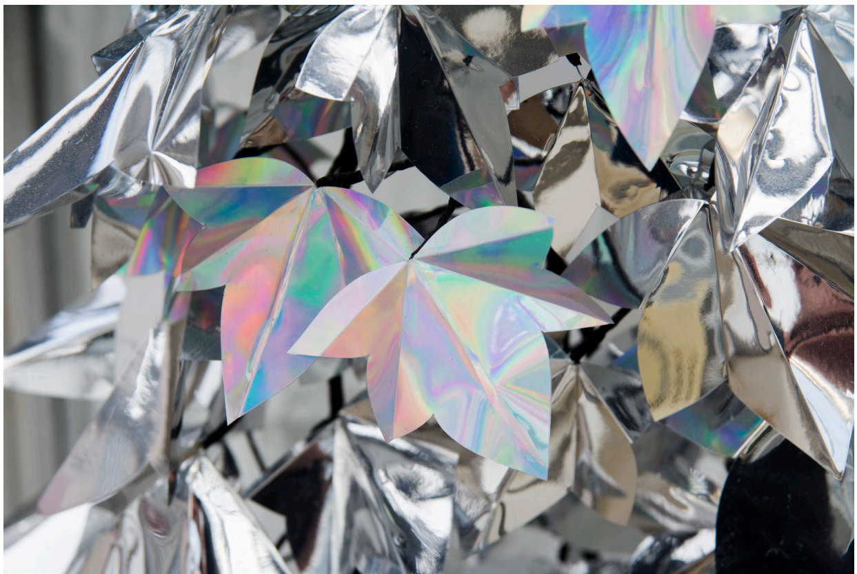
15. Onyx Bridge Greenhouse Project with Jessie Rose Vala , 2014. Vinyl, steel wire, brass, ceramic. Dimensions Variable.