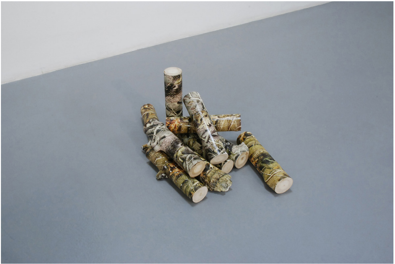
18. Logs (Grey Oak Brown Oak) , 2014. Wood, immersion print. Dimensions variable.