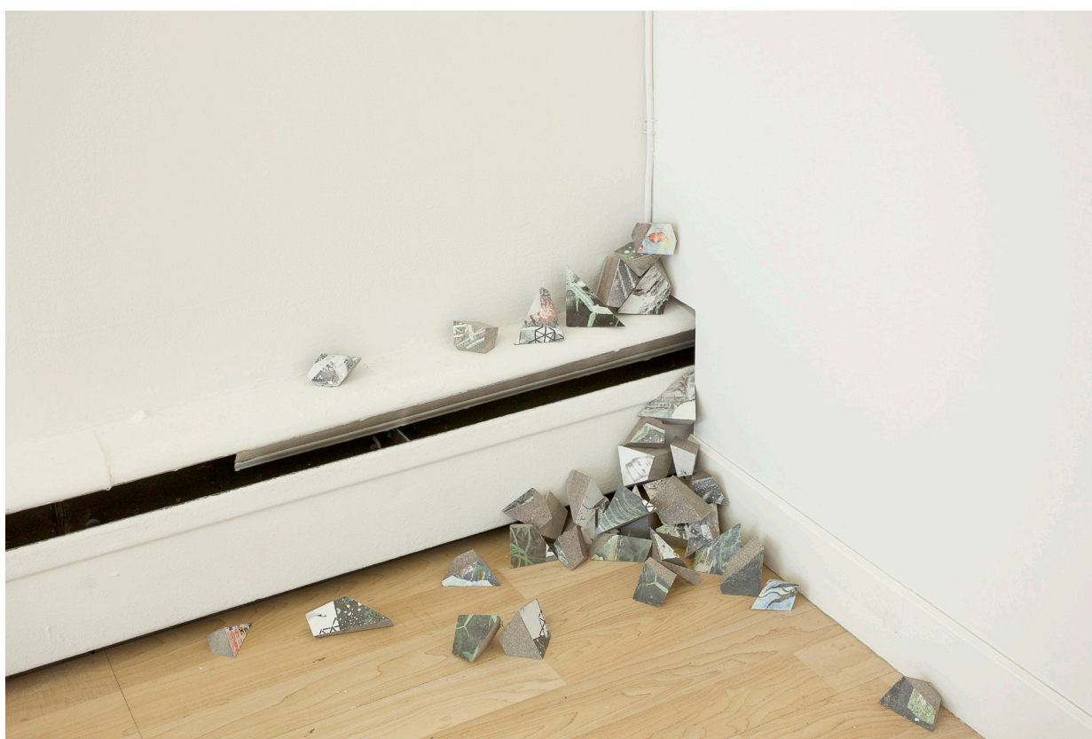
8. Slide , 2015. Immersion prints on composite wood. Dimensions variable.