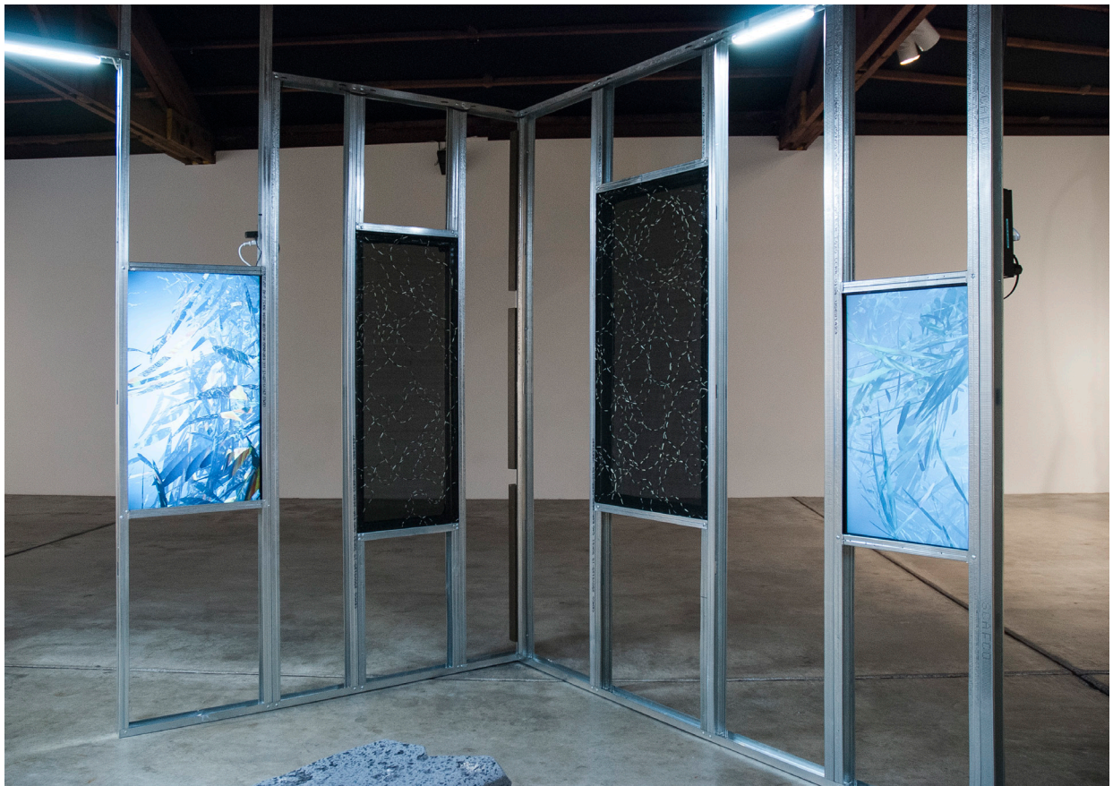
4. Edge Condition , 2016. Steel, mesh textile, stone, grass, LCD screens. 12' x 12' x 12'.