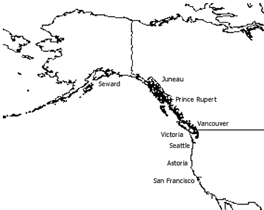
Figure 13.2 Inland Passage cruise ports, Alaska and Pacific Northwest region