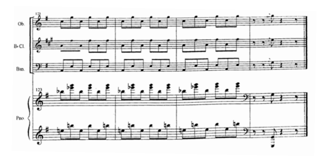
Ex. 5.1 Sonate Champêtre, Allegro Vivace-Gaiement, mm. 123-126

The clarinet part is not particularly difficult for an intermediate player, but it is the most difficult of the six chamber pieces that I have explored in this paper. The most challenging aspect is the frequent motion over the break, which requires good breath support, voicing, and coordinated fingers. Measures 106–109 in the Allegro Moderato are the most difficult measures in the clarinet part because they require fingering planning for the D-sharps in mm. 106–107, and good technique to cleanly execute the descending sixteenth note A major thirds beginning on altissimo C-sharp in mm. 108–109. [Ex. 5.2]