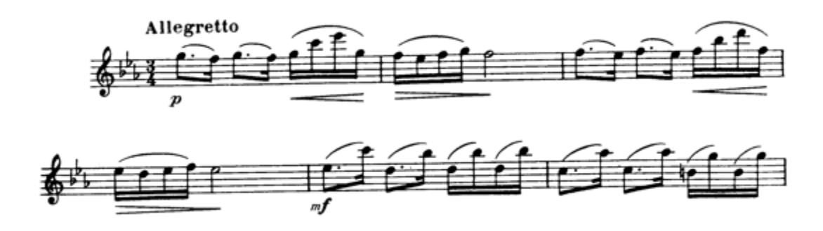
Ex. 4.6 Arabesque, mm. 1–6

This piece is musically challenging for both the clarinetist and pianist due to the short slurs—the tendency is to stop the momentum after each slur rather than creating a larger phrase from the smaller sections.