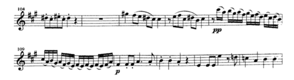
Ex. 5.2 Sonate Champêtre, Allegro Moderato, mm. 104-113

In the second movement, the most challenging aspect is the altissimo register in mm. 40–42, reaching up to G6 in mm. 40 and 42. [Ex. 5.3]