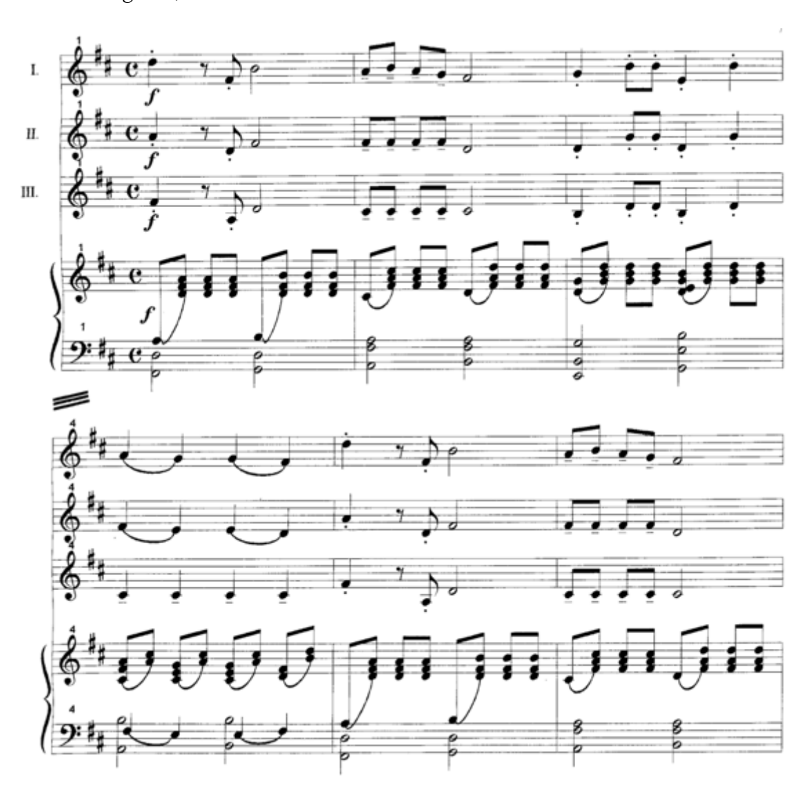
Ex. 5.6 Allegretto, mm. 1-6

their peers. This is notable because the three parts are in rhythmic unison in each A section. The clarinet parts primarily create major or minor triads which provide an opportunity for students to work on tuning with each other, and with the piano. [Ex. 5.6]