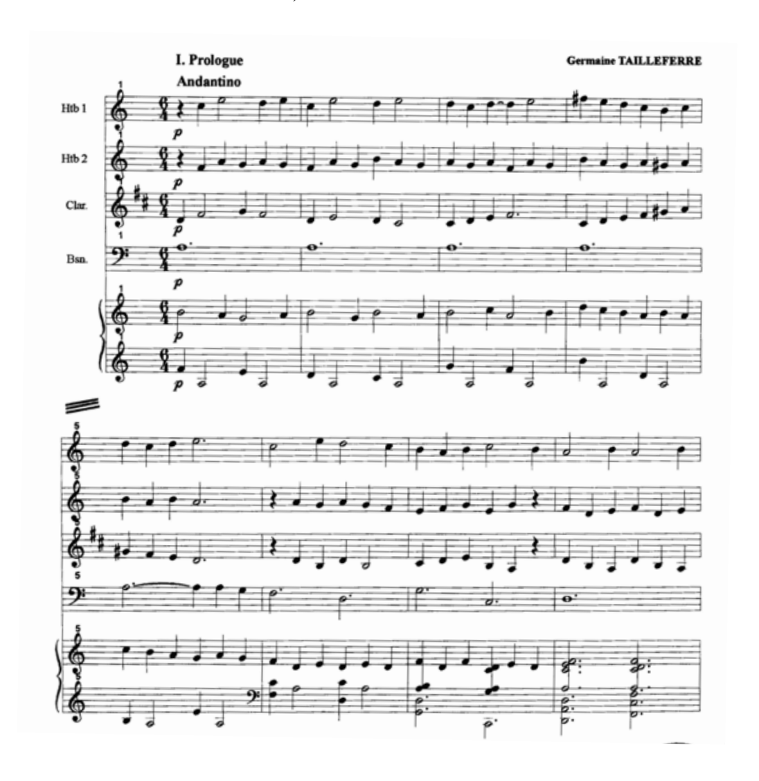
Ex. 5.7 Sérénade en La Mineur, mm. 1–8

eighth notes. The bassoon part is the most rhythmically independent with notes that are often longer in duration than the other parts. For example, in the Prologue and Epilogue, the bassoon primarily plays dotted whole and dotted half notes while the other parts play quarter and half notes. [Ex. 5.7]