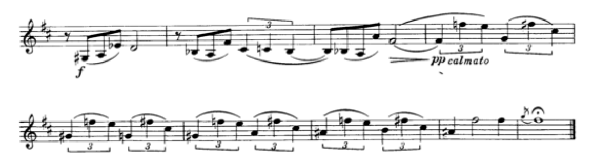
Ex. 4.2 Sonata, Allegro tranquillo, mm. 50–58

Reproduced by permission of Broude Brothers Limited.