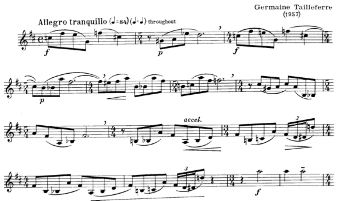
Ex. 4.1 Sonata, Allegro tranquillo, mm. 1–14

Reproduced by permission of Broude Brothers Limited.