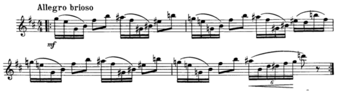
Ex. 4.4 Sonata, Allegro brioso, mm. 1–4

Reproduced by permission of Broude Brothers Limited.