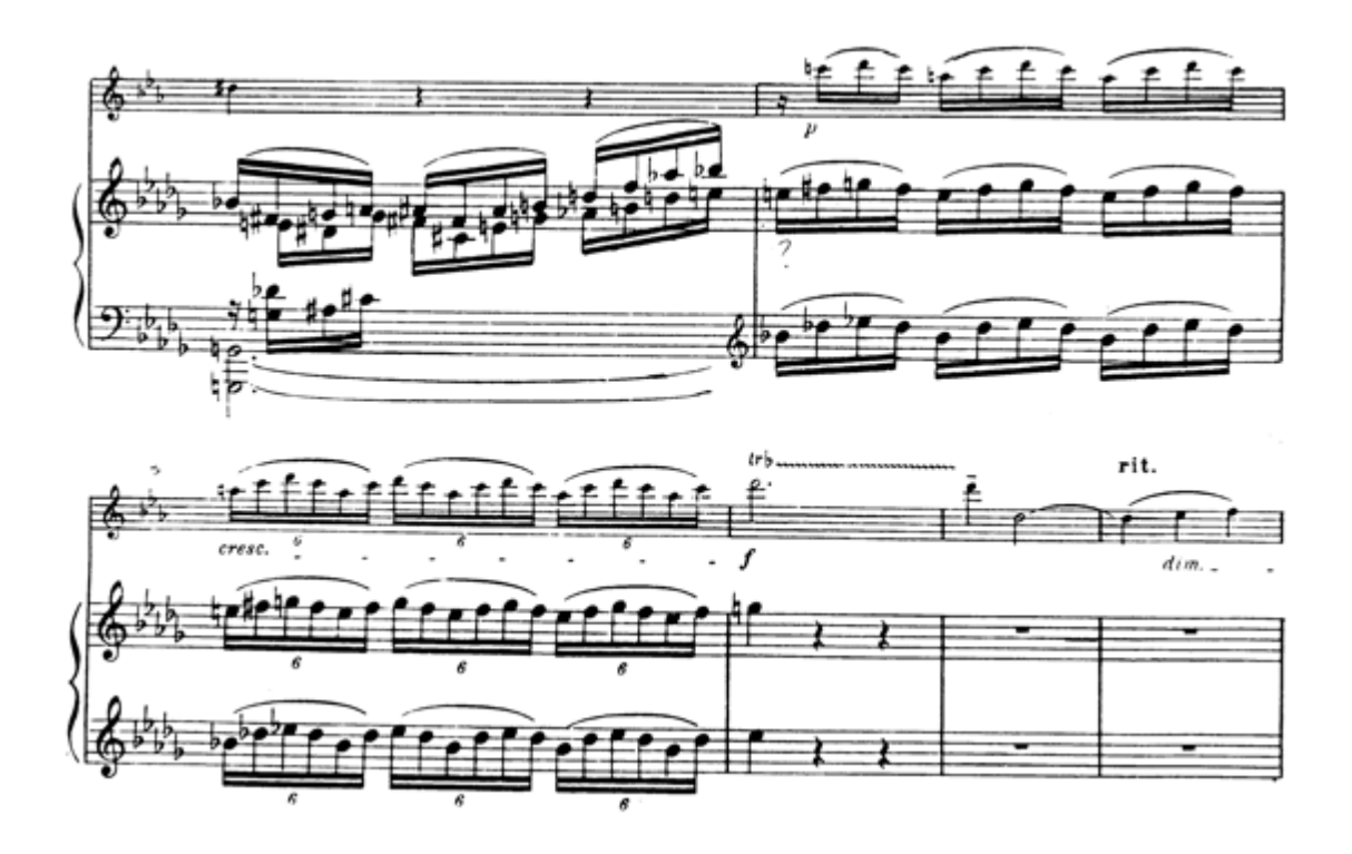
Ex. 4.7 Arabesque , mm. 32–37

Arabesque is relatively simple in terms of ensemble; the clarinet and piano right hand are mostly in thirds harmonically and in rhythmic unison, however subdivisions must be accurate in order to coordinate the dotted eighth sixteenth note rhythm. Meanwhile, the piano left hand mostly outlines the harmony in eighth notes or quarternote chords in the contrasting idea sections.