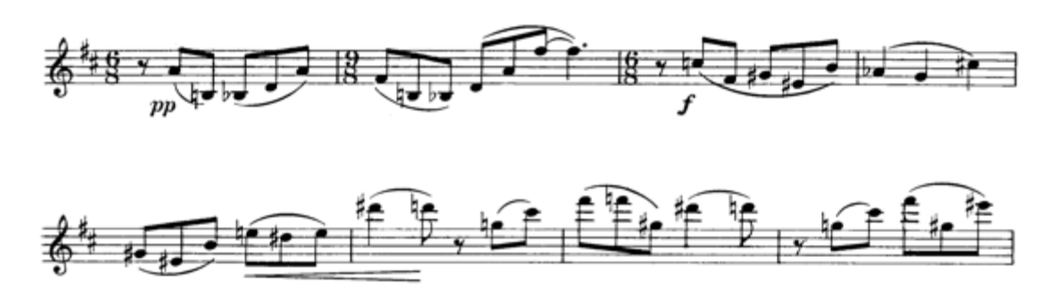
Ex. 4.3 Sonata, Andantino espressivo, mm. 10-17

Reproduced by permission of Broude Brothers Limited.