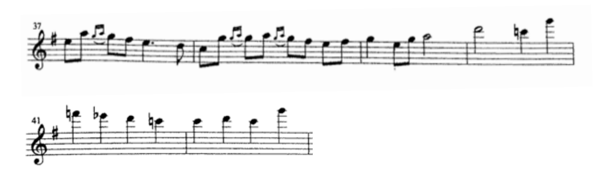
Ex. 5.3 Sonate Champêtre, Andantino, mm. 37-42

The third movement is an endurance test for the clarinetist. It features fairly continuous tongued eighth notes, including repeatedly tonguing eighth notes back and forth over the break in mm. 70–77, and mm. 122–125. [Ex. 5.4 and 5.5]