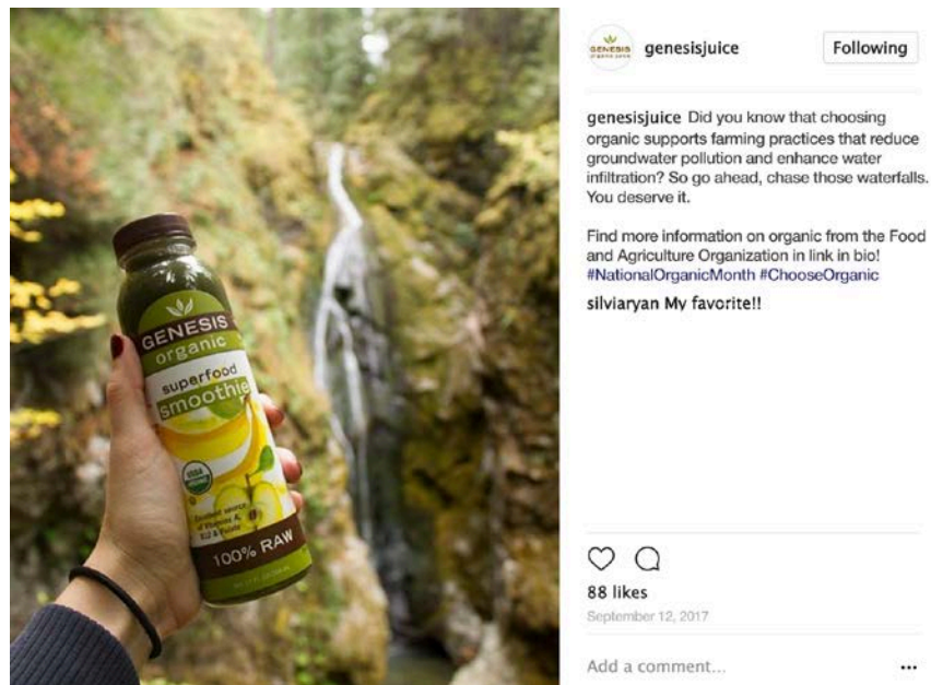
Figure 4: Instagram Example Post

This figure provides Genesis with example copy to use as a guide for messaging organic's environmental benefits on Instagram.