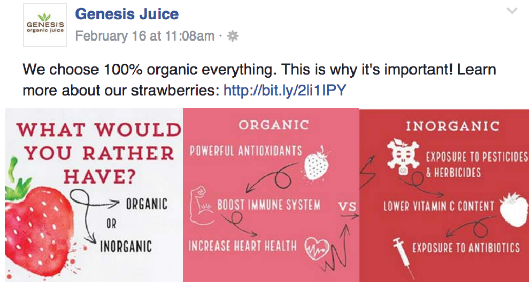
Figure 2: Genesis Organic Juice Facebook post on February 16, 2017

suggest conventional strawberries contain lower levels of vitamin C. 44 However, the graphic does not clarify this difference and instead portrays the benefits as either/or. The imagery of a skull and a needle is problematic, eliciting fear rather than educating consumers.