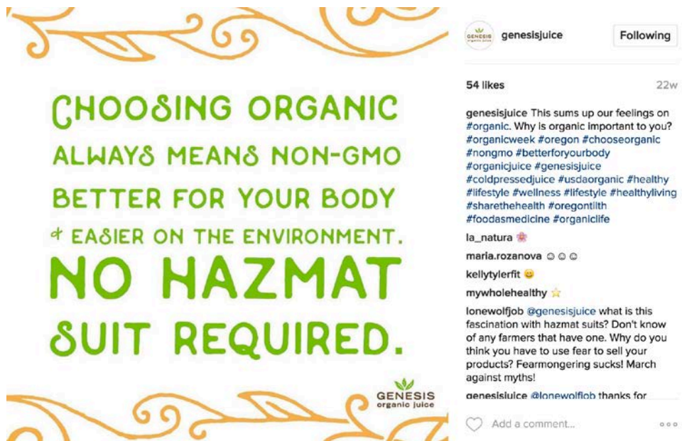
Figure 1: Genesis Organic Juice’s Instagram post on September 13, 2016

This figure displays Genesis Organic Juice’s messaging of organic on its Instagram account, which received a negative response from an Instagram user.