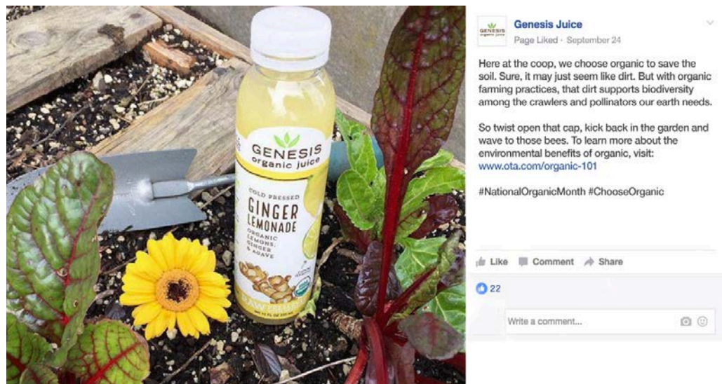
Figure 5: Facebook Example Post

This figure provides Genesis with example copy to use as a guide for messaging organic's environmental benefits on Instagram.