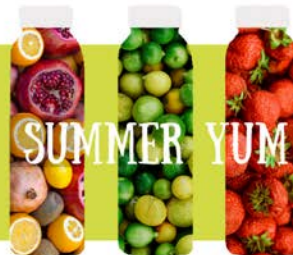
Figure 3: Example Blog/Newsletter Content

We've teamed up with our favorite natural and organic neighbors to create recipes to start the summer off right. Whether fueling up before a morning hike or lounging around in the afternoon sun, we've got your summer sippin' covered. Unearth the recipes >