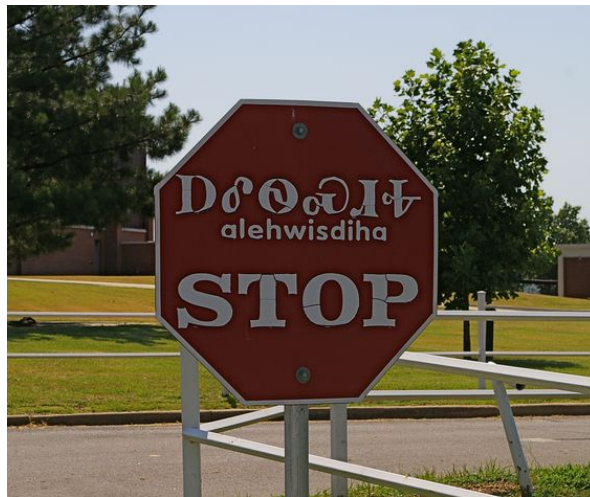
Figure 4. Bilingual Stop Sign in Tahlequah, OK with transliteration.

During the period 1906-1971, when the official Cherokee Nation was decommissioned and without leadership the syllabary was still used to educate Cherokee people- even with government programs to discourage Cherokee-language education. 40 It was not until 1991 that the syllabary was legally encoded into the linguistic landscape of the Cherokee Nation- that is, formally promoted in public writing- and Cherokee was recognized and protected by the tribal government as a cultural resource. 41 The language, in addition to being taught in immersion schools throughout the reservation, is prominent on signage and businesses, making the visibility of specifically Cherokee culture in eastern Oklahoma impossible to ignore. 42