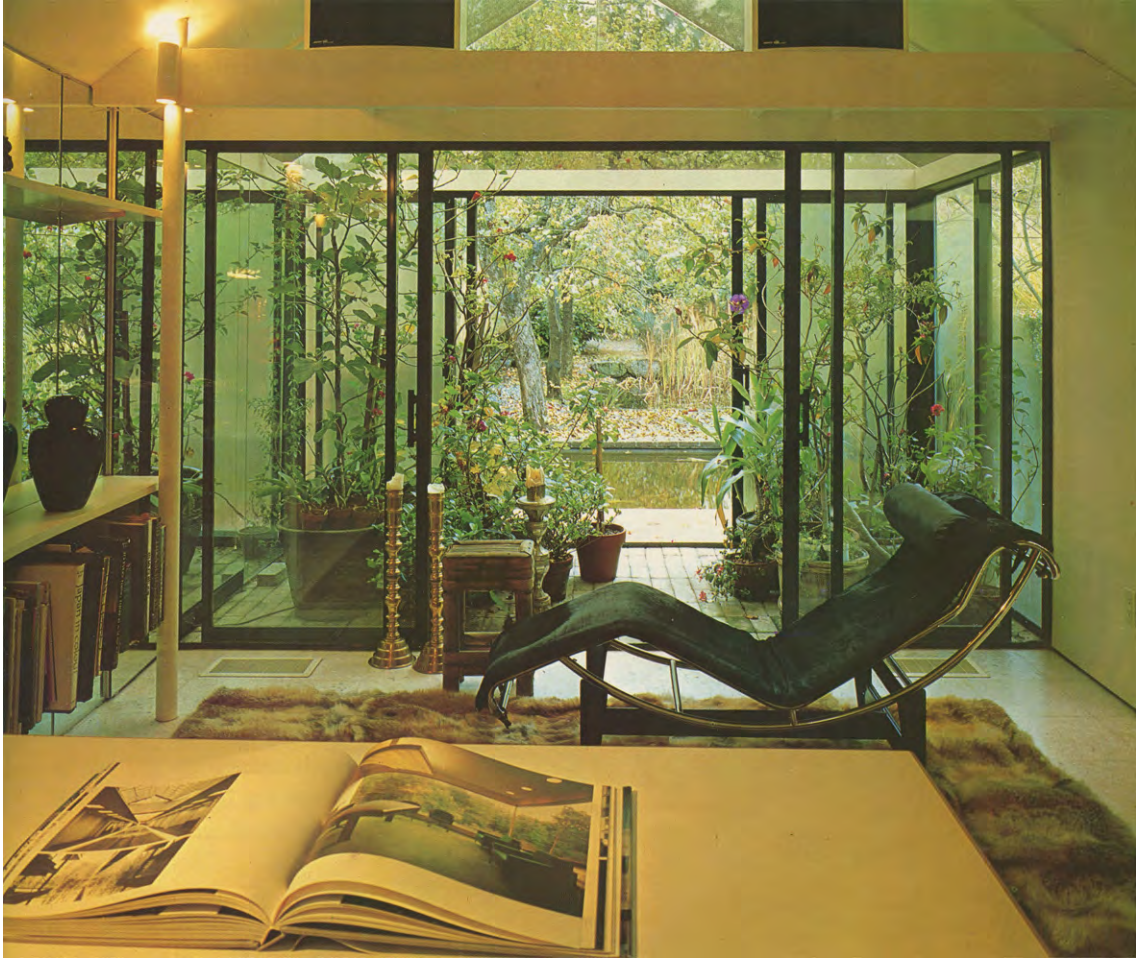
Figure 7. Erickson's study. no date.