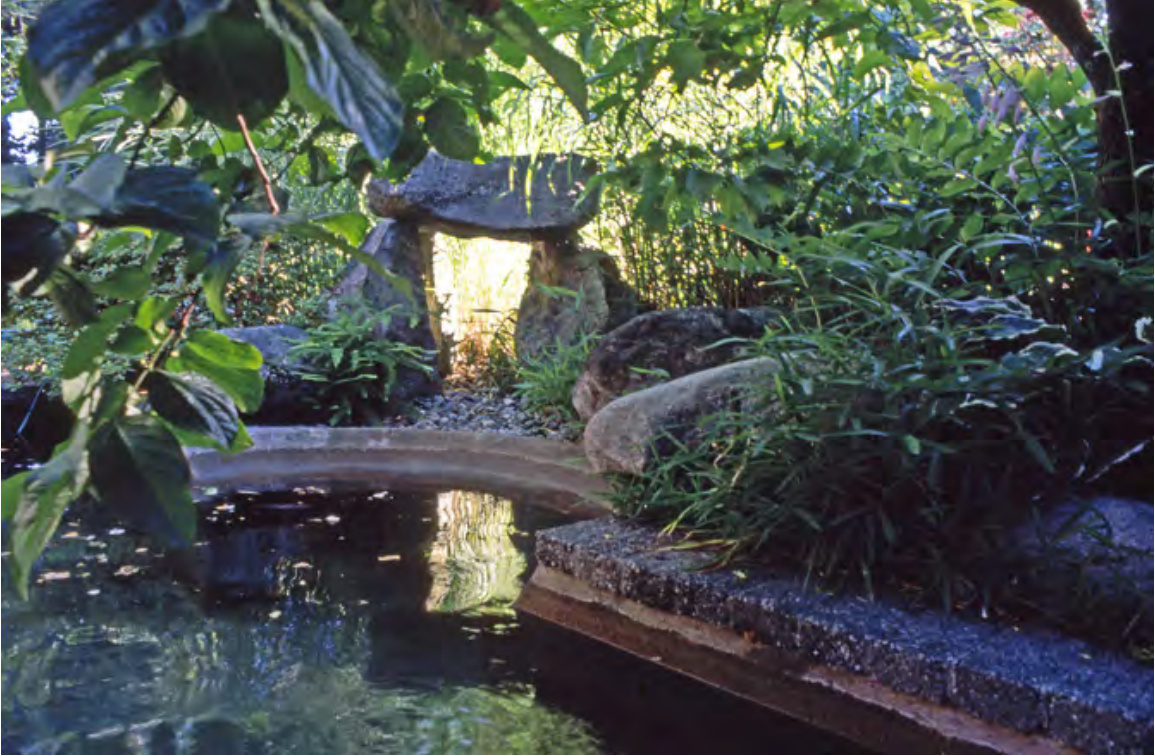
Figure 3. Erickson's garden. no date.