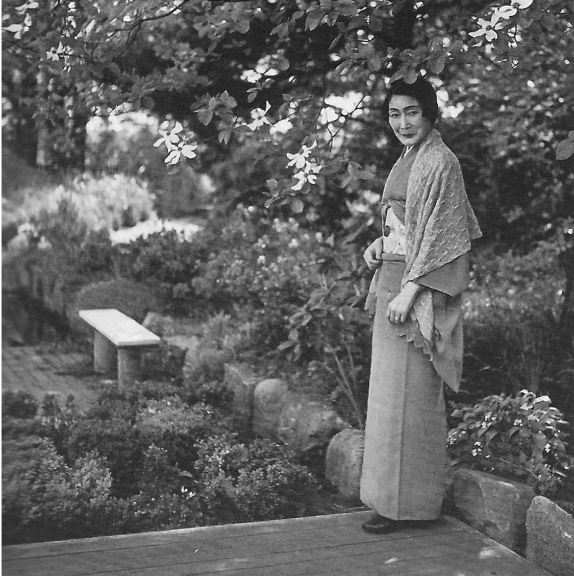
Figure 12. Erickson's Japanese language teacher in his garden. no date.