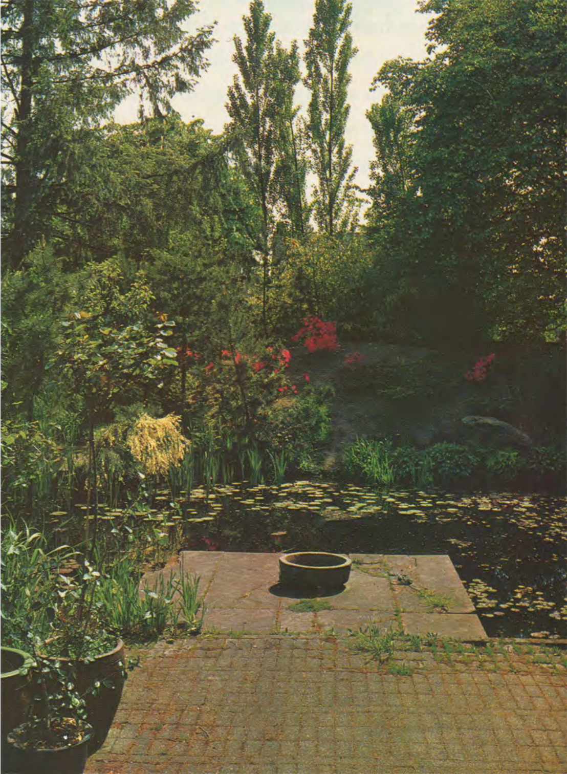
Figure 11. Erickson's garden. no date.