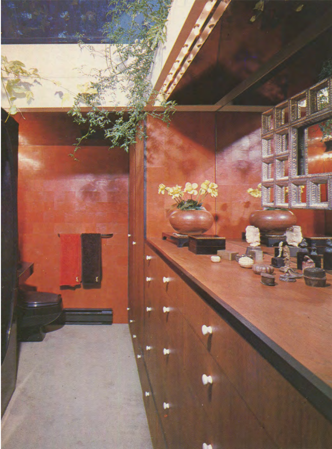
Figure 10. Erickson's washroom. no date.