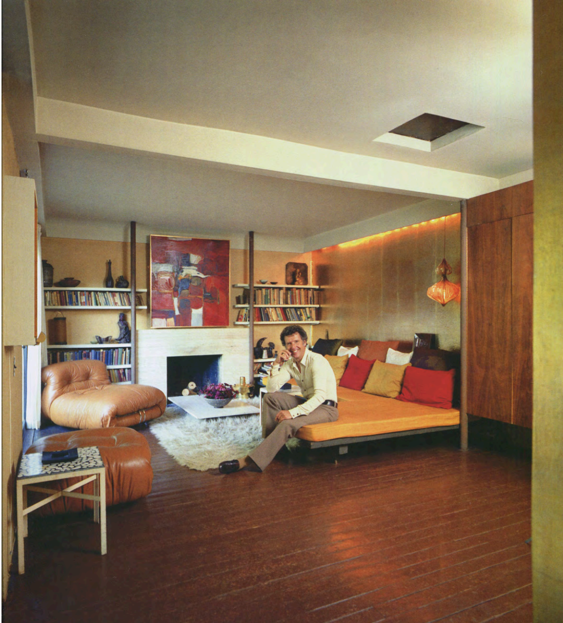
Figure 1. Arthur Erickson photographed in his living room. 1972.