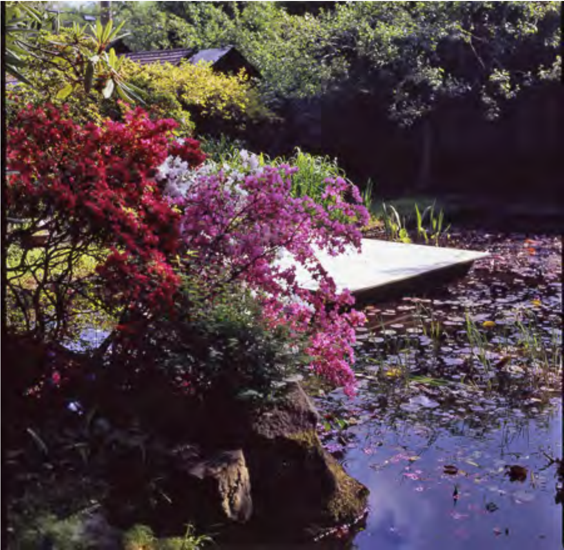
Figure 5. Erickson's garden with moon viewing platform visible. no date.