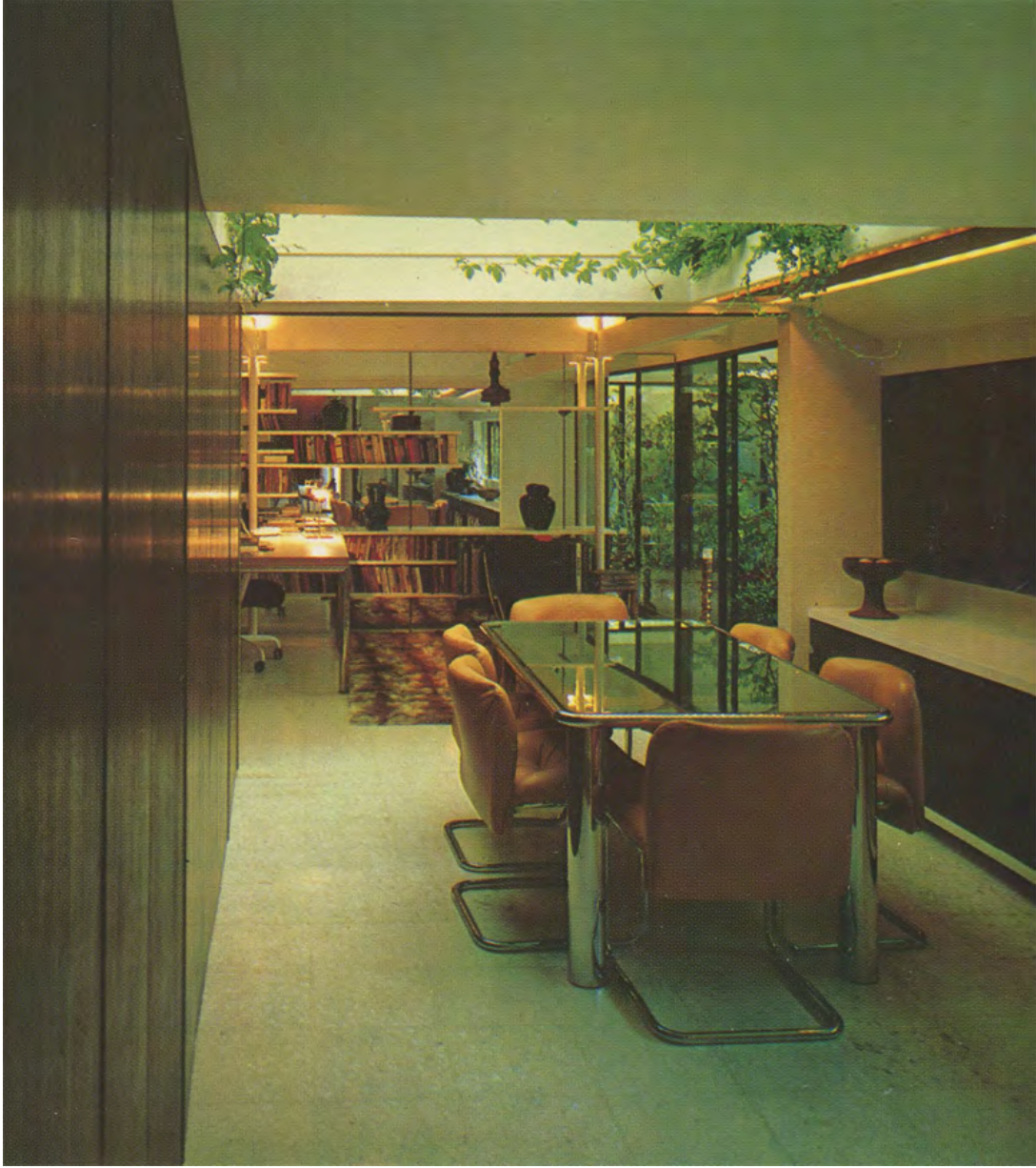
Figure 9. Erickson's dining room. no date.