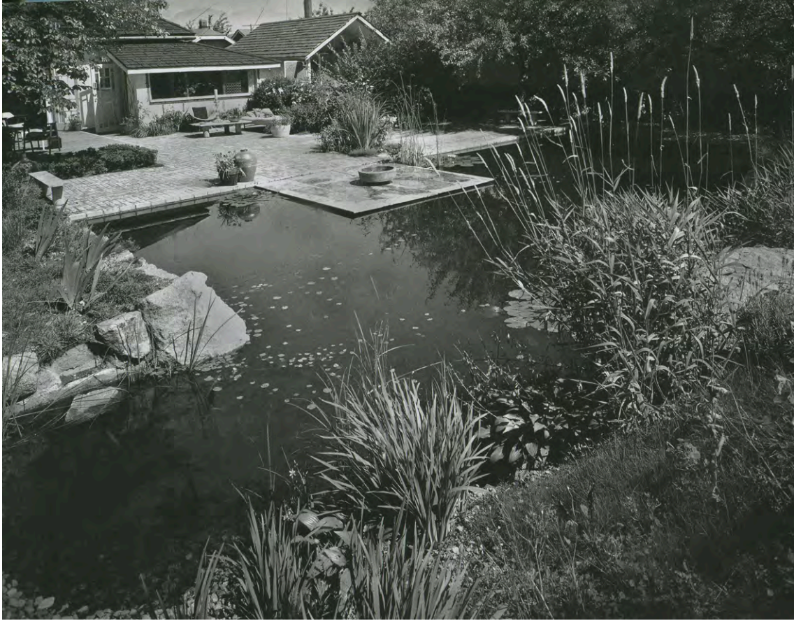
Figure 2. Erickson's home and garden. 1959.