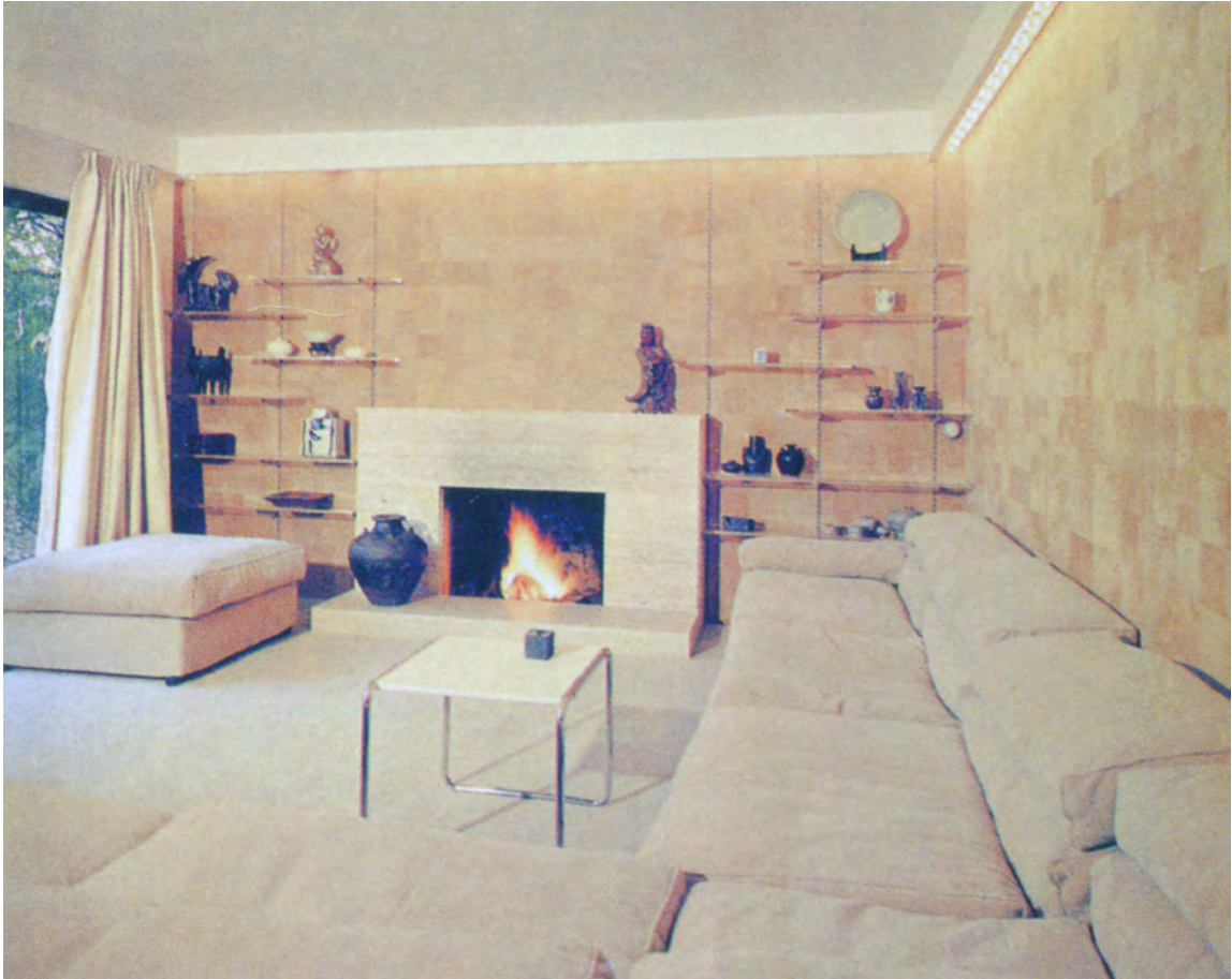
Figure 8. Erickson's living room. no date.