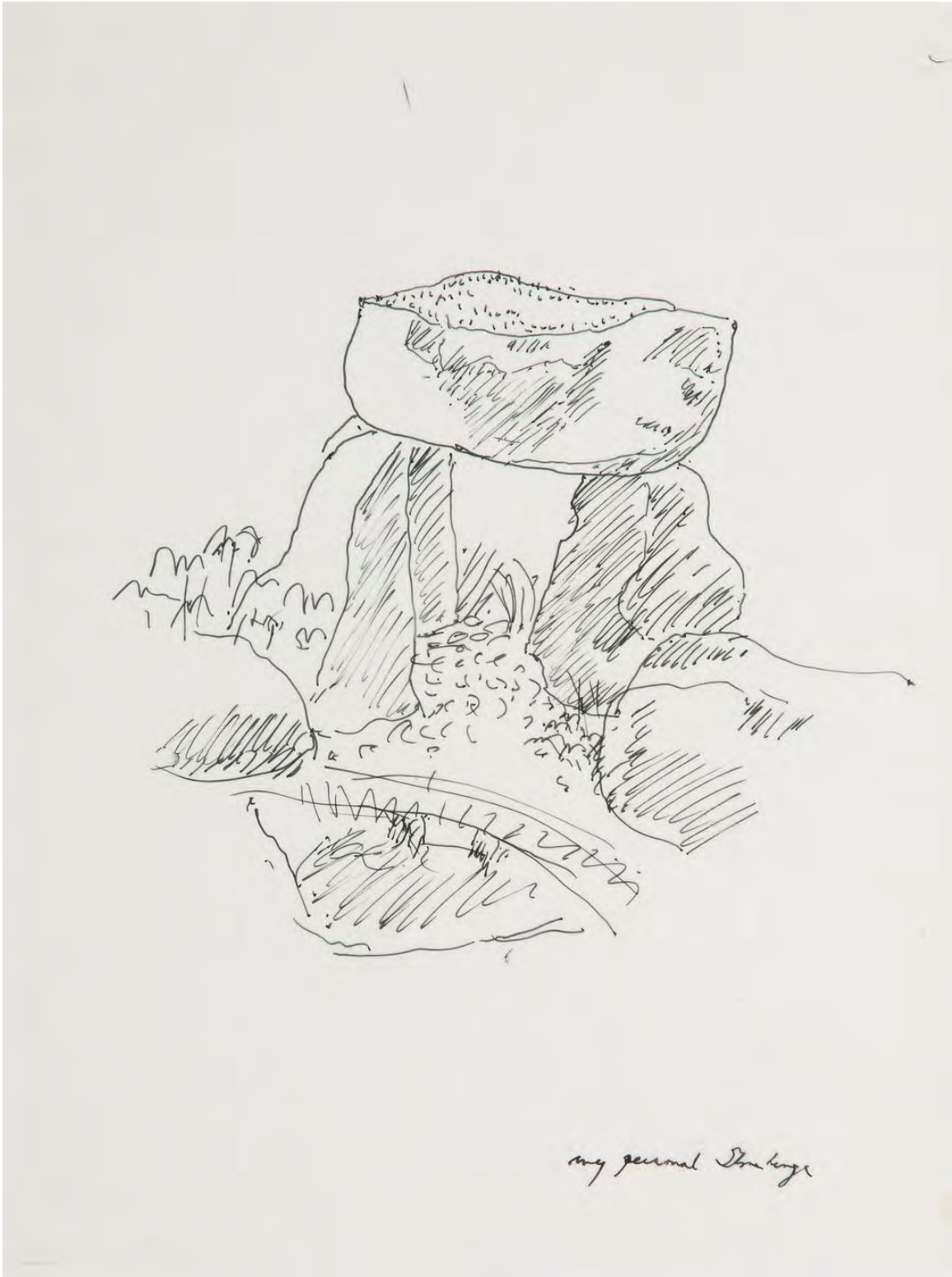
Figure 4. Arthur Erickson, "My Personal Stonehenge" sketch. no date.