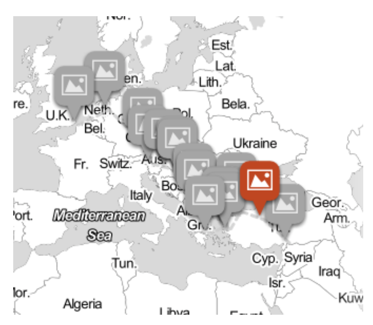
Figure 8. Map of "Exils" route. Nicolae Schiau. (2015).

(the capital of ISIS in Syria), as they moved from Turkey to Germany to France (see Figure 8), a migration that spanned over 6000 km.