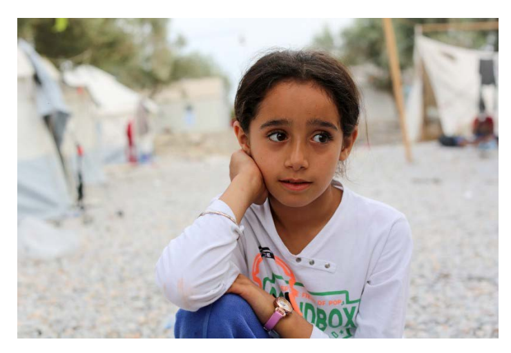
Figure 7. Cover Photo of "Refugee Stories." Brandon Stanton (2015).

(Coconuts Yangon, 2018). In 2 months he raised over US$2 million from more than 39,000 people, and the link to donate received 19,000 shares on Facebook. (Humansofnewyork, 2018)