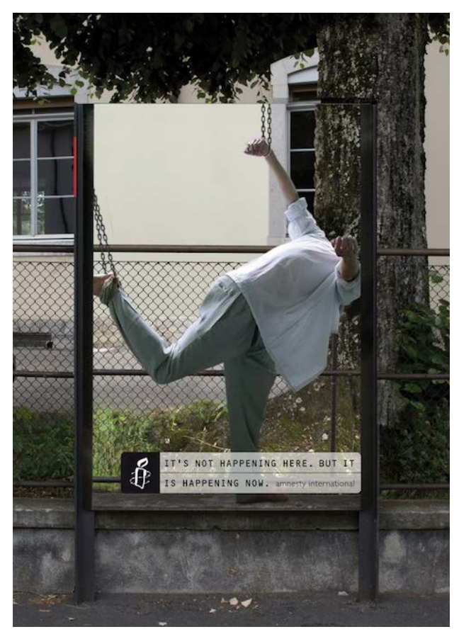
Figure 6. Amnesty International Chronotopic Reversal Ad/Poster campaign. (2017).

Post-humanitarian communication, applied in digital storytelling campaigns, portrays crises through a lens of cool logic that emphasizes realism and simple action; emotion is experienced second, in reflection over the sad reality. This prevents the presentation of the problem from becoming overwhelming, which would risk compassion fatigue. Then, this appeal de-complicates action by substituting the window of moral contemplation and justification with a clear and easy solution: typically, the click of a button. (Chouliaraki, 2010)