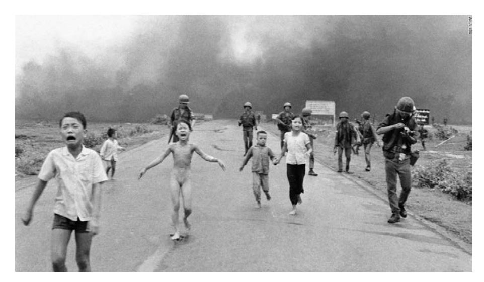
Figure 2. Napalm Girl. Photographed by Nick Ut. (1972).

The "Napalm Girl" became a symbol of the horrors of armed conflict. The photograph features a group of children running up a highway accompanied by several soldiers. The focus is on the child in the middle, nude and screaming after having been hit by napalm. Children, who represent innocence, their crying and screaming faces, the lack of clothing, the soldiers disregard of the children before them, the aggressive cloud of black smoke in the background, are all components to the image that evoke a loud response of horror and shame to the viewer who did not intervene the conflict that caused the moment. Another known image is of Omayra Sánchez Garzón (see Figure 3) in Armero, Colombia, taken by Frank Fournier and released to news outlets in November 1985.