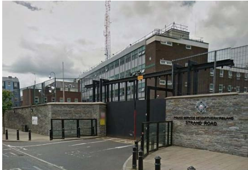
Figure 5 and Figure 6 below. The intention of these architectural changes was to keep the people inside the stations safe, but also resulted in keeping the community out.