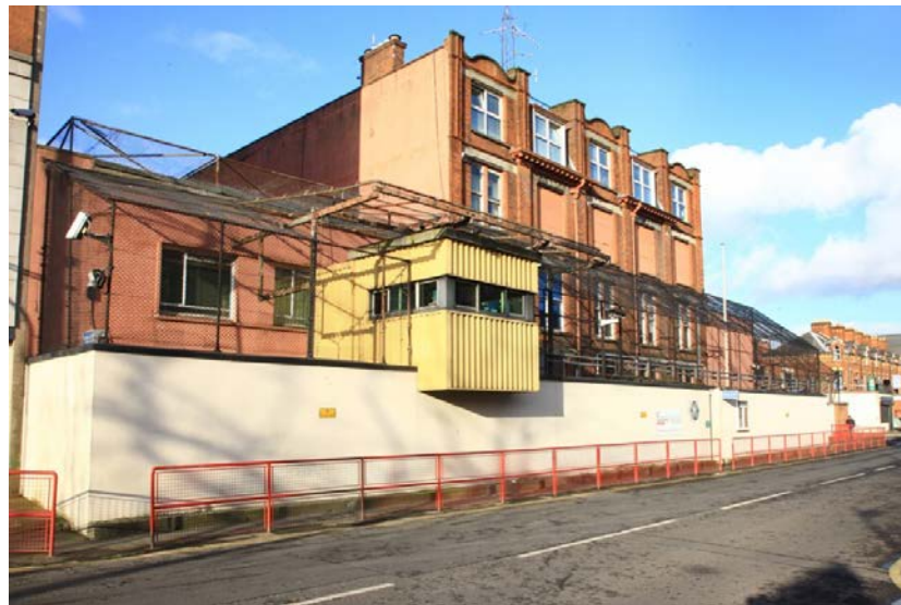
Figure 5. Strand Road Station, Derry