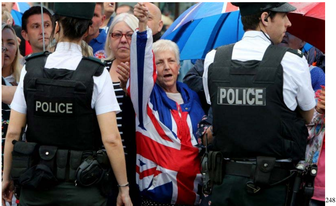
Figure 11. Police keep the peace at a Loyalist parade

In addition to the changes to the buildings, the PSNI also made moves to reduce the militarized nature of their public order uniforms as seen in Figure 11 below. Whenever possible, they wear their regular uniforms with ‘stab vests’ which are a less bulky protective vest that allow officers more freedom of movement and are also less imposing for the public. One officer said that the switch from bulletproof bomb vests to the stab vests was a step toward what he called “community standard policing.” He felt this signaled the demilitarization of the police to the community and the police alike. 247