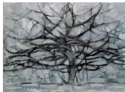
Figure 5. Piet Mondrian, Grey Tree , 1912, Oil on canvas, 78.5 x 107.5 cm, Gemeentemuseum, Slijper Collection, The Hague