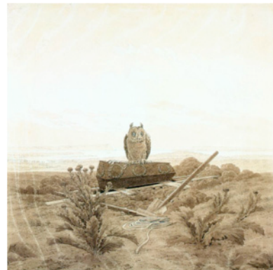
Figure 7. Caspar David Friedrich Landscape with Grave, Casket and Owl , 1836/37, Sepia, pencil and charcoal, 48.5 x 38.5 cm, Kunsthalle, Hamburg.

Friedrich’s Landscape with Grave, Casket and Owl (1837/38), a study in pencil and sepia, is a remarkable pendant to those many figures seen from behind—the Rückenfiguren that are his stock in trade. The owl, given its uncanny ability to rotate its head, is uniquely suited to the tropism endemic to a story—Conrad’s—in which the platform of the narrative is the deck of a boat that is shifting on its mooring with the turn of the tide. 32 By story’s end it is facing in the opposite direction—a reversal consistent with the inversion ( Verkehrung ) named by Freud. This turning is also germane to the novella’s apotropaic aspect, of which those severed heads on posts are also examples. In turning, their purpose is to “turn away,” in the sense of “warding