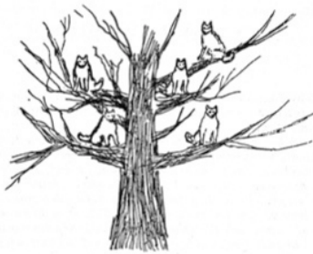
Figure 4. Illustration from Freud’s Beyond the Pleasure Principle

The feral undertow of captivation is explored and to an extent theorized by Freud at a step in his analysis of the “Wolfman.” Freud’s patient reported having