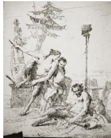
Figure 8. Giovanni Battista Tiepolo Scherzi/Satyr Family, 1742/63, Etching, 226 x 176 cm, National Gallery of Art, Washington, Rosenwald Collection.

But they are remarkable for their irreality. Calasso discourses on the near omnipresence of snakes in those etchings of Tiepolo’s—snakes that crawl, coil around staffs or the gnarled trunks of dead trees, and snakes that, in keeping with a certain Biblical exhortation, are burnt. Another in the series shows a magus burning a snake in a cauldron, and there are several such images. Relevant episodes from the Bible are named, such as when Aaron’s rod turns into a snake when cast upon the ground before the Pharaoh, or when Moses, whose people are beset with venomous snakes, commands them to contemplate the bronze figure of a serpent—“a gesture that marks the discovery that evil can be cured by its image.” 35 In this gesture we may recognize the aforesaid “capacity to turn the violence of life back against its own violence.” But what dazzles about these Scherzi is a blanching daylight so insistent that the owls confer upon it a sense of inverse extremity,