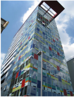
Figure 1. William Allen Alsop (architect), Colorium , Düsseldorf, 2001.

of primary color and non-color isolated within uneven but severe grids of emphatic black. The insistent flatness that characterizes his mature style (after 1920) provides a platform for the taut interplay of autonomous, non-identical elements whose precise positioning creates both a rhythmic balance and a visual pulse.