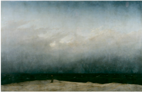
Figure 3. Caspar David Friedrich, Monk by the Sea , 1809, Oil on canvas, 110 x 171.5 cm, Nationalgalerie, Berlin.