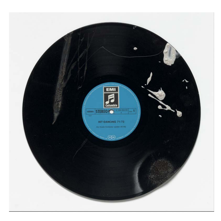
Figure 3: An example of Destroyed Music .