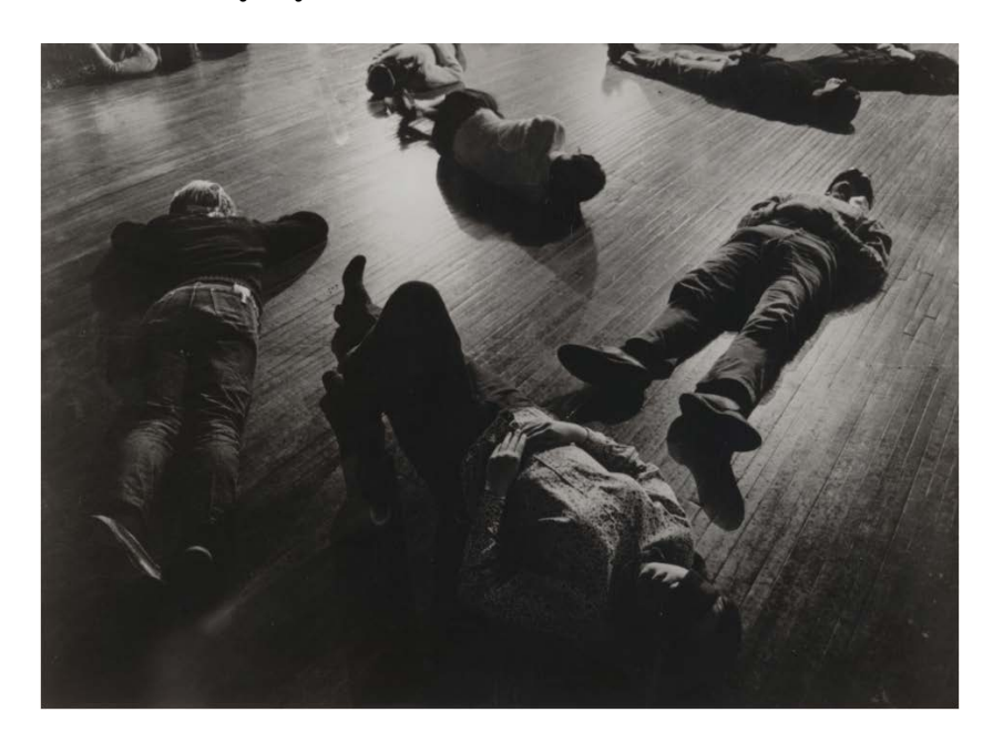
The Everyday and the Ritual in New Contexts