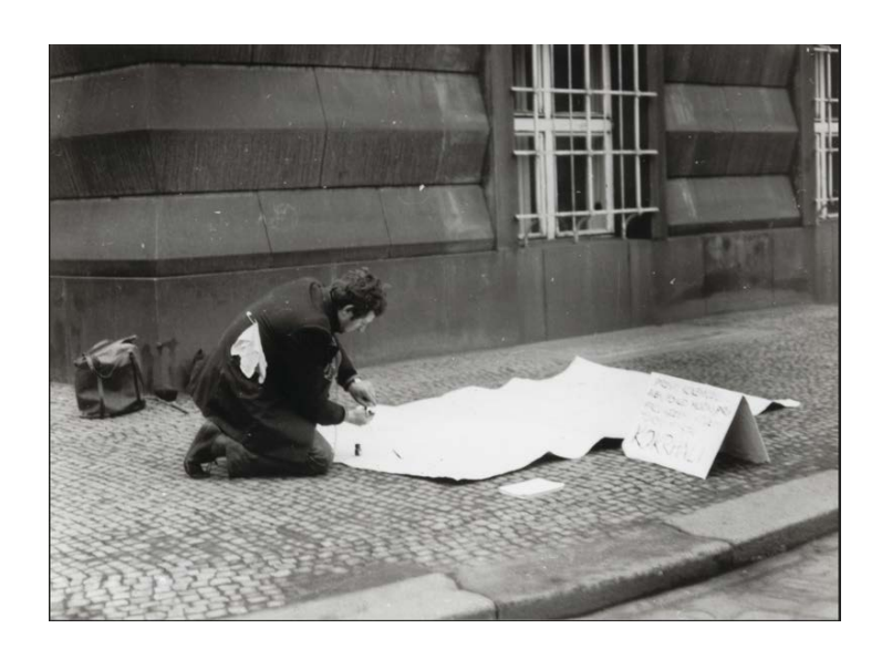
Figure 4: Milan Knizak performing Demonstration for One (1964).