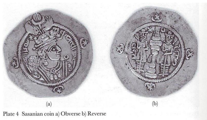
Plate 4 Sasanian coin a) Obverse b) Reverse

In spite of tensions, Persia and Rome traded with one another, even during wartime. Briefly, a treaty of 298 made Nisibis the only place of exchange between the east and west. But this bore little impact on shipping, and soon widespread trade resumed. 65 Numerous treaties, diplomatic frameworks, and customs duties between the powers made for a “regulated exchange of goods.” 66