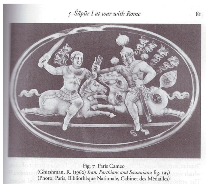
Figure 2: Shapur I captures Emperor Valarian

The world of late antiquity—not unlike the world of today—had a long history of east-west conflict. Fraught with tensions and fueled by old hatreds, the empires collided in continual warfare and conquest. The Parthians, originally nomads who emerged in the third century BC, were fierce. 28 Rome viewed their successors, the Sasanian dynasty, as a serious threat. 29 Initially, tensions had little to do with religion. In fact, early Christians went to Persia willingly. They were often safer and happier in the Parthian Empire, whose religious policy of non-interference protected them, than they were in the Roman Empire, where they were sent to the arena to die in droves. 30 It was not until after Zoroastrianism 31 was adopted by the Sasanian government in the late third century CE that Christians were treated with suspicion and violence. 32 Yet wars between Rome and Persia were primarily territorial in nature. 33 From the start, “it was above all the military confrontations that characterized Rome’s relations with her Eastern neighbors.” 34 Roman-Sasanian conflict was fierce even at the top. In 363 CE, Emperor Julian lost his life while advancing against Ktesiphon. 35 Many depictions exist of Valarian being captured by Shapur I. 36 From the top of society to the bottom, east-west conflict was fierce.