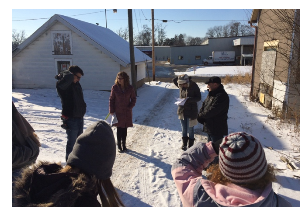
Figure 3: Student team with a community partner acting as a client on a site visit. This type of close collaboration with a party outside the university where students address real-world program and user needs and budgetary constraints is not the norm for design studio projects.

While the case study provides clear evidence of the benefits associated with simulating an integrated design process in an architecture design studio, there are at least five challenges worth mentioning that are revealed through the case study example. First, since the students acting as "experts" are learning these skills real-time, this impacts the effectiveness and accuracy of the information they provide to the