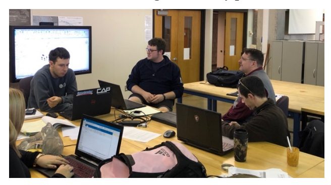
Figure 2: Student team with an industry partner acting as a consultant. Both sides are collaborating to develop a viable solution to a real-world problem, which is very different from a guest lecture, etc. (by authors)

Industry partners from outside the university provide expertise in specific disciplines such as: green design, housing design, photovoltaic systems, HVAC systems, construction, real-estate trends, etc. These partners interface with the studio in different ways. Approaches include: a series of Friday discussions on campus where the partners present information and answer student questions; partners providing PDF mark-ups of drawings and reports as feedback to the teams; and in-studio charrettes with the partners to generate ideas. The approaches differ based on the proximity of the partners to our off-the-beaten-path campus and/or availability. However, video conferencing, field trips, and a limited number of in-person visits are sufficient in terms of harnessing the expertise of these professionals and soliciting feedback. See Figure 2 below for a photo of student teams working an industry partner.