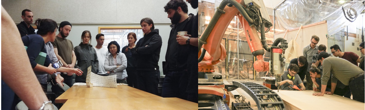
Figure 5. Teaching environment of workshop classroom (left) and fabrication space (right)

The workshop, led by the authors, has run annually for the last three years (2016-2018) and has included both practicing professionals, wood industry researchers, as well as students. Professionals include architects interested in learning the process, fabricators who are interested in engaging with new manufacturing tools, students from disciplines other than architecture such as industrial designers and engineers, as well as professors and shop staff from other universities who would like to understand the process and technologies involved.