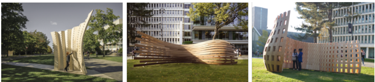
Figure 6. Three pavilions in-situ