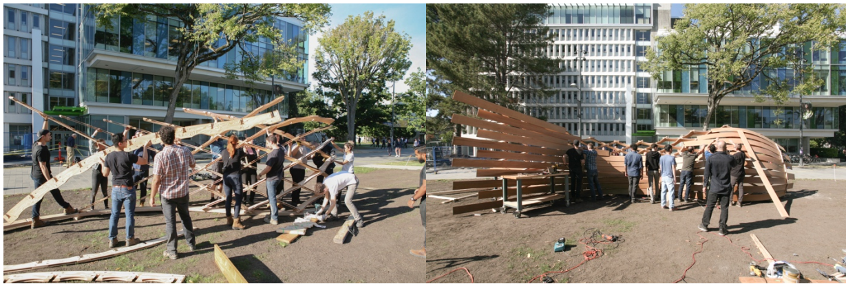
Figure 3. Workshop 2 assembly of diagrid (left) assembly of cedar planks (right)

One example of this process can be provided by the 2017 workshop UBC developed by the authors. The design integrates elastic bending of cedar planks to form a structurally stiffening skin over a diagrid structure. Computational form finding tools are used to rationalize a doubly curved surface using geodesic line principles that guide the positioning of the linear planks and the diagrid connection points. Assembly instructions are then also embedded within the components so that assembly can be carried out quickly. This last point was emphasized during the assembly of the diagrid (see Figure 2) as it took only 3 hours whereas the assembly of the cedar planks – an apparently simpler task (see Figure 3) - took 8 hours because the instructions for placement were not embedded in the planks and instead they had to be measured and marked for placement.