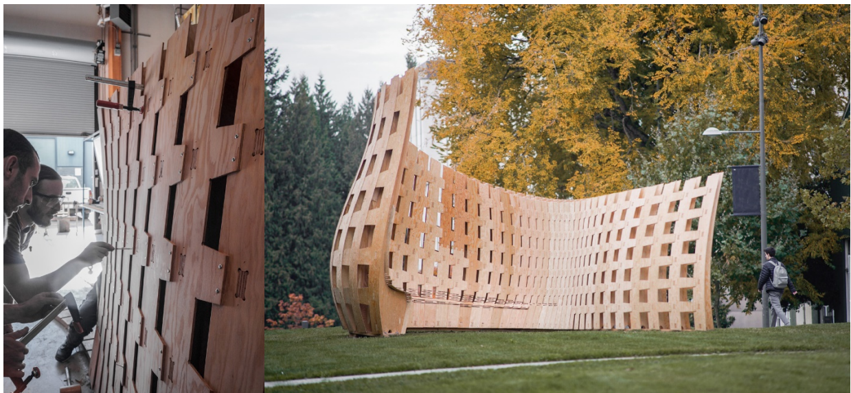
Figure 1. In shop fabrication of 2019 installation (left) and final outcome (right)

Through a set of intensive fabrication workshops, carried out by the authors, a targeted pedagogical model is aimed at knowledge creation within a compressed framework. Engaging participants to a particular point in the building process - that point at which a design is materialized through fabrication processes - provides a unique platform to shift from exploratory conceptualization to technically informed hands-on implementation.