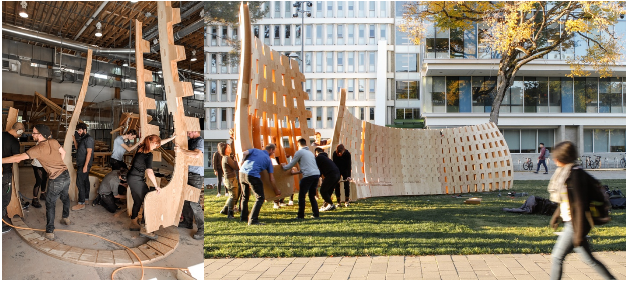
Figure 8. Workshop 3: More prefabrication in shop and less assembly on site