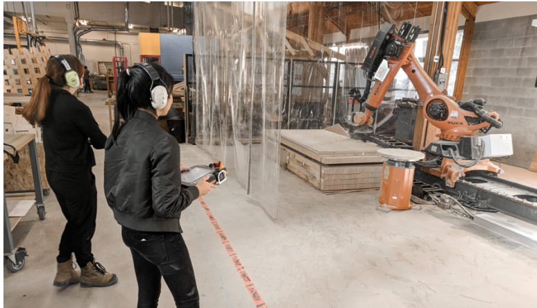
Figure 9. Working with the industrial robot

The design process and methodology presented during the workshop are focused on timber fabrication, but it provides learning outcomes that are not specific to a particular material or a particular piece of equipment. The method is intended to demonstrate a design approach that is highly informed by the process of materialization. In other words, the workshop demonstrates the role of fabrication and material engagement as a critical design component in the execution of a larger design intent. This is a learning outcome that participants can apply to other materials and other fabrication technologies in their design practice. Knowledge of tools, techniques and materials in building construction are critical to the design practice, as is the understanding that any of these aspects can undergo innovation that will change their relationship. As such, the experience is broader and engages more aspects of architectural production than may be apparent at the outset.