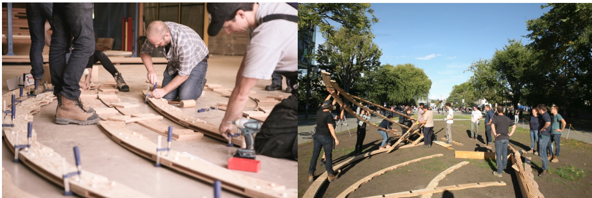
Figure 7. Workshop 2: Some prefabrication in shop and more assembly on site

The third to fifth days of the workshop are dedicated to fabrication and assembly (depending on the staging and construction sequence of the particular workshop, assembly may begin earlier or later on the second day). This work may be carried out in the shop or in the field. The first and last workshop had assembly mainly taking place in the shop with relatively little assembly in the field. This allows shelter in case of inclement weather but also allows easier access to most tools without extensive equipment requirements on site. This section of the workshop is not always possible for all participants, due to professional or academic constraints, but every effort is made to facilitate participation (i.e. people can take part for portions of the project as possible).