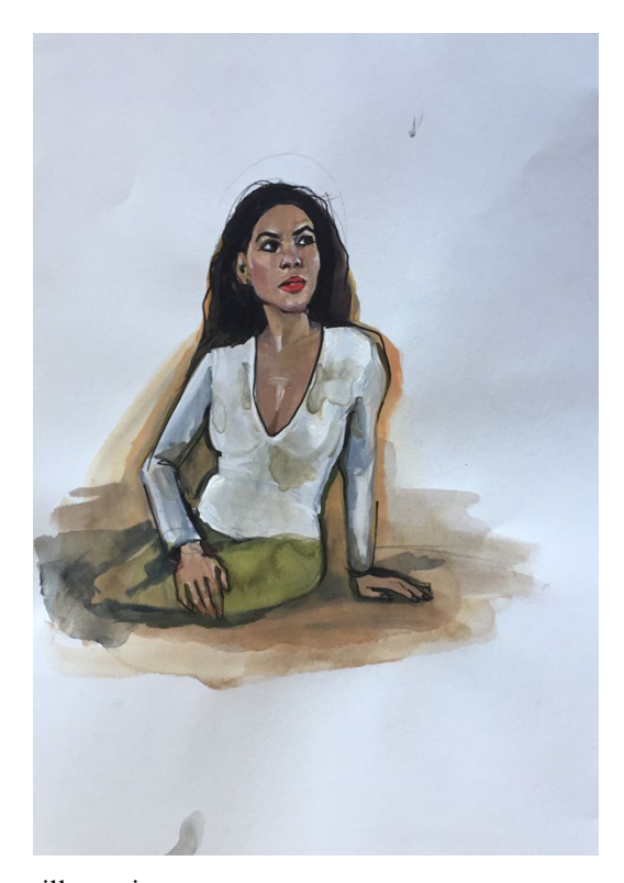
Figure 14. Erda costume illustration

There are two primary elements that I would carry out in this production: Chéreau's pianissimo "Ring" and Schenk's character blocking. Erda's dynamic contrast in Chéreau's production illustrates the care the Earth goddess has for Wotan, despite his selfishness. Like Schenk, I think that Erda and Wotan should interact with each other with both their bodies and their words. Wotan freezes in fear at Erda's touch, his emotional state palpable to the audience as well.