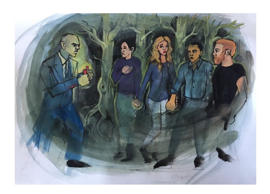
Figure 9. Loge scene illustration

My staging blends Lepage's use of fire with Chéreau's human caravan. Wotan, Fricka, Donner, and Froh hold hands on the right side of the stage, whereas Loge stands to their left. I thought that the gods' assembly into this formation is particularly effective in creating a partition between a corrupt Loge and the good gods. Loge uses the lighter not only to illustrate his points, but to intimidate and provoke his comrades. The stage is dim, but light emanating from Loge's flame illuminates emotions—both malicious and gleeful—that surface on his face. He breaks the caravan with his lighter rather than with his hands, and the gods gasp in anticipation of searing pain.