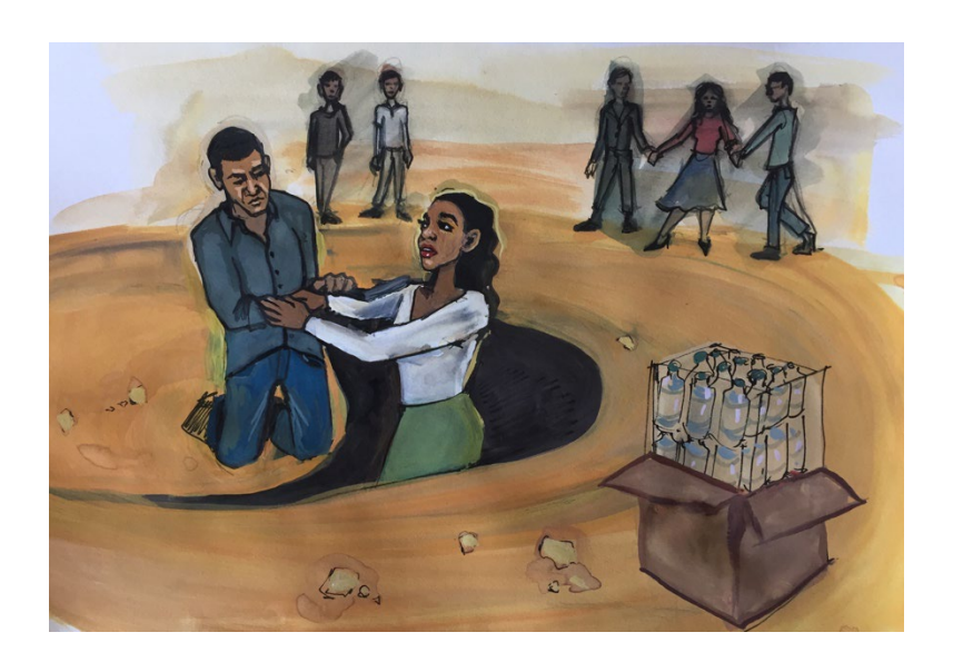
Figure 13. Erda scene illustration

Computerization and high-tech props detract from the environmental apocalyptic message, so my production will consequently be bare bones. The greyscale utilized in the Schenk and Chéreau productions is inconsistent with the dusty, drought-stricken, and hazy world in which my production takes place. In accordance with this barren landscape, Erda will emerge from a dry riverbed gripping Wotan.