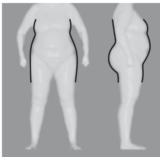
Fig. 2. Subject #3, whose smaller bust and larger hip circumferences visually indicate a Triangle shape.

Another instance in which the 2007 FFIT formulas failed to correctly categorize plus size scans was with the Triangle shape. In order for a scan to be considered a Triangle shape, it must have met the criteria that the hip measurement was significantly larger than the bust. In Table 8, Subject #3's scan was classified as a Rectangle because the hip circumference was not significantly greater, 3.6" or more, than the bust circumference. However, the negative difference between bust and waist measurements (bust-waist) and positive difference between hip and waist measurements (hip-waist) indicated a body shape which visually appeared to be a Triangle, with a smaller bust and larger lower (waist and hip) circumferences (Fig. 2). While these scans may have seemed similar to the Diamond or Oval shape, the larger hip than waist measure indicated an abdomen that was not prominent enough to be considered a Diamond or Oval shape. To capture plus size scans with a large abdomen and a slightly larger hip, a further calculation was added to the Triangle measurement to assess whether the bust was smaller than the waist. After the original formula to determine a Triangle shape, a second formula, if (bust-waist) < 0, then if (hip-waist) ≥ 0, captured scans with a larger abdomen and hip compared to the bust. Taking into consideration how plus size women often carry weight in their abdomen as opposed to their hip, this change to the formula more accurately categorized these scans.