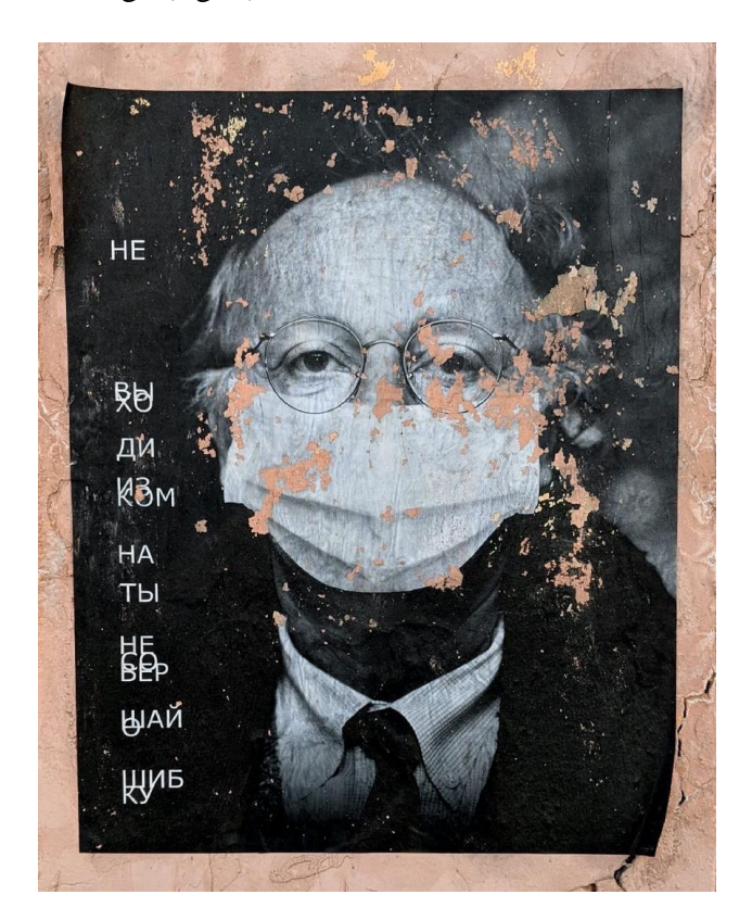
Fig. 4. The graffiti, entitled "Don't Leave the Room. Don't Make a Mistake," by the art group HALVAHFABRIC can be found at the Kozhevennaia metro line on Vasilievsky Island in St Petersburg.

and a half) and launched a number of online flash-mobs encouraging its followers to post poetry-related images from their own media pages. A poetry fan from Novosibirsk created a Telegram chat @BrodskyFM in 2018, followed by a chat-bot @JosephBrodsky_bot, and soon every person with a smartphone could indeed have a conversation with Brodsky right in their own rooms. Brodsky's lines spilled into the space of the city as well, when his poem "Don't Leave the Room" became the unofficial anthem of the pandemic (fig. 4). Graffiti depicting the poet on a middle school's fence, which was promptly whitewashed by the local zavkhoz (supply and maintenance manager), was met with indignation by the citizens of Petersburg and received wide online coverage (fig. 5).