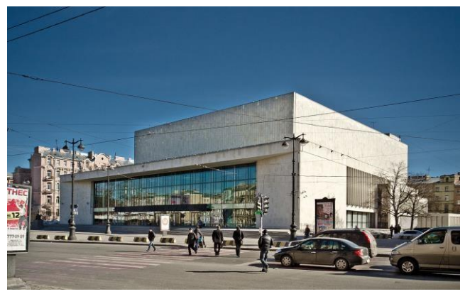
Fig. 2 Bol'shoi kontsertnyi zal Oktiabr'skii (The October Big Concert Hall (BKZ)). The Concert Hall was erected in place of the "Greek Church" in the Greek Square. It opened in October 1967, inaugurating the fifty-year-anniversary of the October Revolution.

The routine demolition process, leisurely related with "a flavor of spontaneous thought," using Gardner's words, in the poem's opening, moves away from banality as the speaker begins mediating on the "proportions of ugliness" that affect humans much more than "ugly proportions." The poem projects this scene onto a contemplation of the historical process, of displacement, and of topographical memory, and it slowly arrives at a series of truly philosophical questions: