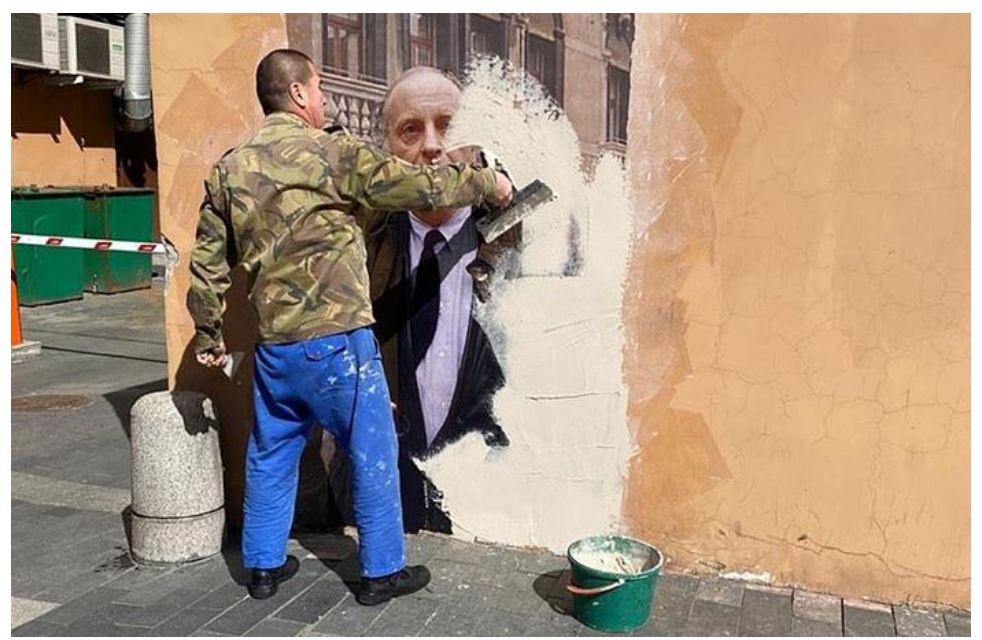
Fig. 5. A worker is whitewashing the graffiti of Brodsky on Pestel' Street in St Petersburg.

As such media-inspired incidents suggest, online Brodsky seems to be anything but a national monument, and, in fact, might be seen as a logical extension of the bilingual Brodsky that has occupied an uncomfortable role in not just the American, but also the Russian canon. A scholarly analysis of Brodsky's recent media presence in Russia in the vein of Digital Humanities, coupled with research into his appearance in numerous interviews and documentaries recorded in America and Europe (mainly Italy) during his life, would be a fitting complement to my analysis of Brodsky's bilingualism and would serve as further testament to his status as a transnational and trans-medial figure.