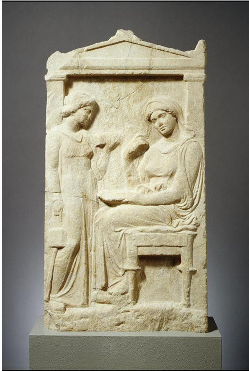
Figure 3: Marble stele of Phainippe, 400-390 BCE 13

According to the popular, contemporary iconography, Hegeso's slave is a stereotypical depiction of an Attic slave. The visual stereotypes of slavery are what define her both as a slave and a person, and this use of stereotype also applies to the depiction of Hegeso. The stele is not aiming to convey an individualistic portrait of Hegeso and her slave. Instead, the stele, the artist, and the commissioner behind it are portraying "stereotypes of man, woman and maid" and using