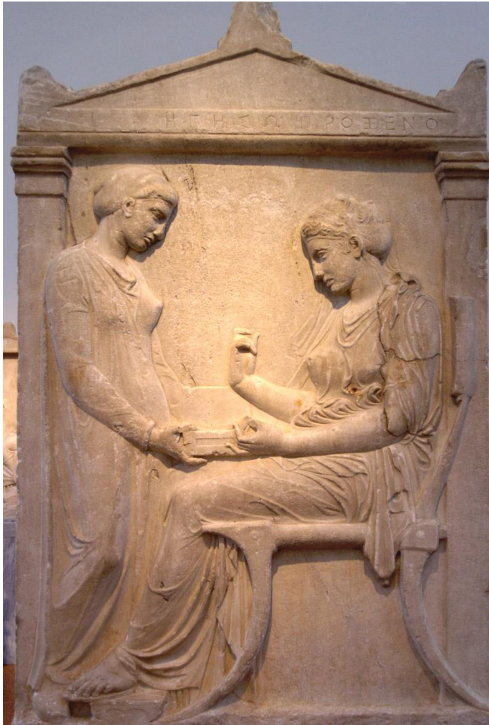
Figure 1: The Grave Stele of Hegeso, 400 BCE 2

of jewelry. The stele is a naiskos form, meaning that it emulates the architectural form of a classical Attic temple, with two columns and a pediment framing the two figures.