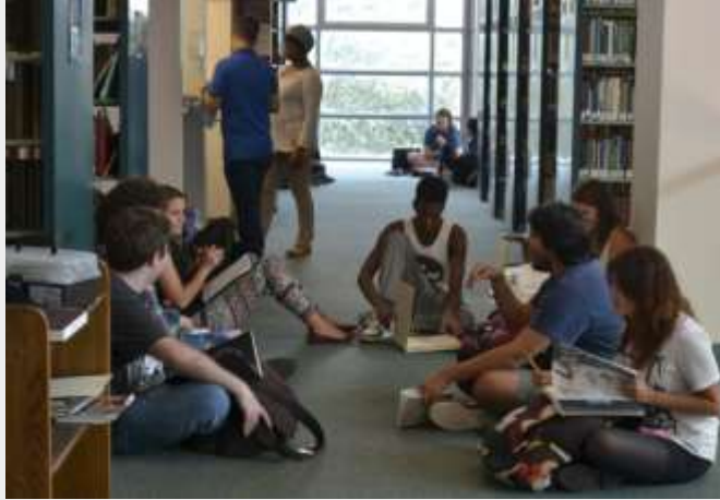
Students creating their own group-study space on the floor in another part of Wimberly

Since March 19, 2020 the faculty and staff of the FAU Libraries have been working remotely and perfecting new ways of serving FAU's students, faculty, and community almost entirely without face-to-face interaction. I have described some of that effort in a previous posting entitled Library Redux . While some of what we have learned to do effectively in this world of safe social distancing will carry over and enable us to improve our services once we are back, we miss our community and we are all looking forward to the day when we will be able to reopen our doors and interact with our community face-to-face.