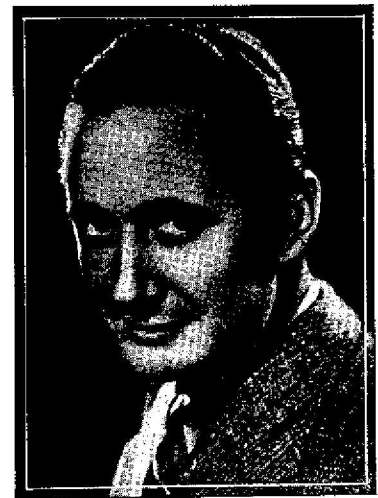
Nino Martini, world famous tenor for his appearances over the radio, at the Metropolitan Opera, and in the movies, will thrill added thousands with his voice when he sings on the campus May 9 in an ASUO spring concert.