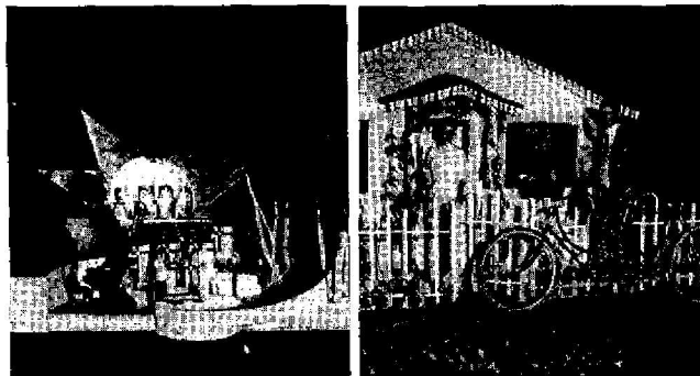
Scenes above will remind alums of former Junior weekends when they either participated in the events as students or visitors. Left is the handstand and queen's throne, to the right is last year's prize winning float, "A Bicycle Built for Two," built by Alpha Gamma Delta and Beta Theta Pi.

Speakers for the main events have not been announced as yet, but selection committees are considering various prominent men, and they will be announced in the May issue of Old Oregon .