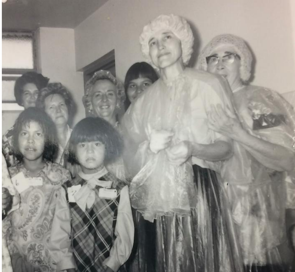
Figure 2. Relief Society Women Bathing Incoming Placement Students.

distanced the processor from the processed, reveals at best a racist belief in the incapability of Indian children to wash themselves, and at worst a desire to control and to remake.