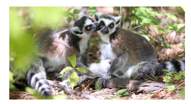
Individuals participating in an affiliative interaction