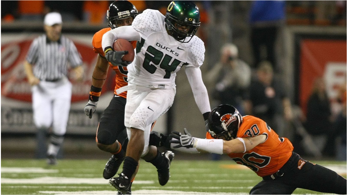
Figure 1 Getty Images 2008