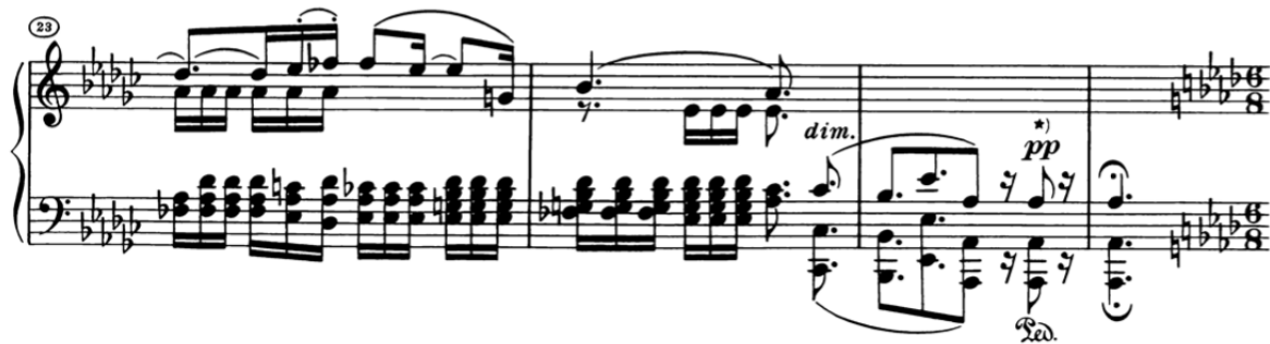
Figure: 2.15 , Adagio ma non troppo , mm. 33–36.