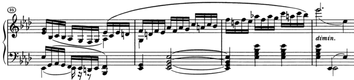
Figure 2.3 and 2.4 Moderato cantabile molto espressivo , transition to development, mm. 38–39.

An intriguing transition from the second theme to the development occurs in mm. 35–40. After three measures in E \flat major, the music follows the descending line E \flat –D \flat –C. Beethoven modulates via common tone by using C. This is the same melody as the opening but with a new harmonization.