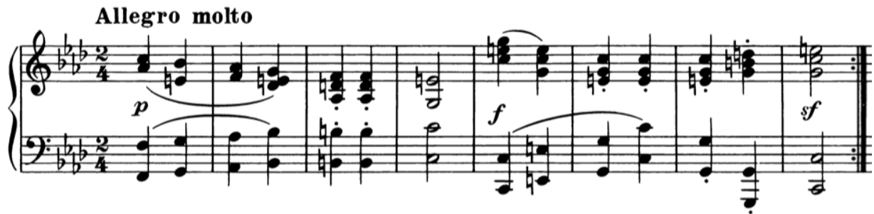
Figure 2.11 Ich bin Luderlich, du bist luderlich (“I am dissolute, you are dissolute”). 9