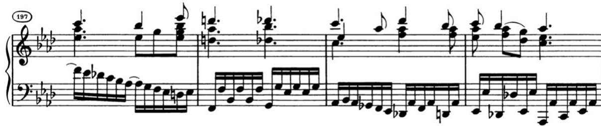
Figure: 4.13, Adagio ma non troppo , mm. 197–200.

There should be a small ritardando following the agogic accent on the last note in m. 200 since this is a major climax. From m. 201 to the end, in the coda, the left hand should use a rotation technique to keep articulating the bass notes and to keep the sound clear. The final A-flat arpeggio cannot be faster than the rest of the movement; it is a celebratory passage where all the notes should be heard.