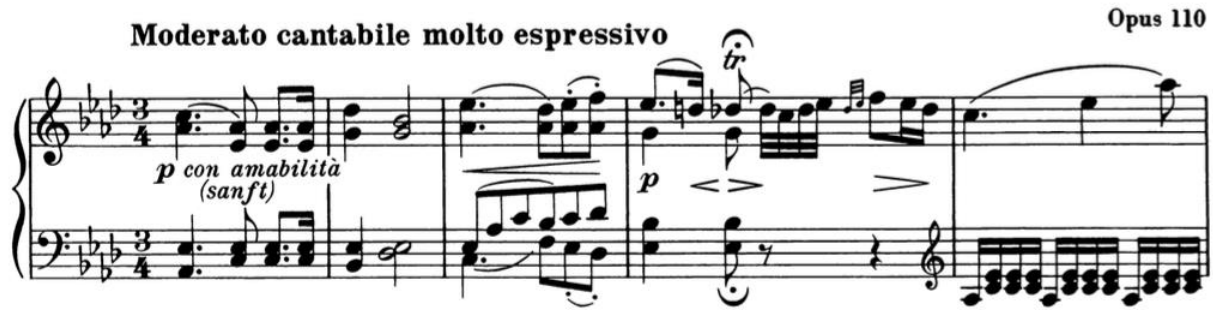
Figure 4.2 Moderato cantabile molto espressivo , first theme, mm. 20–25.