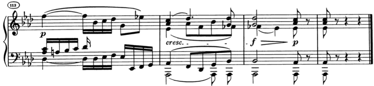
Figure 2.8 Moderato cantabile molto espressivo , coda, mm. 114–116.