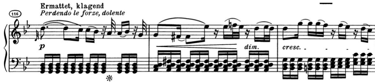
Figure: 4.11 , Adagio ma non troppo , mm. 116–118.

Another passage that needs extra attention is in mm. 132–136. The rests need to be precisely counted. The pedal marking in m. 132 indicates that the pedal should be held until the end of m. 136. This passage was previously described in Chapter Two as the feeling of returning to life, where we emerge from the deepest regions of darkness to the light. To create this effect, the pianist should put the pedal down and begin piano in m. 132, continuously increasing the dynamic level for each chord until reaching forte . In m. 135, lift the pedal little by little, so the sounds become clearer and there is no pedal in m. 137.