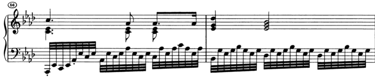
Figure 2.6 Moderato cantabile molto espressivo , recapitulation, mm. 56–57.

The process of modulation that Beethoven uses is fascinating. He uses the D\flat in m. 66 to modulate enharmonically (changing the note to C sharp) to the remote key of E major. From mm. 67–78, the music unfolds in E major until a transition in m. 78 where the music returns to the tonic. From here until m. 97, the second theme unfolds in A\flat . A transition to the coda begins in m. 97. Here, Beethoven expands the sixteenth-note idea of mm. 93–94, using the sixteenth notes in the right hand as a connecting bridge to the chord progression in the left hand: A\flat flat, B\flat 7 (V/V), and E\flat . This leads to a chord progression in m. 101 that prepares the listener to the arrival of the coda.