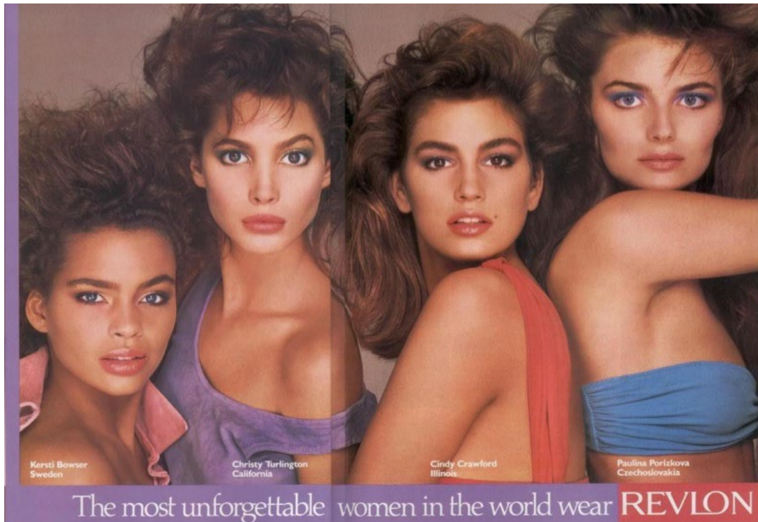
Revlon 1980's Print Ad

Michael Jackson. Despite this conservative American government, style in the 80's revolved around boldness and playfulness (A&E).