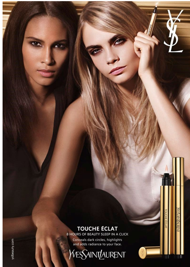
Yves Saint Laurent Print Ad (2015)

Headlining the product's features prioritizes the message of why the consumer is paying for an expensive product. YSL is communicating that the product's formulation is worth the purchase, and the product delivers on achieving a well-rested appearance.