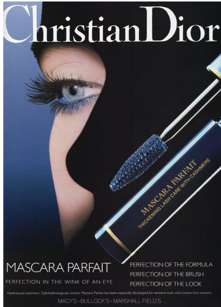
Christian Dior Mascara Parfait Print Ad, July 1990 issue of Vogue

rooted in individuality and mystery rather than adhering to the girl-next-door aesthetic from previous decades.