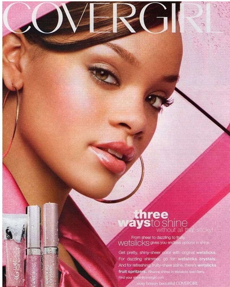
CoverGirl Westicks Print Ad (2006)

in the 80's, and neglects to show unconventional beauty and sidelined demographics, similar to the conservatism seen in the 1980's.