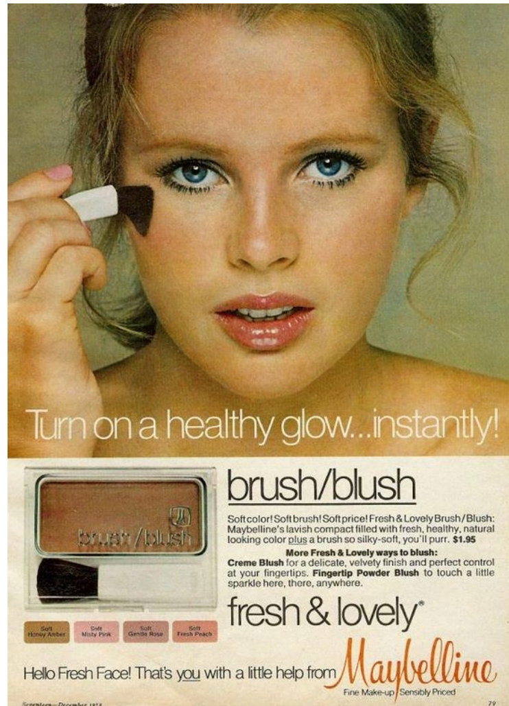
Maybelline Print Ad from the September 1978 issue of Seventeen

this magazine advertising, emphasizing natural beauty and pivoting away from heavy makeup designed to transform the face.