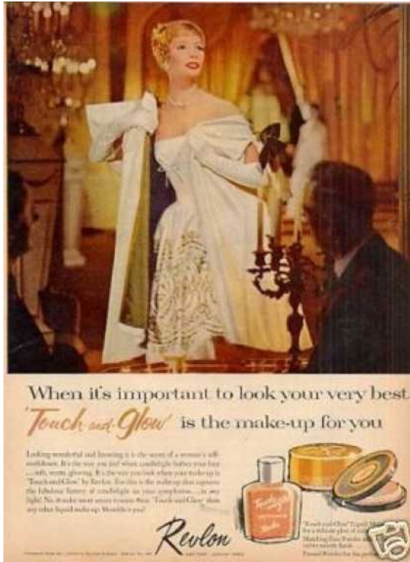
Revlon Touch and Glow Make-Up Print Ad (1960)

and red lips. What we see here and will continue to see for decades is the stereotypical face of cosmetics brands, without flaw or any diversity until around the 21 st century.