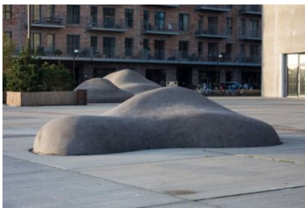
Figure 3: Curved Bench

Spikes placed under a covered area where the unhoused may seek shelter.