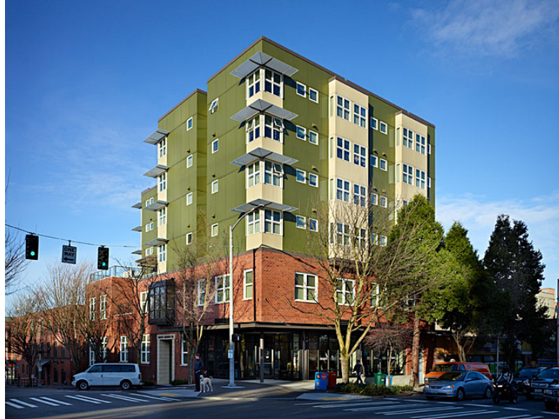
Figure 2: Bakhita Gardens,

Designed by Environmental Works Community Design Center, located in Seattle Washington.