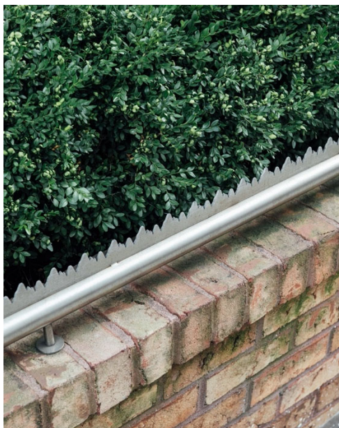
Figure 4: Spiked railing

Pointed metal and railing have been added to a brick ledge to prevent someone from sitting or resting, as well as skateboarding.