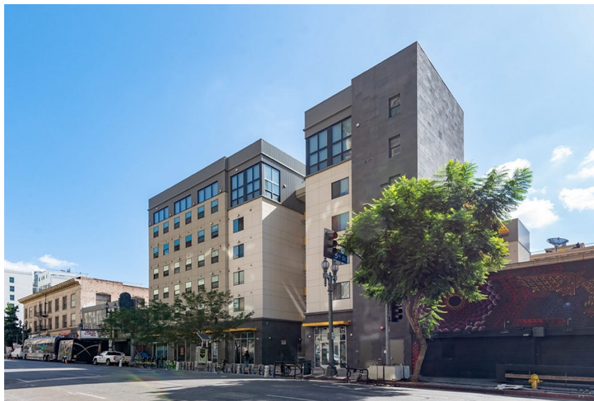
Figure 3: New Genesis Apartments

they found it difficult to live in a fully open dorm system. The women “wanted a sense of community with congregate space but also the ability for you to hear your neighbor breathe and move around but not see them.” (Design Resources for homelessness). In the end the design team went with partial-wall cubicles to allow the right balance of both connectivity and openness with a sense of personal privacy.