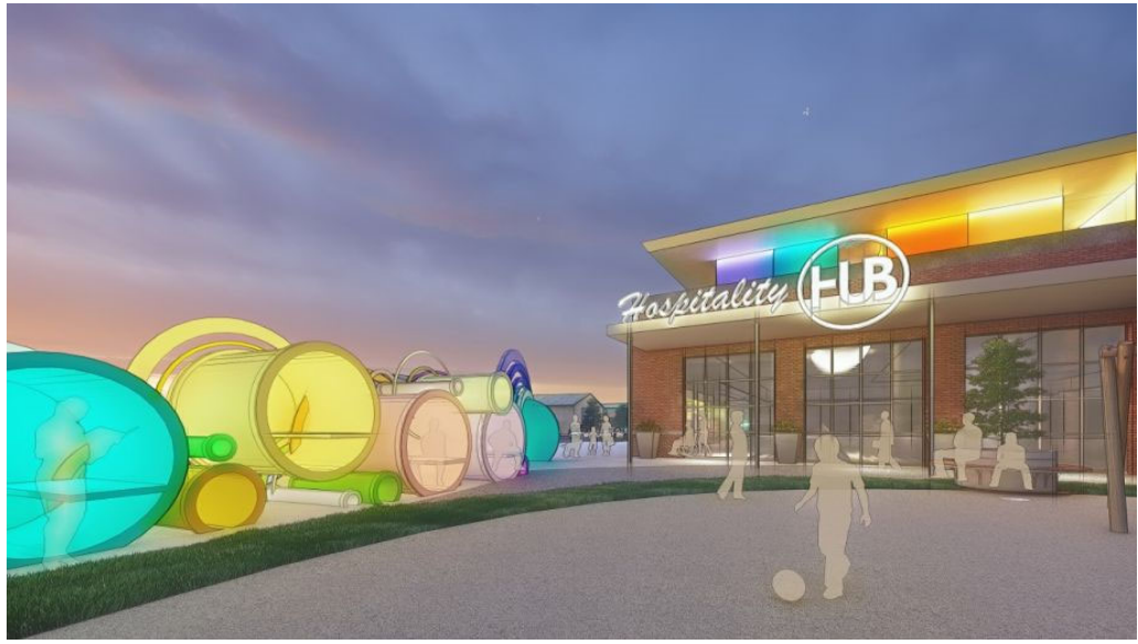
Figure 4: Hospitality Hub

Additions in progress designed by A2H Engineers Architects Planners, in Memphis Tennessee