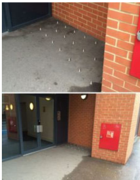
Figure 2: Anti-Homeless Spikes

Spikes placed under a covered area where the unhoused may seek shelter.