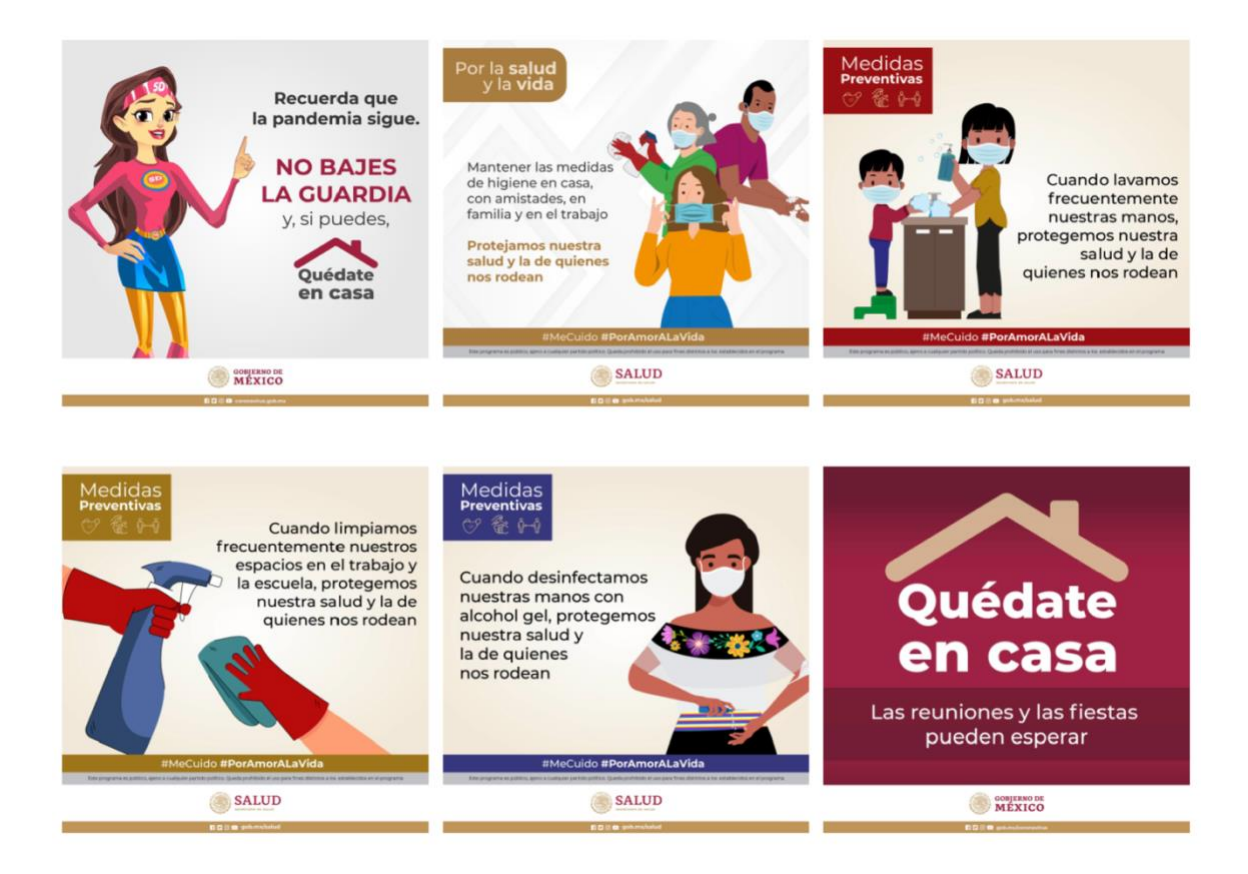
Figure 5. Infographics released by the Mexican Ministry of Health on social media.

The infographics visualize the gendered social expectation of women being tasked to ensure COVID-19 preventative measures are being followed at home. The internalization of these beliefs was echoed across interviews and showcases how women in this community were tasked with being the first line of defense in preventing the virus from spreading. The added responsibility of maintaining spaces sanitary placed a higher demand on women's time that compounded the caregiving labor they are already expected to provide in their partner's absence.