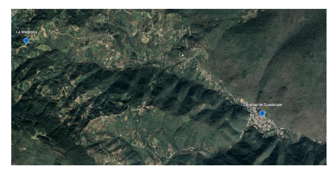
Figure 3. Google Earth capture of the distance and terrain between La Magnolia and Zacatlán de Guadalupe.

When prompted about added responsibilities related to their partners' migrations, women in this study mentioned 1) caring for livestock, 2) receiving, managing, and allocating remittances, as well as 3) caring for aging parents and grandparents as three forms of additional labor occasioned by their partners' absences. These responsibilities were added on top of women's already limited time and already heavy caregiver roles. For example, women responsible for cattle had to each morning guide them deep into the forest to feed and then, right before sunset, had to locate and cage them up for the night. This process is repeated daily. To pick up remittances, women reported leaving the community at 7:45 am on the morning transport to make the 14 km trek on unpaved road down the mountain to the nearest town, Zacatlán de Guadalupe .<sup>23</sup> Figure 3 is a satellite capture of the distance and terrain between the community and the town. Altogether, these tasks expand the boundaries of "caregiving labor" for the women in my study.