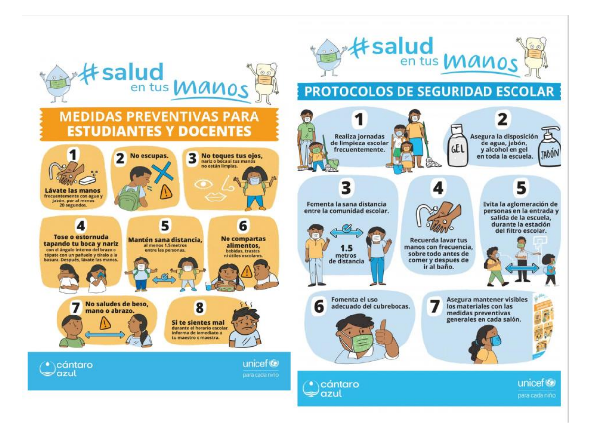
Figure 7: Two infographics released by UNICEF Mexico illustrating the main tenets of the Filtro Escolar.

that establishes guidelines schools have to abide by to return to in-person instruction (Secretaría de Educación Pública 2020). <u>Figure 7</u> includes two infographics by UNICEF Mexico that demarcates the main tenets of the reopening plan for schools (UNICEF Mexico 2022). In La Magnolia , due to limited school resources, the burden of ensuring these measures are being followed falls squarely on the shoulders of mothers.