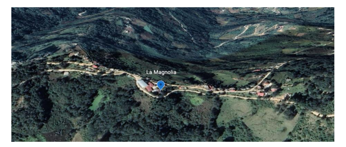
Figure 2. Google Earth capture of La Magnolia

surrounded by deep forests on all sides. Thus, the municipal government placed a preschool/ kindergarten [ Kinder ], elementary school [ Primaria ], and a middle school [ Telesecundaria ] in the community.<sup>15</sup> There is one teacher assigned to the preschool, two teachers to the elementary school, and six teachers to the middle school. The middle school serves the entire region, so children from neighboring communities make the daily trek to school, sometimes walking up to 2 hours through mountainous trails to access an education. In La Magnolia , the average schooling attained is 6.63 years, with females reporting 7.02 years and males reporting 6.21 years (INEGI 2020). This equates to roughly an elementary school education, but it lags behind the municipal average of 7.23 years and the state average of 10.48 years.