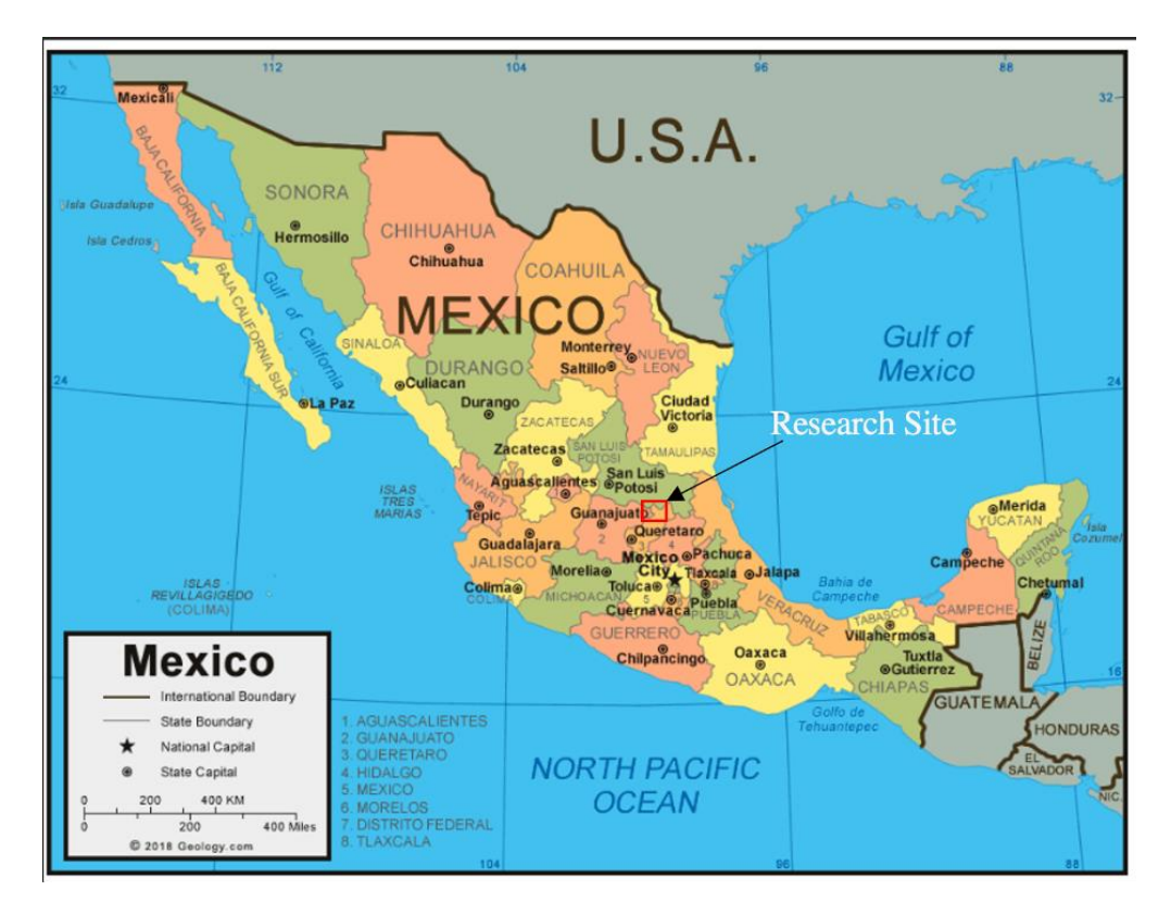
Figure 1. Map of Mexico identifying location of research site.

community to this town, there is one daily transport vehicle that comfortably seats twelve people.<sup>14</sup> This vehicle leaves every morning at 7:45 am and returns to the community around 3:30 pm and costs $60 MX round trip. This is the most cost-effective way to get to town. Calling a taxi costs $140 MX each way. From Zacatlán de Guadalupe , it is a 5-hour bus ride along winding roads to the capital city of Santiago de Querétaro. <u>Figure 1</u> is a map with the general location of my research site.