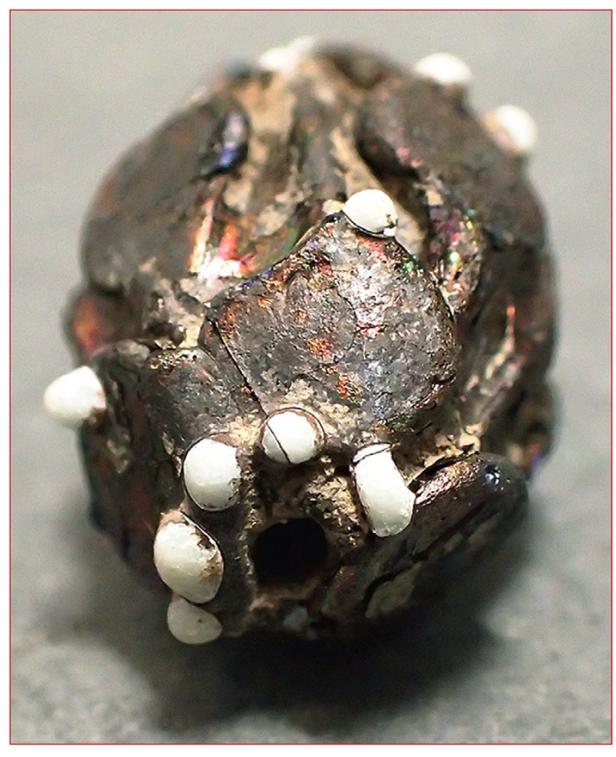
Figure 1. Side and end views of the Jamestown mystery bead. The red and green colors are iridescence caused by deterioration of the glass.

dots? This seems very labor-intensive for such a small product when there are easier ways of making black beads with white dots.