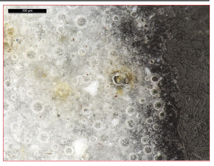
Figure 2. Microscopic view of the white glaze.

To create these varieties, drawn heat-rounded beads, likely strung on a wire, had a white glaze ap-