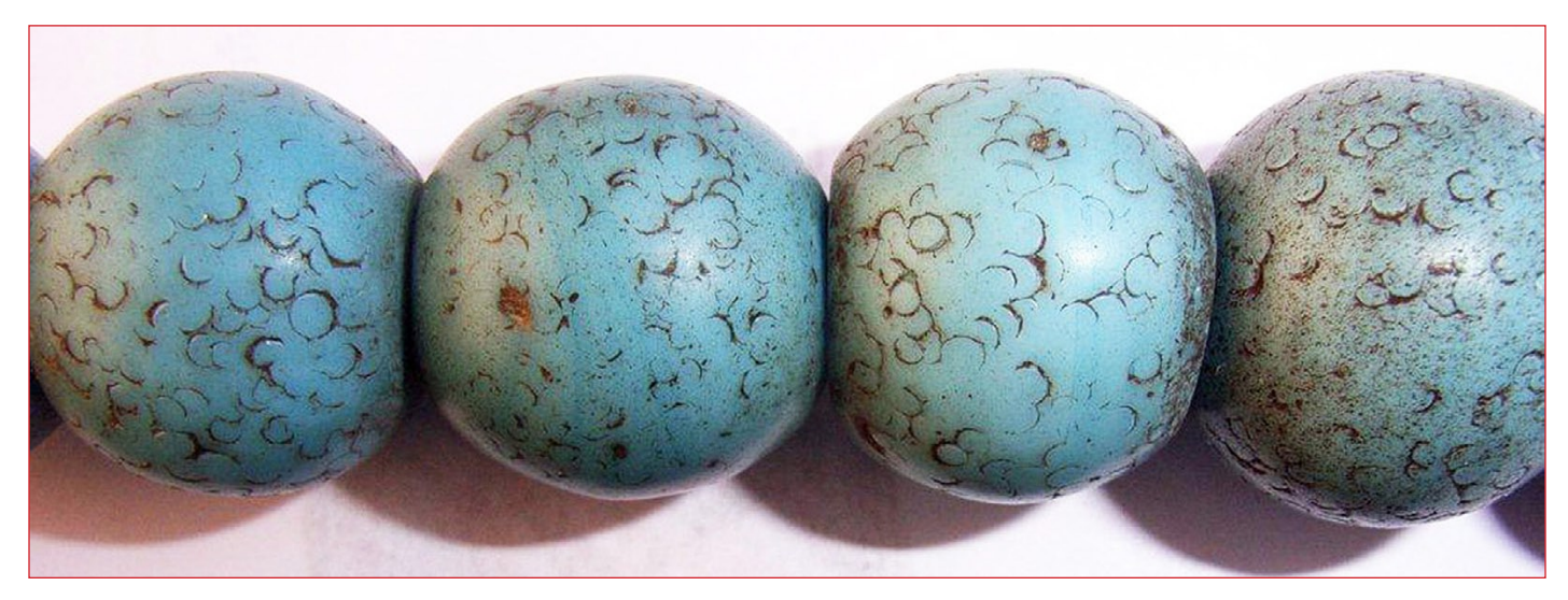
Figure 1. Tani heirloom "moon" beads from Arunachal Pradesh, northeastern India, showing typical half-moon marks.

These marks are found on both glass and stone beads, implying the marks are not related to manufacturing. Similar marks have also been reported on glass marbles. Daryl Wesley (2016: pers. comm.) also notes their presence on Australian contact-period flaked-glass artifacts. Furthermore, I've seen beads with these marks in Southeast Asia, a place where the beads could not have been frozen and