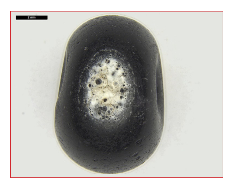
Figure 4. The variety with dots; side view.

also contact him if you would like the compositional data from the LA-ICP-MS analysis of the beads.