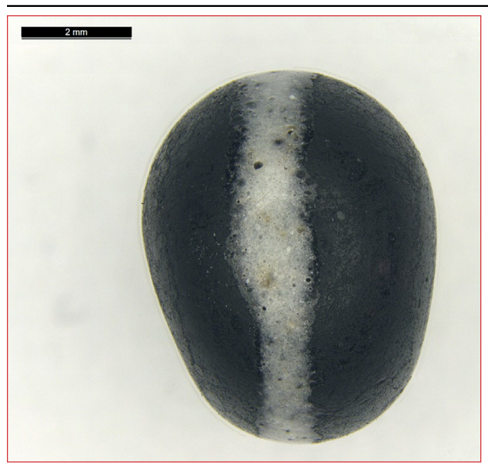
Figure 1. The variety with an equatorial ring.

The second variety was encountered at site DcEp5b, also on the north shore of the Saguenay River, within the boundaries of Anse-à-la-Croix, ca. 100 km east-southeast of Lac Saint-Jean and 75 km west of Tadoussac. Represented by two specimens, it also has an opaque black body that is adorned with three irregular white dots around the middle (Figures 3 and 4). The beads are 5.5-6.4 mm long and 7.4-9.3 mm in diameter with perforations that are 1.6-2.4 mm in diameter. These beads were found with very early artifacts, possibly dating to the 16th century, as well as some lithic artifacts which suggest the presence of Algonkian people. An opal wound bead (Kidd variety WIc2/3) was found in association with them (Langevin et al. 2002b, 2004a).