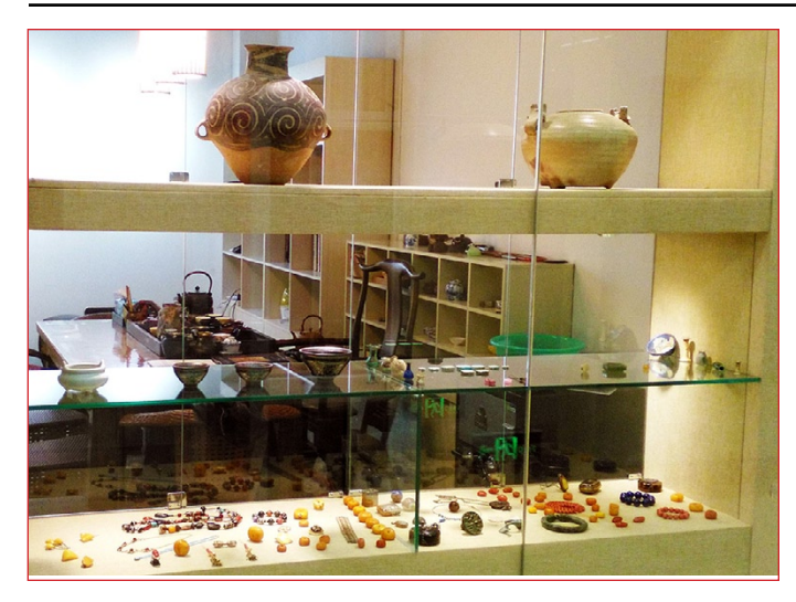
Figure 1. Part of the exhibit and lab space at the Beijing Bead Museum.

brary is one of the best in China as regards ancient art of different cultures.