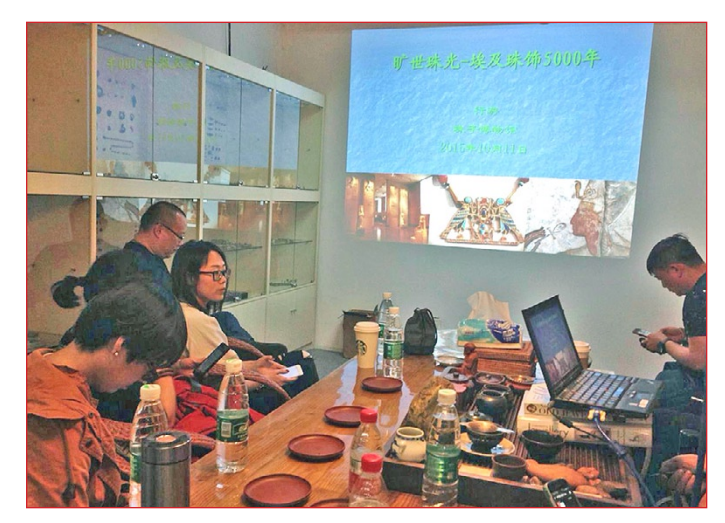
Figure 3. Lecture in progress at the bead museum.