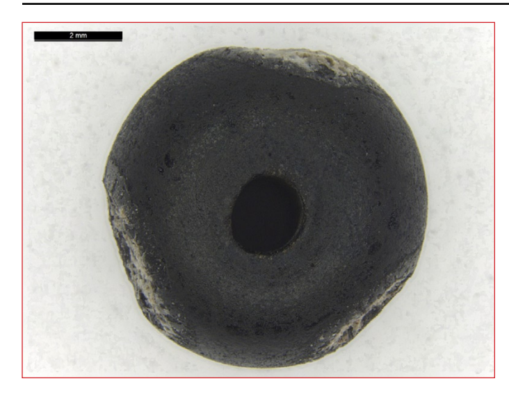
Figure 3. The variety with dots around the middle; end view.