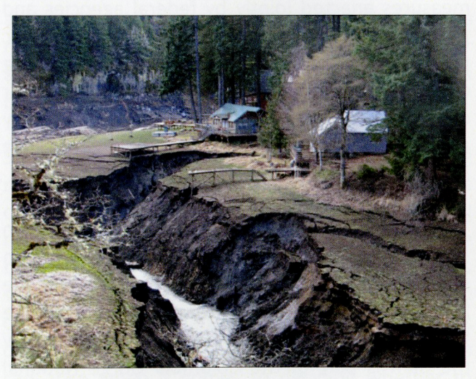
The White Salmon River after removal of the Condit Dam.

Under Section 106, data recovery is common mitigation when a site or structure is unable to be preserved in place or avoided due to certain federal undertakings. Prior to data recovery fieldwork, a data recovery plan is introduced which can include: the proposed project background, site description, justifications for carrying out data recovery, any research questions to be addressed by the data recovery, lab and/or field methods, qualifications of field personnel to be involved in the data recovery. 11 Data recovery techniques can entail collective surface and subsurface sampling of the site area utilizing backhoes or shovel test pits, or full excavation of the site. Data recovery efforts for the Powerhouse Bridge Lithic Scatter, a previously identified archaeological site within APE of the Condit Dam removal project, were completed using collective sampling techniques. 12 Results of the data recovery were submitted in a report to the Washington Department of Archaeology and Historic Preservation. Presently, the results of these efforts are not available to the public.