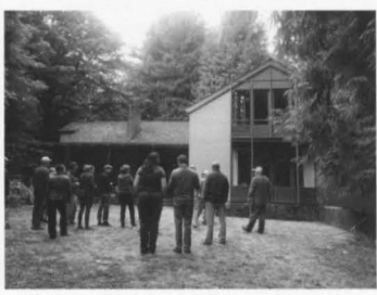
Assessing the exterior of the Cotrell House.

The Pacific Northwest Preservation Field School would not be possible without the partnership of a myriad of agencies, including the University of Oregon, the John Yeon Center, The National Park Service Pacific West Regional Office, The Oregon State Historic Preservation Office, Oregon State Parks and Recreation Department, Idaho State Historic Preservation Office, Washington State and Recreation Commission, Washington State Department of Archaeology and Historic Preservation. For more information about the Pacific Northwest Preservation Field School and the 2019 Field School, visit https:// archenvironment.uoregon.edu/hp/field-schools/ pacific-northwest-preservation-field-school.