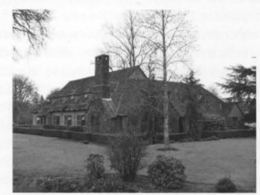
Oregon State Forester's Office Building, Salem, constructed 1938.

Civic Stadium was placed in the National Register of Historic Preservation (NRHP) in 2009.<sup>8</sup> It was determined to be significant under NRHP Criteria A and C at the local level for its association with the WPA, contribution to community development, and its architectural style.<sup>9</sup> If still standing the stadium would have been one of 14 known remaining wood baseball stadiums in the country and would have significance at the national level.<sup>10</sup>