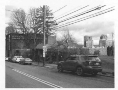
Oregon Ceramic Studio, Portland, constructed 1937.

the local and state level for its association with politics/government and as an exemplary example of National Park-style architecture constructed during the New Deal. 15