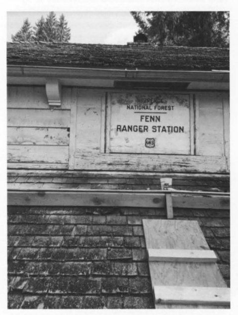
Fenn Ranger Station.

The 23rd annual Pacific Northwest Preservation Field School (PNWPFS) was held in the summer of 2017 at Fenn Ranger Station in Idaho. The circa 1937 ranger station sits in the Nez-Pearce National Forest and is composed of several buildings. The four sessions of the field school focused on window restoration. masonry repointing. uncovering and treating the buildings original wood siding, and creating a cultural landscape inventory. The PWNPFS is an opportunity for professionals and students to gain hands-on preservation across the states of Oregon, Washington, and Idaho.