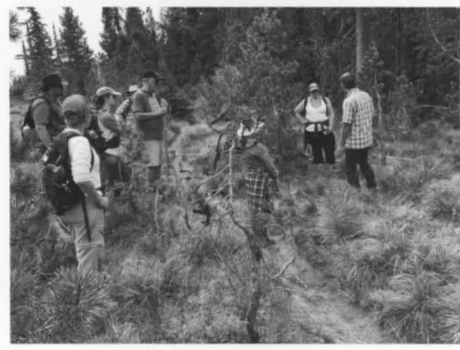
Participants studying a cultural landscape..