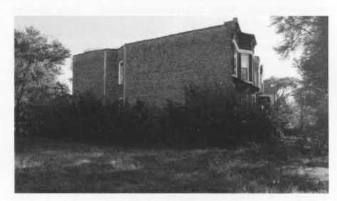
The home of Emmet Till in Woodlawn, Chicago.

The term "site of conscience" was popularized in preservation by the 1999 founding of the International Coalition of Sites of Conscience (ICSC). The creation of the ICSC was the manifestation of a growing movement in the United States towards recognizing the darker corners of history in an effort to foster dialogue and community healing.3 The goals of the ICSC and the general preservation of sites of conscience or difficult history are threefold: to interpret history through the context of site, to promote social justice and dialogue, and to create opportunities for community involvement.4 In the decades since the creation of the ICSC, this facet of preservation has become more widespread but still remains largely the responsibility of small, grassroots organizations. The National Park Service would not have overturned its usual stance against reconstruction as an unviable method of preservation at Manzanar if not for the urging to do so by various organizations composed of Japanese Americans, formerly interned peoples, and concerned citizens. 5 Sites of conscience across the United States depend on these types of organizations - from the landscape of enslavement being unearthed beneath Richmond, Virginia by the Defenders for Freedom, Justice and Equality to the current fight by Preservation Chicago to gain landmark status for the home of Emmett Till. 6