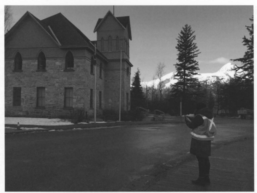
A student surveys.