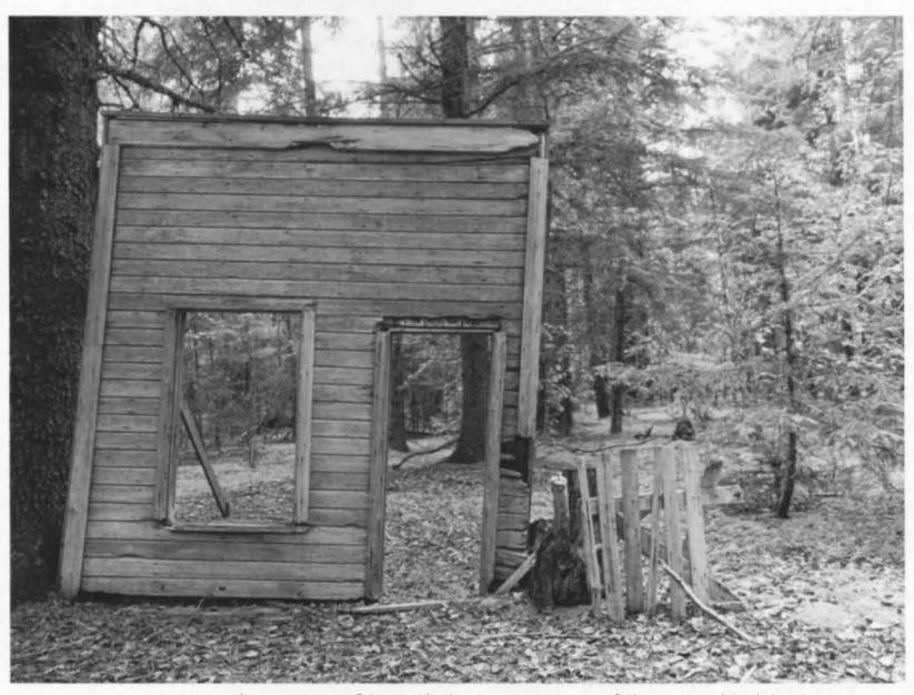
Last standing remnant of Dyea, Alaska. Image courtesy of The National Park Service. .