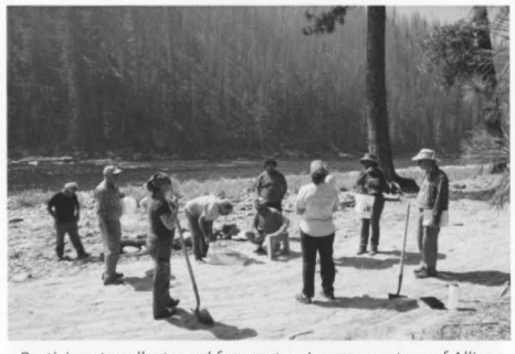
Participants collect sand for mortar.