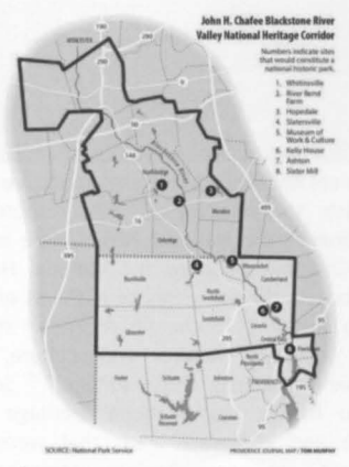
Borders of the Blackstone River Valley National Heritage Area.

By the early 20<sup>th</sup> century, the valley was no longer a vibrant cradle of industry. The textile manufacturing industry had collapsed within the valley and by the end of World War II, 90% of the factories on the Blackstone River had closed.3 By the end of the 20th century, the health of the Blackstone River was in peril. In 1990 the EPA described the Blackstone River Valley as "the most polluted river in the country with respect to toxic sediments."4 The population of the valley declined significantly until the late 1980s. However, the valley retained an impressive amount of the eighteenth and nineteenth century production systems that had fostered the textile industry, as the muted economic activity of the valley had restricted redevelopment. Its infrastructure was still largely intact, although it was threatened by urban sprawl and demolition. The valley was unique for its "wholeness" in this regard. In 1983, spurred by the Massachusetts and Rhode Island state governments, Congress asked the National Park System to assist the states in developing a park along the river, incorporating the abandoned industrial infrastructure. 6 The solution came three vears later in 1986, when the Blackstone River Valley became the second designated National Heritage Area.