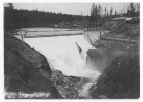
The Condit Dam in the Spring of 1913.

Before the construction of the dam, many fish species ran wild in the White Salmon River including trout, salmon, chinook, steelhead, and lamprey but the new dam blocked passage to upriver spawning grounds. Wooden fish ladders were installed following the original design of the Condit Dam, but a series of floods washed away the ladders including concrete ladders constructed in the 1920s to replace the wooden ladders. After the failure of the fish ladders, the state required the former owners of the dam, Northwestern Electric Company (now PacifiCorp) to construct a state fish hatchery.