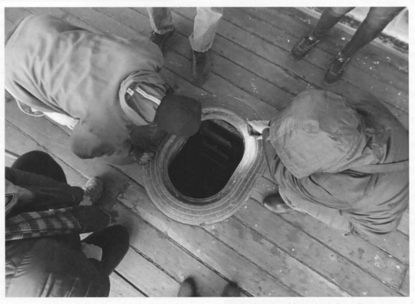
Students light below deck on the Astoria Tourist Ferry #2.