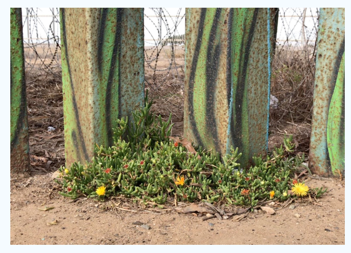
Border fence, Playas, Tijuana, MX, 2021

By definition ecotone is "a transition area between two adjacent ecological communities." This project uses audio as a way to explore my border community, examining ways to transform interviews into layered sound art pieces, including environmental field recordings from the region, interviewing cross-border populations, activists, organizers, and artists. Each interview is formatted into an hour-long episode which is then aired on the Tijuana-based Nett Nett Radio<sup>7</sup> which is streamed online and made accessible through monthly programming and internet archive. Ecotone works as an ongoing documentation of the thoughts expressed by fronterizo folks as a way to better understand the complex region of Tijuana-San Diego that I call home. This particular border area has overlapping communities with differences in economic class, culture, race, influence, and language. While these differences are significant, each community experiences a similar tension because of the nature of this territory, and the necessity of having to coexist in the same space. I look to this particular borderland to not only better