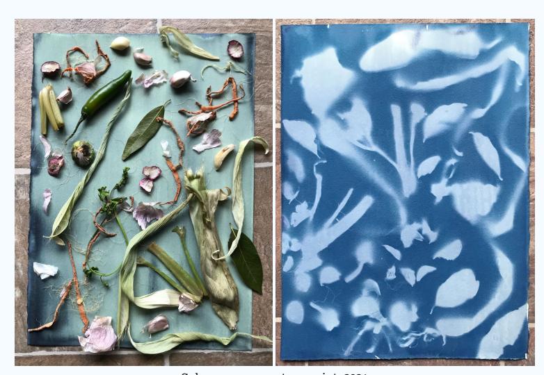
Sobremesa, cyanotype print, 2021