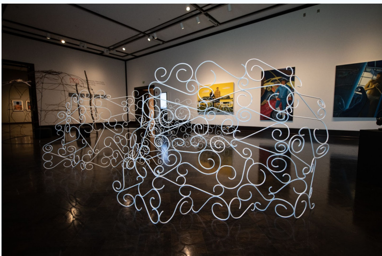
Permeable Boundaries, 3 x steel sculptures, Jordan Schnitzer Art Museum, 2023

"The U.S.-Mexican border es una herida abierta [open wound] where the Third World grates against the first and bleeds. And before a scab forms it hemorrhages again, the lifeblood of two worlds merging to form a third country–α border culture." - Gloria Anzaldúa