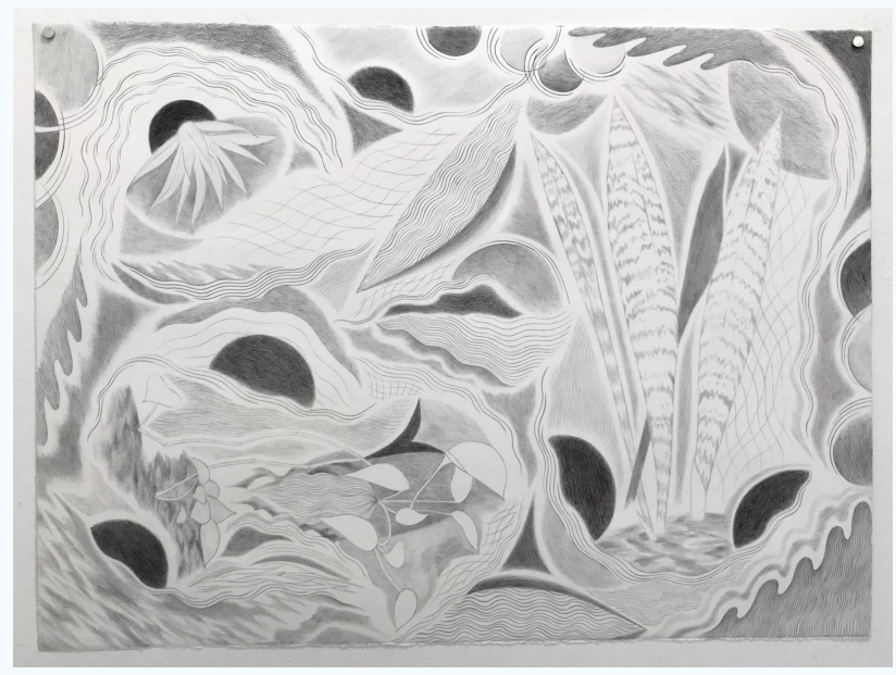
Florecer series, graphite drawing, 2021

Drawing is a somatic action, a state where I find healing and solace. I use drawing to contemplate an interconnectedness I feel towards the world around me. I allow the mark-making to be free-flowing, following the intuition of my hand, and embracing a meditative state. I began the Florecer series while traveling between Eugene, OR, Tijuana, MX, and San Diego, CA. I used transportable sizes of paper and pencils as I was crossing back and forth across the U.S.-Mexico border. These drawings coalesced as a mesh of plants, organic forms, patterns, and repetition. I referenced nature in my immediate environment such as houseplants at home, plants in my parent's garden, flowers on my daily walks, succulents growing in neighbor's front yards, and weeds growing out of sidewalks, all while observing detailed fragments and connecting them intuitively. There is movement expressed throughout each composition with dancing, floating, and flourishing elements. This drawing series became an expression of my interior feelings as I moved through and in between distinct geographic spaces.