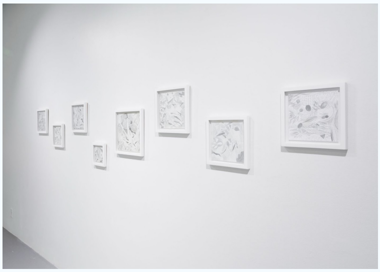
Florecer series, graphite drawings, LaVerne Krause Gallery, 2021

Drawing is a somatic action, a state where I find healing and solace. I use drawing to contemplate an interconnectedness I feel towards the world around me. I allow the mark-making to be free-flowing, following the intuition of my hand, and embracing a meditative state. I began the Florecer series while traveling between Eugene, OR, Tijuana, MX, and San Diego, CA. I used transportable sizes of paper and pencils as I was crossing back and forth across the U.S.-Mexico border. These drawings coalesced as a mesh of plants, organic forms, patterns, and repetition. I referenced nature in my immediate environment such as houseplants at home, plants in my parent's garden, flowers on my daily walks, succulents growing in neighbor's front yards, and weeds growing out of sidewalks, all while observing detailed fragments and connecting them intuitively. There is movement expressed throughout each composition with dancing, floating, and flourishing elements. This drawing series became an expression of my interior feelings as I moved through and in between distinct geographic spaces.