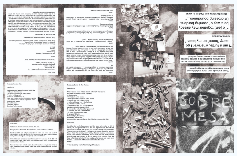
Sobremesa zine layout, 2021

I guess I start wondering... How much are we aware of the shift? Should we be aware? You know what I mean?