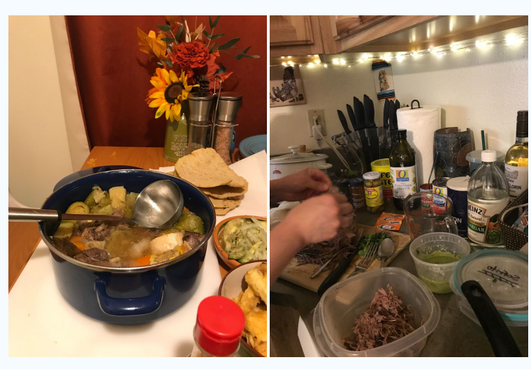
Left: Caldo de res, Right: Ropa vieja preparation