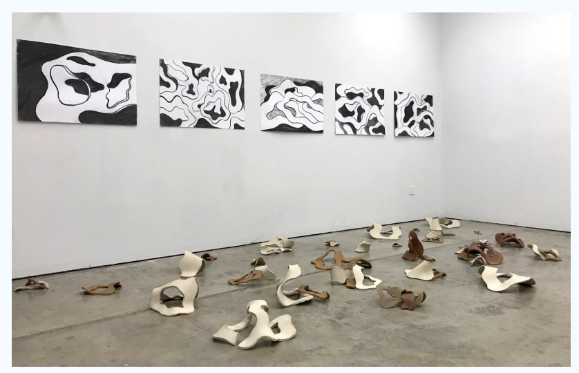
Territories Familiares, Installation, Millrace studios, 2022

Using similar shapes that recur in my drawings, I translate my patterns into three-dimensional forms, clustering them into varying sizes and compositions that exist beyond paper. Tracing the forms onto clay and turning the slabs into ceramic sculptures became a way to occupy physical space. Asking willing participants to move through the meandering pieces on a ground plane was an attempt for viewers to engage with the work in a way that engaged their bodies, creating the possibility for folks to reflect and slow down. Each sculpture has unique folds and contours, gathered in varying formations, representing different emotional states. Sometimes the clay sculptures crack and split during kiln firing, which I embrace rather than considering them failed objects. I see the cracks and breaks as visceral points of interest related to the way that I experience the delicate nature of familial relationships and the passing of life from one state to another. In creating these works, I intentionally leave open interpretation, while thinking about grief, portals, openings, falling apart, and coming together myself.