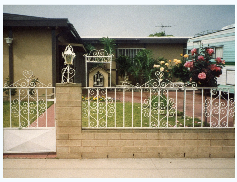
Montes home, Chula Vista, CA, 1990s

present and our current selves. There are variations in the visual symbol of Sankofa as well. One version is a profile silhouette of a bird looking to its back, reaching for an egg. I interpret the bird to be a visual representation of ancestors or perhaps our current self reaching out to the next generation in an infinite loop of remembering. There are poetic and speculative possibilities in ways Sankofa can be interpreted simply based on the bird and egg motif, without any understanding of its significance and deeply embedded history. Alternate interpretations of Sankofa are depicted with a heart-shaped motif which is a simplified version of the bird and egg using only lines, illustrating symmetrically reflected spirals, sometimes designed with lines at the bottom to imply a bird's feathers.