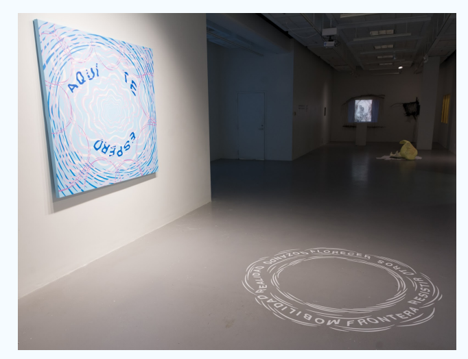
Aquí te Espero, Installation w/ audio, LaVerne Krause Gallery, 2021

"All of these politics of the United States and Mexico have the intention that people will get tired and get fed up. Every time they make it so that the people have to wait longer, and they make it more complicated to ask for asylum. A lot of people have to return to their home country. This is what the governments want. In exchange, we say "Oh there's no problem, I'll wait here (aquí te espero) dancing." It's a way to say fuck you. We have the right to resist and be happy in different ways. I think that it's a way to resist, and it has importance to a lot of things. To create community. So people can express themselves."