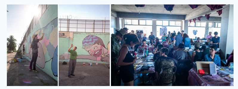
Left: Border wall mural w/ PANCA, Tijuana MX, 2015, Right: Tijuana Zine Fest, 2018

"Border artists inhabit the transitional space of nepantla. The border is the locus of resistance, of rupture, and of putting together the fragments." - Gloria Anzaldúa