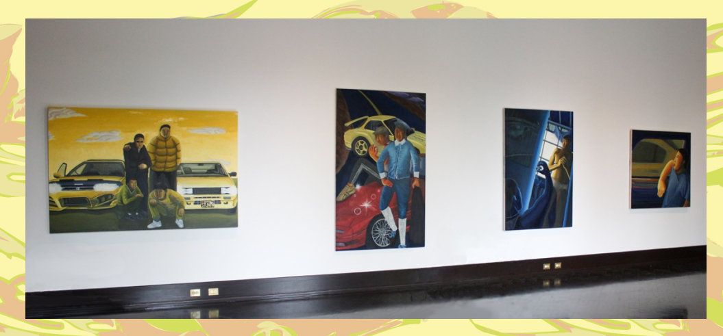
Thesis installation photograph from Jordan Schnitzer Museum of Art. 2023.

hoping to tap into the feeling of split identification and to take seriously the proposition that the photograph suggests, that these four young men with their cars are cool.