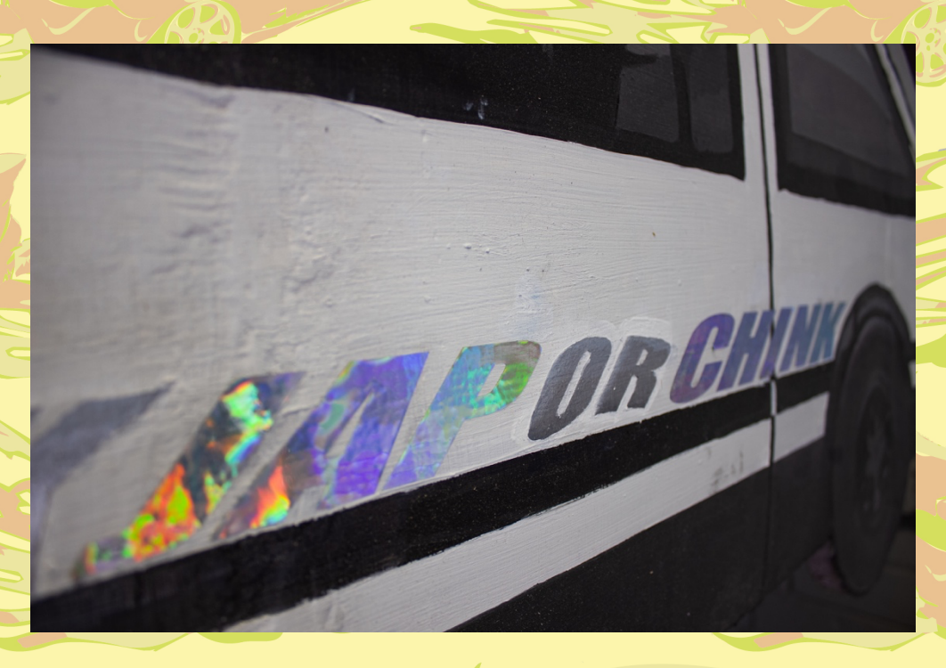
ACCELERATIONIST. Will Zeng. 21in x 62.5in, 21in x 62.5in. Oil and holographic vinyl on foam. 2022.

The graphic quality of the paintings and their stylized form juxtapose painful collective experience with the iridescent material, rendering the text both less visible and overexposed. The seductive surface carries a wink and a nod as if to say instead of the much less funny CHINK. The disconnect between two ways of presenting the same word offers the possibility of a reparative usage<sup>7</sup> that not only evokes the absurdity of how race functions in the West but point to an intraracial worldmaking based on support and solidarity.