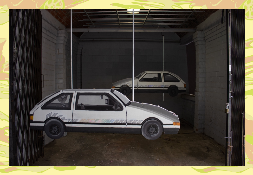
ACCELERATIONIST. Will Zeng. 21in x 62.5in, 21in x 62.5in. Oil and holographic vinyl on foam. 2022.

In ACCELERATIONIST , the words "WHEN THE RACEWAR BREAKS", "THEY WONT ASK JAP OR CHINK", are stenciled in metallic paint on the surface of two foam cut outs of a Toyota AE-86 facing opposite directions. The words "RACEWAR", "JAP", and "CHINK" are applied as pearlescent holographic surfaces. Drawing from Guytari Spivak's concept of strategic essentialism<sup>6</sup>, in which minority groups provisionally assert a shared identity to achieve certain goals despite differences within the group, ACCELERATIONIST proposes a moment of potential pan-Asian solidarity in the wake of an imaginary race war. While the narrative that the paintings suggest sounds dark, the work thinks about very real and violent historical racial conflations of Japanese and Chinese Americans – such as during the second World War or in cities, like Detroit in the 80's, during a financial downturn with the decline of the American auto industry. These paintings seek to honestly acknowledge the reality of (mis)racialization of Asian Americans, but to also offer the opportunity for intraracial alliance.