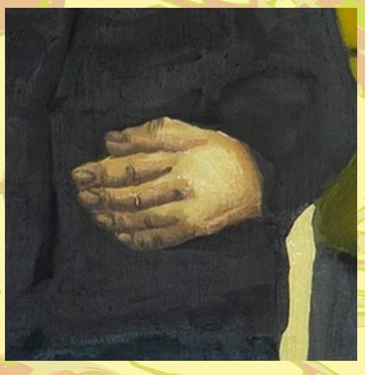
(left) Beggar with Duffle Coat (Philosopher). Édouard Manet. 73 7/8 x 43 1/4 in. Oil on Canvas. 1865/67. (right) STUNT. Will Zeng. Insert info. Oil on Canvas. 2023.