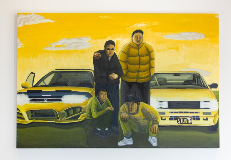
STUNT. Will Zeng. 52in x 78in. Oil and Acrylic on Canvas. 2023

STUNT is a horizontal yellow painting that depicts four figures, two standing two crouching, posing together with a car to their left and right during the daytime. The figures' gaze in a confrontational manner towards the viewer. The composition references an image of four young Asian American men wearing mostly yellow posing for the camera in front of their riced out yellow Honda Accord and Ford Mustang. Dating back to at least a 2009 Miata Turbo forum where posters debate the merits of Miata versus a Mustang GT, most uses of the image found on the web are mocking as seen in an early 2010's era meme website that is unafraid of trafficking in racialization of Asian Americans as inherently other, or on Asian American centric Facebook meme pages.