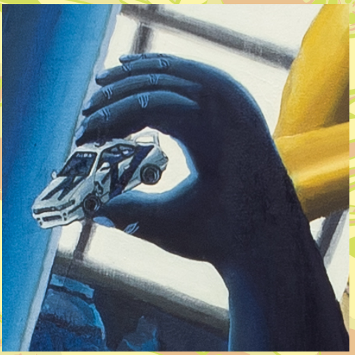
(left) Brainwashing Cult Cons Top TV Stars. Martin Wong. 30 x 40 in. Acrylic on Canvas. 1981. (right) LIKEACARONAFULLTANK. Will Zeng. 47 x 66 in. Oil on Canvas. 2023.