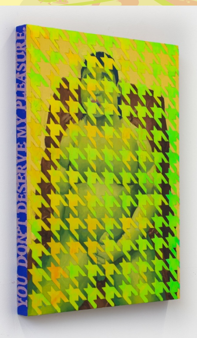
YOU DON'T DESERVE MY PLEASURE. Will Zeng. 32 x 24 inches. Oil and holographic vinyl on panel. 2021.

male subject. Understood through this lens, the intimate often fumbling quality of the painted gesture, especially in the floral wallpaper, takes on a tenderness that complicates the narrative of the castrated subject.