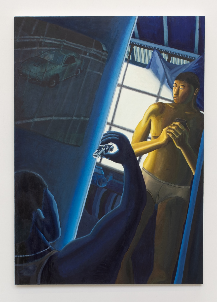
LIKE A CAR ON FULL TANK. Will Zeng. 41in x 66in. Oil on Canvas. 2023.

I am drawn to the use of toy cars as subject because of their reference to childhood and the set of associations that this diminutive form carries around play and imagination. A primarily blue painting, LIKE A CAR ON FULL TANK , depicts an intimate moment between two figures, a blue figure who we see from the behind wearing a tank top and a yellow figure on the right in his underwear. The blue figure ponderously holds the toy car on a diagonal that mirrors the representation of the car on the poster on the upper left of the painting. Within the logic of the painting, both representations allude to the car but are not the real thing, making the car an object of unrealized desire. This lack,