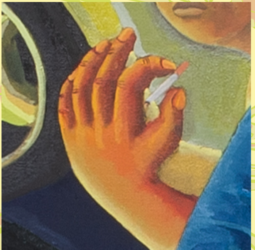
(left) Painter's Hand. Phillip Guston. 36 x 32 in. Oil on Canvas. 1979. (right) AROUND THE CURVES. Will Zeng. 78 x 48 in. Oil on Canvas. 2023.

All figure painting sits on a spectrum between fully clothed and nude, with a large proportion of clothed figures only revealing their faces and their hands. As such, the hands take on an important role in the expressive capacity of a figure. The following artists use the real estate of the hand to define a body's position, to complicate the dichotomy between language and image, and to signal the visceral.