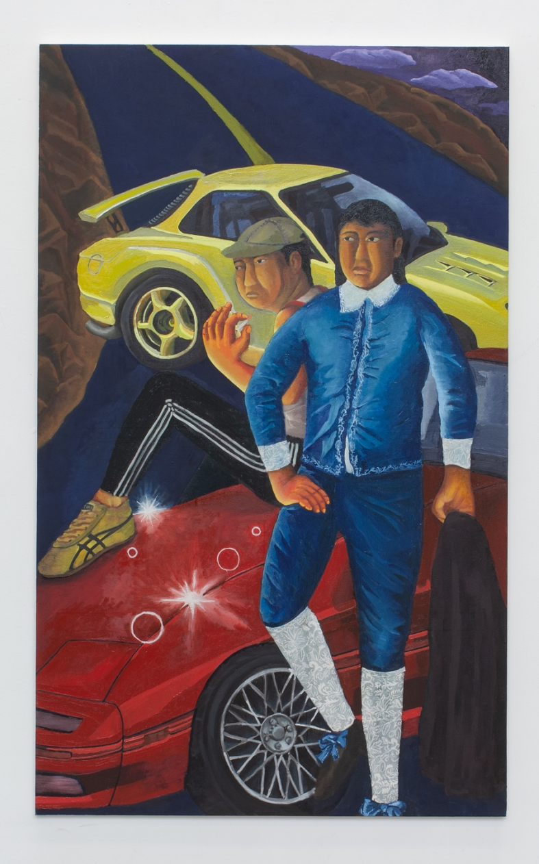
AROUND THE CURVES. Will Zeng. 78in x 48 in. Oil on Canvas. 2022.

How can fashion, like the picture plane, act as a space for embedding signification? AROUND THE CURVES depicts a figure sitting on a shiny red car, wearing black and yellow Asics that reference Bruce Lee's yellow jumpsuit in the Game of Death . Another standing figure wears an anachronistic light blue silk outfit with white lace that directly references Thomas Gainsborough's Blue Boy . This painting, of a young boy in blue which was completed in 1770, has gone through a series of resignifications throughout