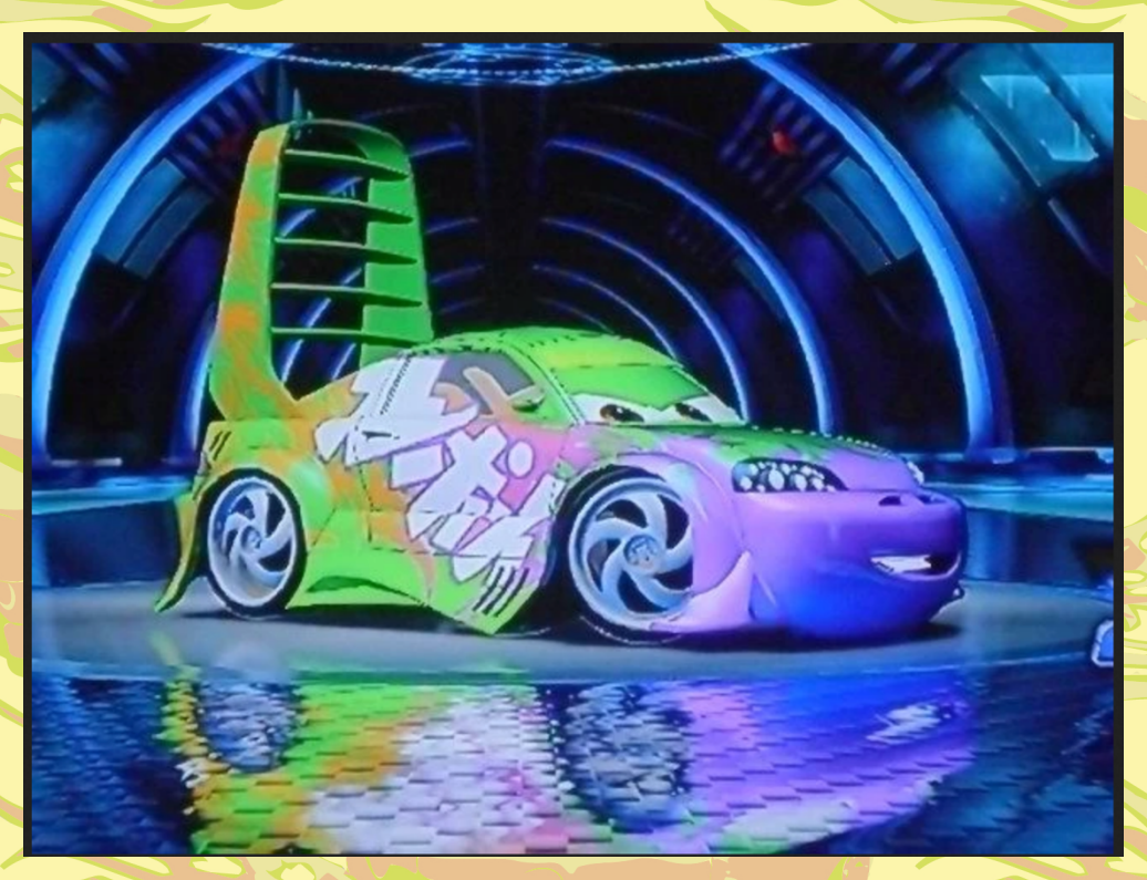
Wingo in Cars 2: The Video Game - "https://pixar.fandom.com/wiki/Wingo"

This work also builds upon the visual motifs of work prior to the import cars, such as the yellow figure in PEEK . Like in previous work, the ambiguity and suggestion of a sexual encounter imbues the work with a sense of queerness.