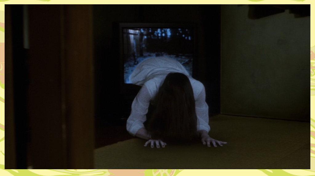
Sadako crawling out of television. Ring. Directed by Hideo Nakata. Toho. 1998.

Hideo Nakata's The Ring (1998) follows a woman and her ex-husband as they investigate the origin of a cursed video tape that kills anyone who watches it after seven days. One of the most iconic scenes comes in the third act twist when the ex-husband, who thinks he is safe, witnesses the girl who cursed the video tape clawing her way out of the television to kill him. One reason why the image of this girl bursting out of the screen is so indelible is because <sup>15</sup> it disrupts the unidirectional relationship between viewer and viewed. The horror comes from the realization that every time a character was gazing into the screen, somebody in the screen was gazing back.