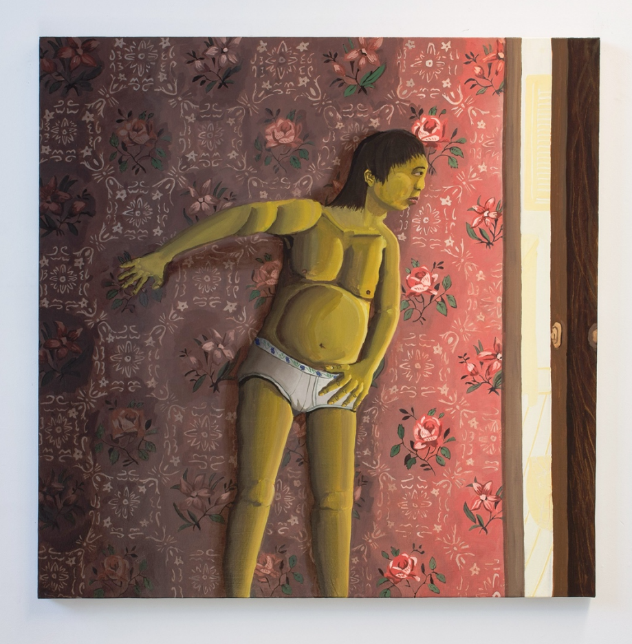
PEEK. Will Zeng. 52 x 52 inches. Oil on Canvas. 2021.

This vulnerability is perhaps most evident in PEEK , as the composition centers a jaundiced figure in white briefs set against a pink rose floral wallpaper. The figure –with his right-hand pressed against the wall, and his left-hand hovering over his thigh, adjacent to his crotch– looks into a slightly open door from which light emanates. Frozen in action, this composition builds tension through the unresolved ambiguity and intimacy of the bodily gesture and facial expression. The lit interior reveals truncated sections of a window with blinds, a dresser, and a pair of jeans. Through the composition's particular inclusions and exclusions, the painting explores the relationships between knowing and not knowing, pleasure and shame, and presence and absence.