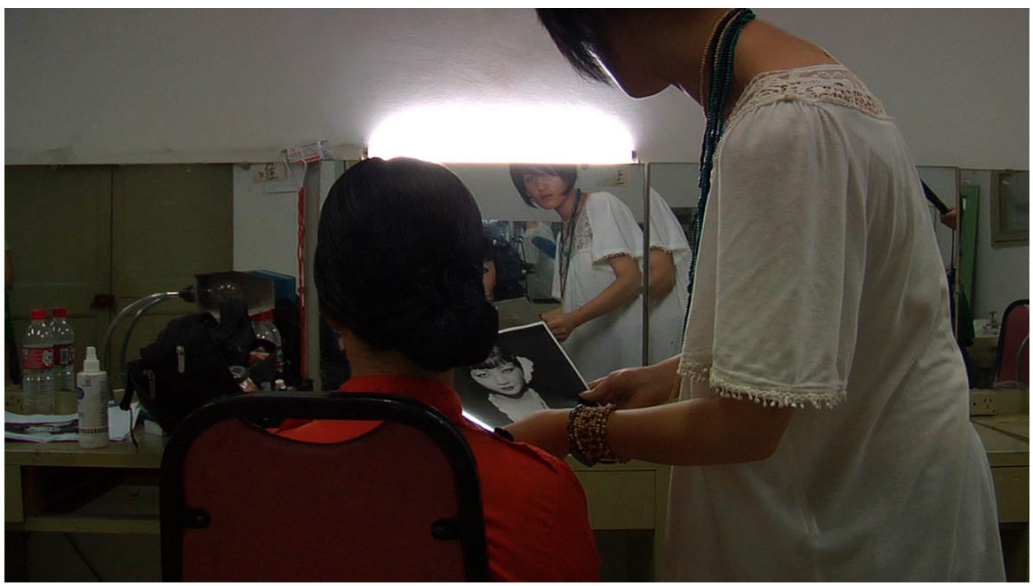
Figure 8.3. Patty Chang, The Product Love – Die Ware Liebe, 2009. Image courtesy of artist.

that the knocking on the table assimilates a German means of expressing satisfaction following a performance, like applause. Chang plays with these various interpretations springing from the English cognates "would" and "wood," while teasing out the sexual implications of "touch wood" coinciding with Benjamin's seeming infatuation with the actress (Pollack).