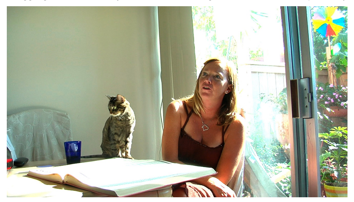
Figure 8.2. Patty Chang, The Product Love - Die Ware Liebe, 2009.

The Product Love's first video alternates between three translators struggling to translate Benjamin's article into English. "He writes sort of poetically