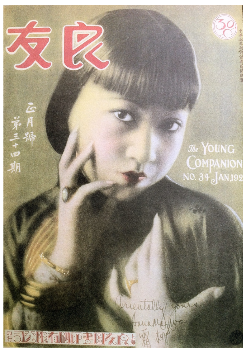
Figure 9. Cover image featuring Anna May Wong. On Liang You/Young Companion, no. 34 (January 1929).

interracial marriage (passed in 1872 and not repealed until 1948). The anti-miscegenation law posed a major obstacle for Wong as Hollywood's codes strictly forbade interracial couples from partnering and kissing on screen. Fed up, in 1928, Wong sojourned in Europe, where she played leading, sexually liberated roles, breaking free from Hollywood's stereotypes and her family's Confucian values. In 1936, she traveled for the first time to China, emerging as one of the most international figures of the early to mid-twentieth century.