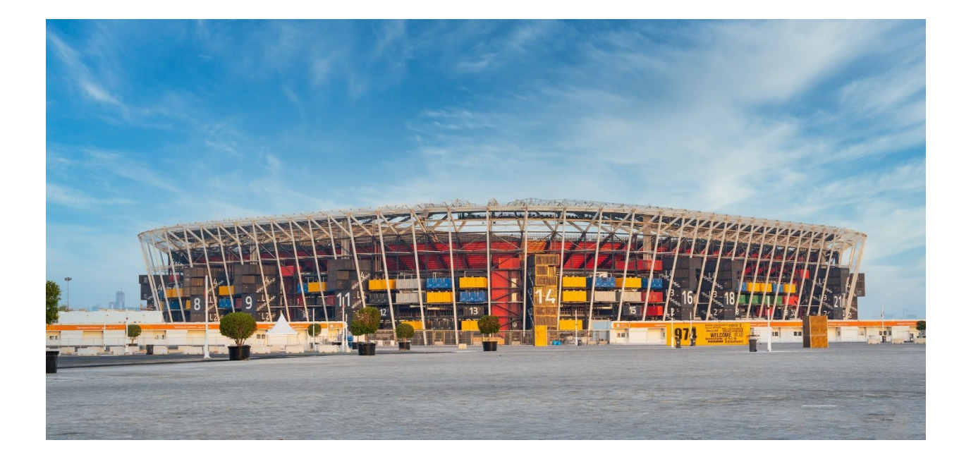
Figure 8. The modular, first-of-its-kind Stadium 974 outside of Doha.<sup>172</sup>

demountable in the history of the World Cup.<sup>170</sup> Additionally, it could prove to be a blueprint of limiting the 'white elephants' left behind by mega-sporting events while reducing the cost, waste generated, and the resource usage that constantly goes into stadium construction. Most of the other stadiums will be scaled down and host domestic football clubs and other sporting events. Uniquely, the Lusail Iconic Stadium, the largest stadium in the country and host to the World Cup Final, is being turned into its own community, complete with residences, schools, shops, and clinics.<sup>171</sup> Similar plans are in place for the Al-Bayat and Al-Thumama stadiums. Qatar's displayed self-awareness around the use of large stadiums, the difficulties around their upkeep, and the willingness to transform them in order to serve completely different purposes is a unique step to take.