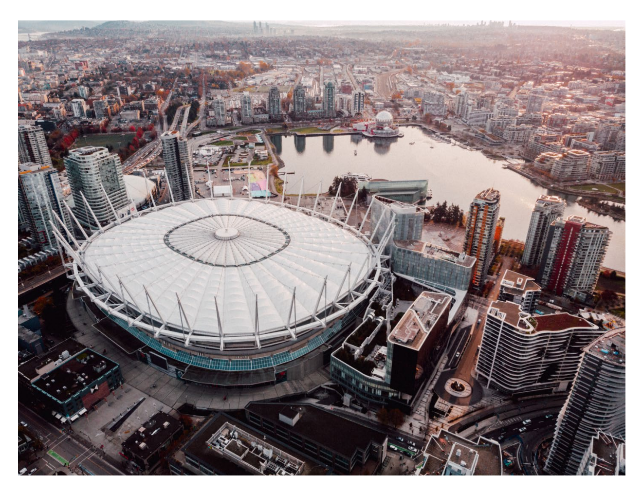
Figure 1. BC Place and Rogers Arena (formerly General Motors Place) in Vancouver.<sup>48</sup>

The gateway into Vancouver and greater British Columbia was considered to be the Vancouver International Airport. It had experience in handling significant traffic and operating 24 hours/day in any snow and ice conditions.<sup>49</sup> Vancouver had no plans to make specific road improvements, feeling that its existing road infrastructure was satisfactory. Additionally, public transit had a firm foothold in how Vancouver citizens moved through the region. It was clear that Vancouver's existing road and public transit infrastructure, combined with experience in hosting other large events and the intra-region travel it spawned successfully, lead to confidence in its