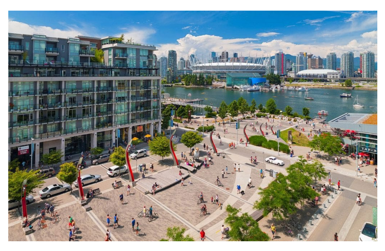
Figure 2. Site of what was the Olympic Village in Vancouver, now a housing complex.<sup>57</sup>

Whistler Olympic Village, for example, went on as planned and fulfilled its role as employee housing for the Whistler Ski Area.56