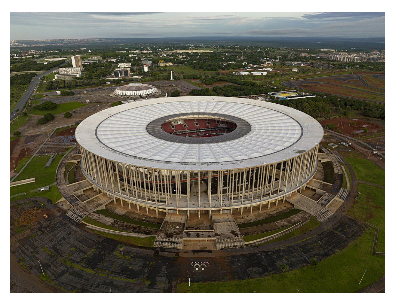
Figure 4. Estádio Nacional in Brasília in 2022.<sup>119</sup>

an integral part of the community and it limited crowd sizes.<sup>118</sup> Brazil ultimately left stadiums in unfeasible locations and with costs that couldn't justify their use.