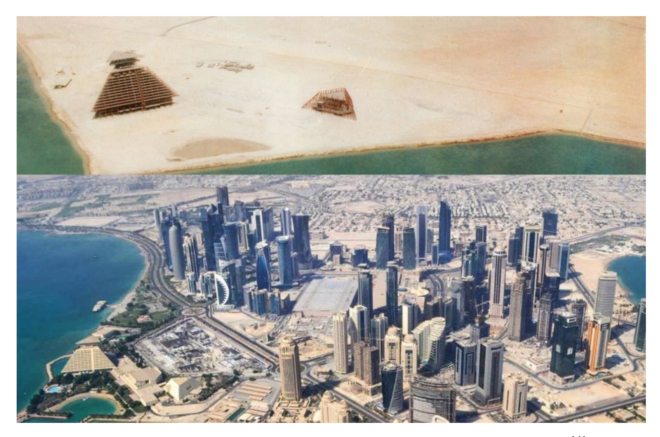
Figure 6: Doha's West Bay, Qatar, in the late 1970's (top) vs. 2019 (bottom).<sup>141</sup>

concluded their season, but Qatar's average daytime temperature exceeds 104° Fahrenheit during these months.<sup>139</sup> Ultimately, FIFA in 2015 made the unprecedented move to push the 2022 World Cup back to November and December for player safety, which interrupted domestic league play.<sup>140</sup> Ultimately, Qatar to many observers came across as an unprecedented country of choice for hosting the World Cup.