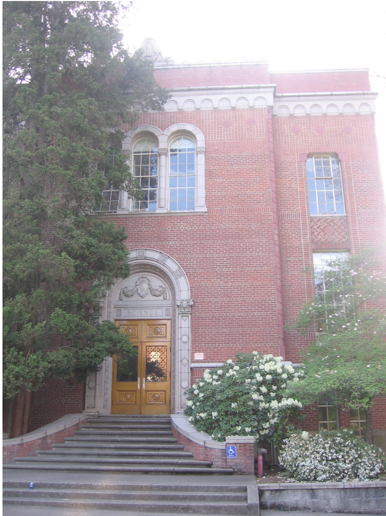
Figure 1. Condon Hall, Main Entry (east facade)