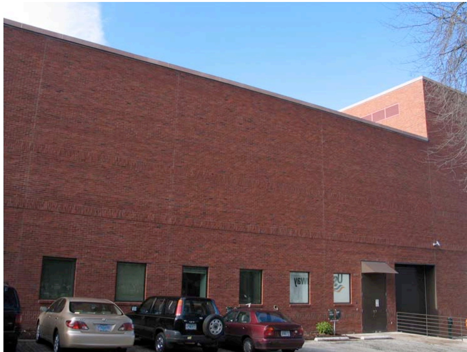
Figure 1. Museum of Art rear elevation/2004 addition