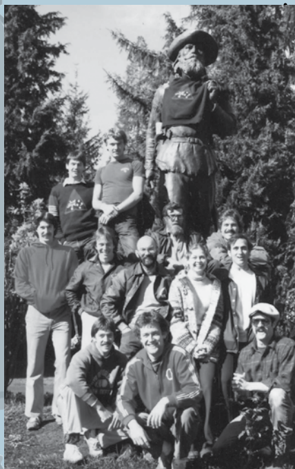
Aussie students and colleagues gather around the Pioneer Father in ca. 1983.