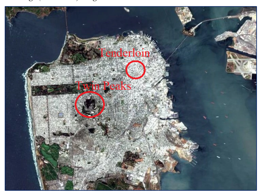
Figure 5. A Satellite Image of San Francisco, California, with Added Ovals Highlighting Tree Canopy in High-Coverage (Twin Peaks) and Low-Coverage (Tenderloin) Neighborhoods.<sup>200</sup>

The Tenderloin and Twin Peaks neighborhoods are highlighted in the satellite image in Figure 5, where one can see much more greenspace in the wealthier Twin Peaks neighborhood.<sup>199</sup>