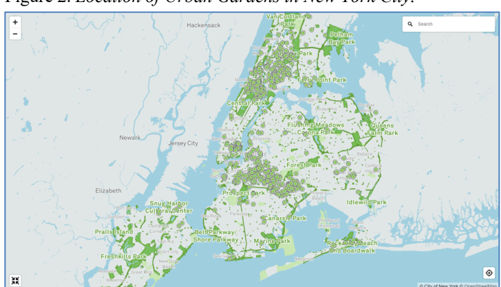
Figure 2. Location of Urban Gardens in New York City. 80

However, gardens are feasible within the inner city. Figure 2 is a map wherein each light green circle represents a link to information about a community garden in that location, showing the promising prevalence of community gardens in New York City.<sup>79</sup>