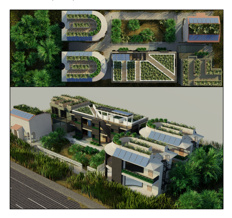
Figure 1. Renderings of a Hypothetical Subdivision Conditioned on a Neighborhood Garden, a Trail Easement for Pristine Greenspace, and a Cluster of Energy-Efficient Multifamily Residences, Showing Top-Down (top) and Overhead (bottom) Views.<sup>7</sup>