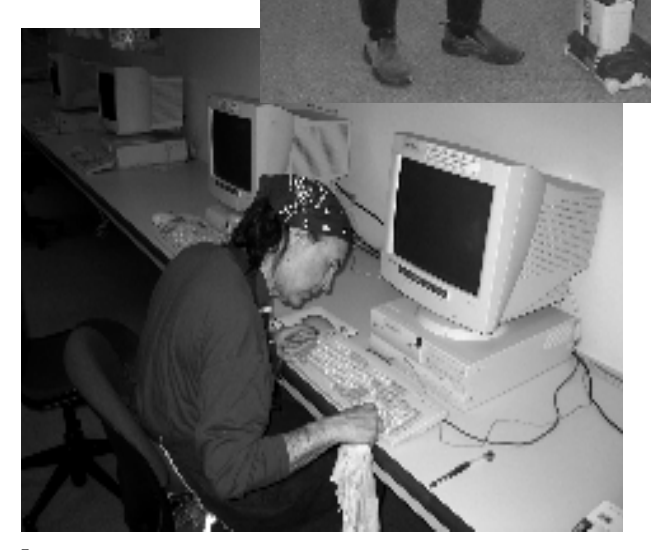
LIBRARY STAFF MEMBERS CLEANED, POLISHED, AND PAINTED AT THE FIRST ANNUAL LIBRARY DAY.

event that supports our goal of keeping our facilities attractive and user friendly."