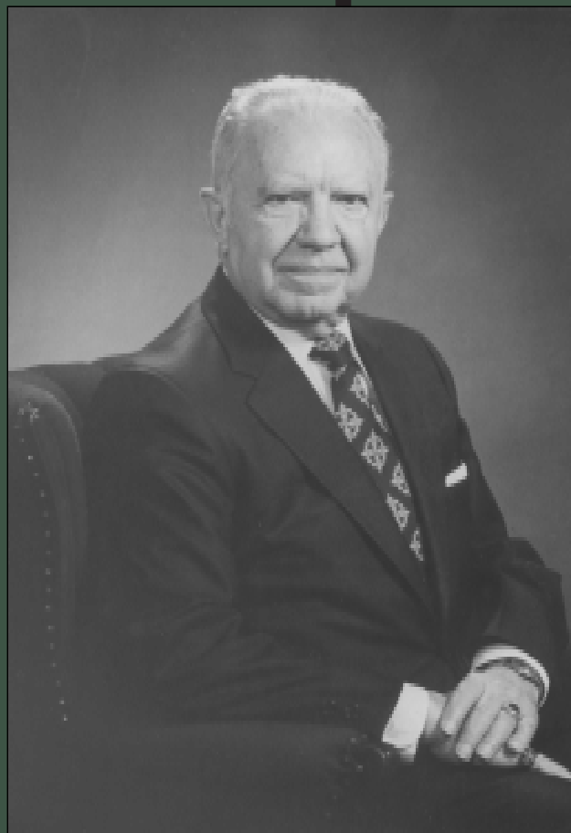
The Legacy of Orlando Hollis 1904–2000