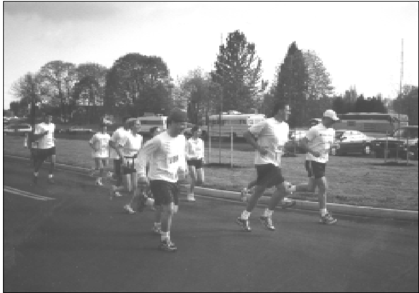
Runners cross the finish line in a run raising money for a scholarship in the name of their classmate who exemplified the spirit of life.