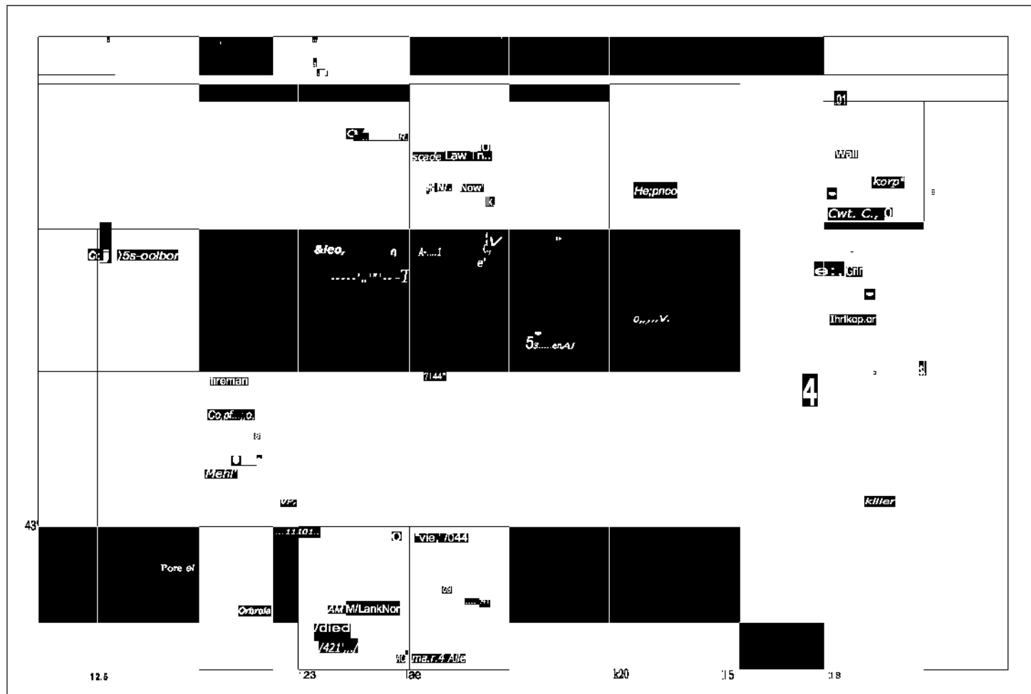
FIG. 2 IMPORTANT PLEISTOCENE VERTEBRATE LOCALITIES OF OREGON